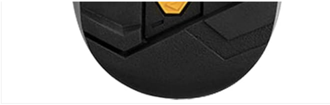
Image 3: Cleat installed on a cycling shoe, demonstrating the interface with the pedal.