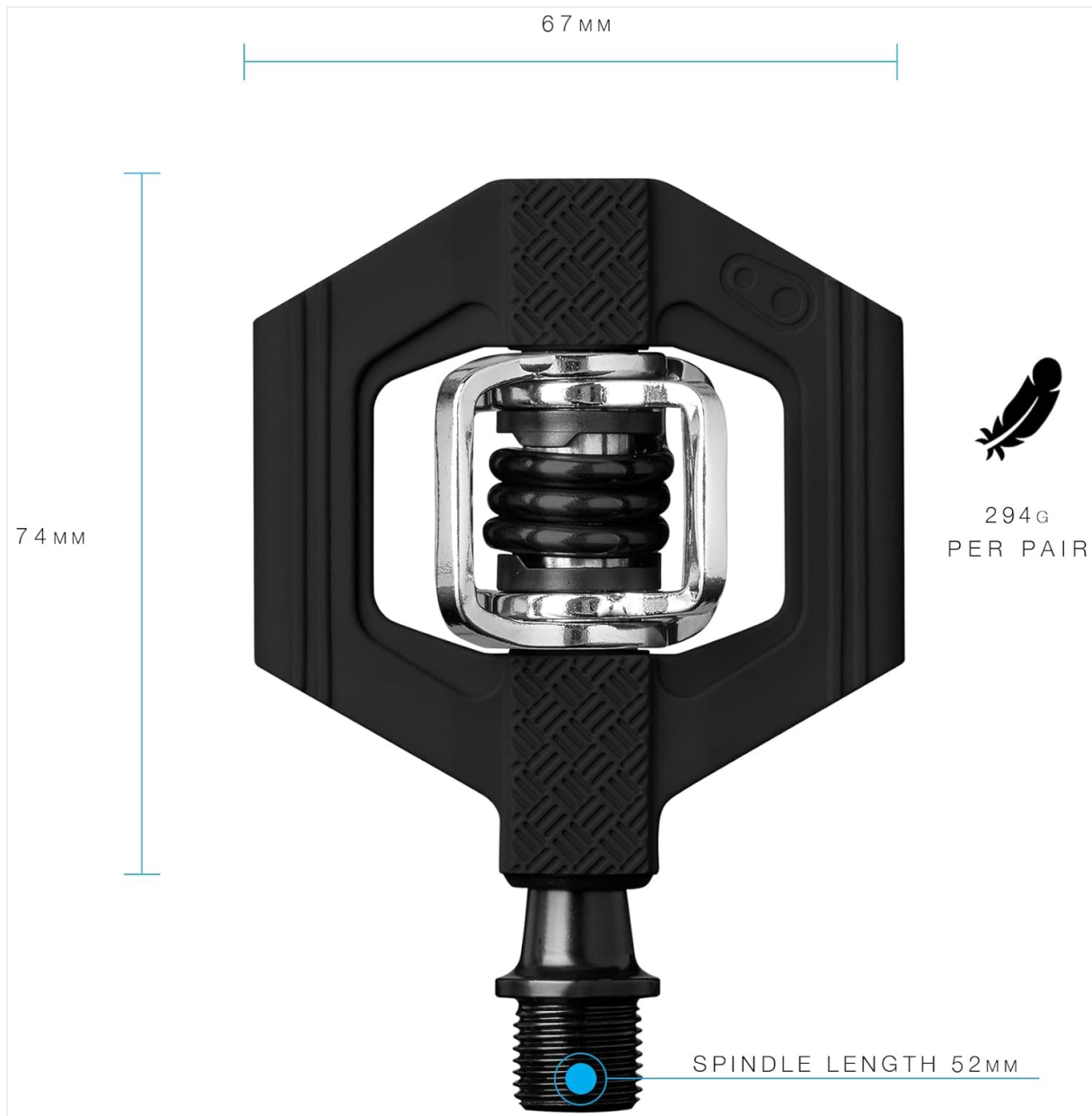
Image 6: Dimensions and weight of the Crankbrothers Candy 1 Pedal.