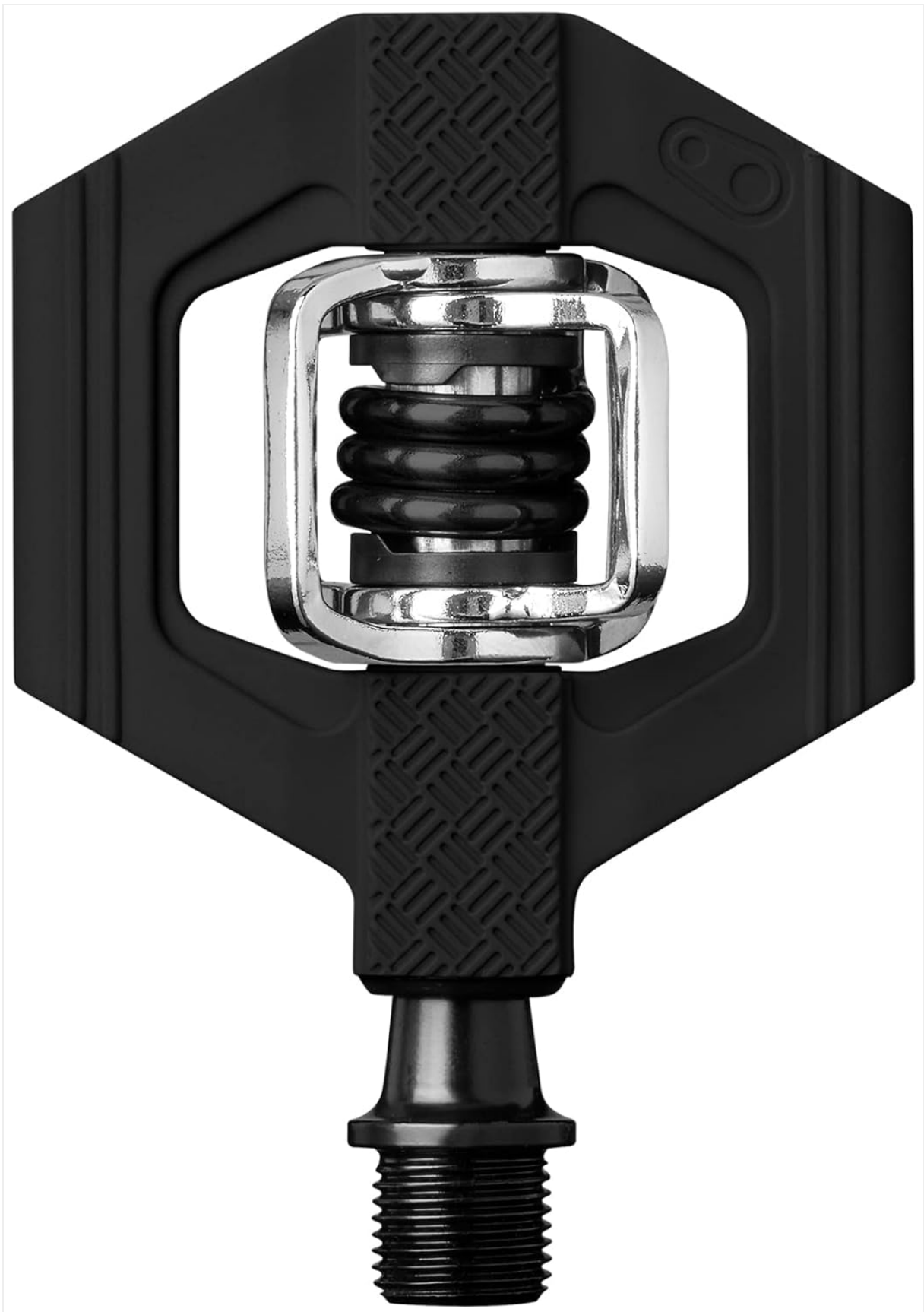
Image 1: Front view of the Crankbrothers Candy 1 Clip-In MTB Bike Pedal.