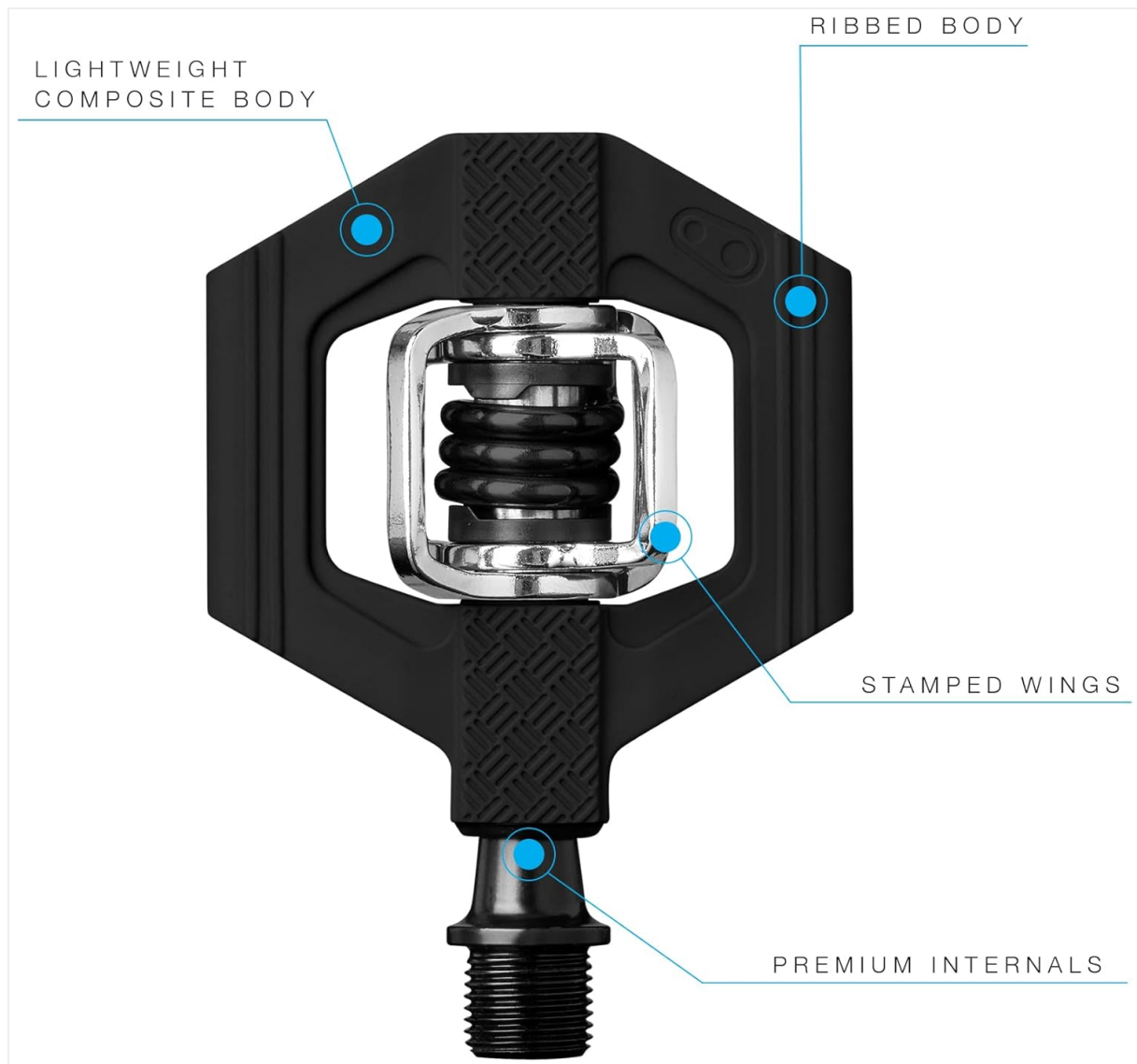
Image 5: Exploded view of the Crankbrothers Candy 1 Pedal, illustrating its internal components for maintenance reference.