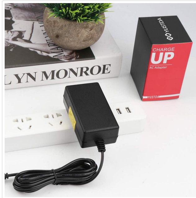
Image 2.1: The YUSTDA AC/DC Power Adapter connected to a power strip, demonstrating proper connection to a power source.