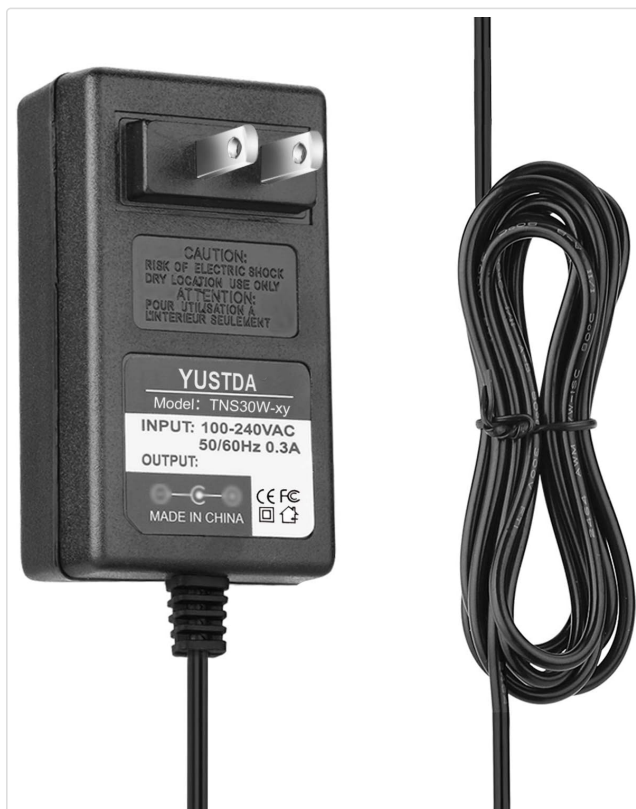
Image 1.1: The YUSTDA AC/DC Power Adapter, showing the main unit with its label and the attached power cable.

This manual provides instructions for the YUSTDA AC/DC Power Adapter Wall Charger, Model A1806111466. This adapter is designed to provide power to compatible DR.J 9.5", 10.5", and 14.1" Portable DVD Players.