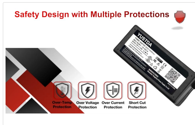
Image 3.1: Visual representation of the multiple safety protections integrated into the adapter's design.

Important: The adapter may become warm during prolonged use. This is normal. If it becomes excessively hot, disconnect it immediately and contact support.