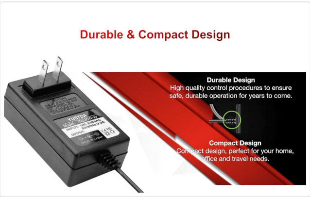
Image 4.2: The adapter's durable and compact design, engineered for reliable performance and portability.