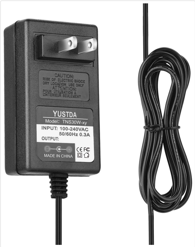
Image 6.1: The product label on the adapter, detailing input and output electrical specifications.