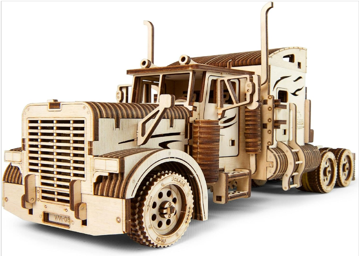
Figure 1: Assembled UGEARS Heavy Boy Truck VM-03 with key specifications. The model measures 15.5 inches (380 mm) in length, 5.1 inches (135 mm) in width, and 6.7 inches (178 mm) in height. It comprises 541 parts, with an estimated assembly time of 8-9 hours, and is rated as an advanced skill level model.