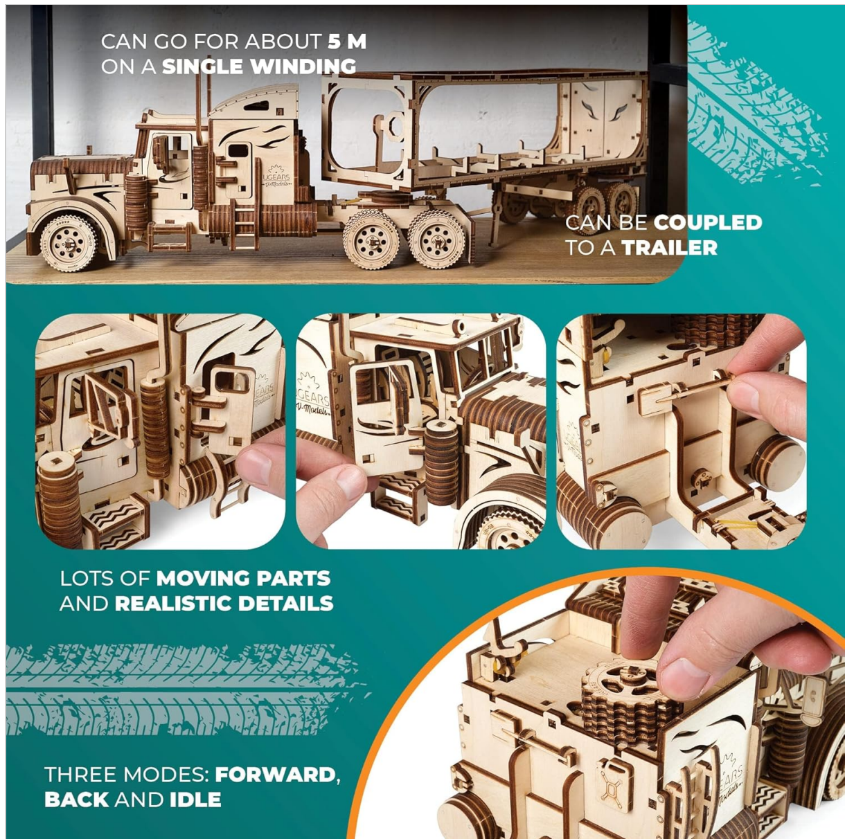
Figure 4: Illustrates the intricate moving parts and the three operational modes (Forward, Back, and Idle) of the Heavy Boy Truck VM-03, controlled by a gear mechanism.