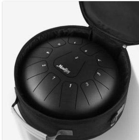
Image: A detailed view highlighting the drum's construction from steel alloy, the arrangement of 11 tones, and the non-slip rubber feet for stability.