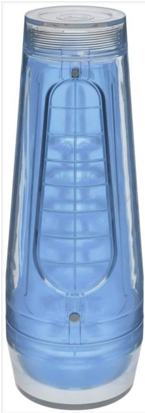
Image 1.1: The Doc Johnson Main Squeeze OPTIX™ Stroker in Crystal Blue, showcasing its transparent outer casing and internal texture.