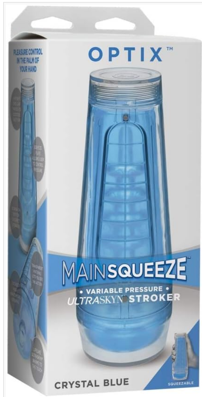
Image 2.1: The Doc Johnson Main Squeeze OPTIX™ Stroker in its retail packaging.