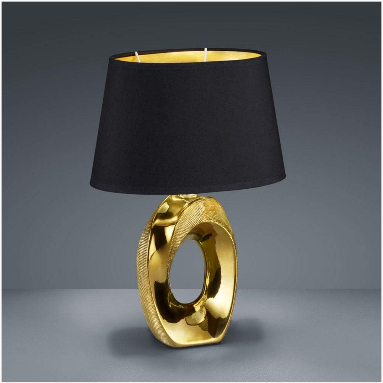
A close-up view of the Taba table lamp, highlighting the texture and finish of the gold ceramic base and the black fabric shade.