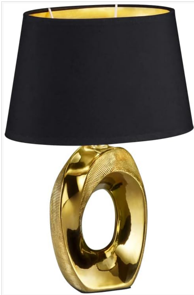
This image shows the assembled Taba table lamp, featuring its distinctive black fabric shade and a textured gold ceramic base.