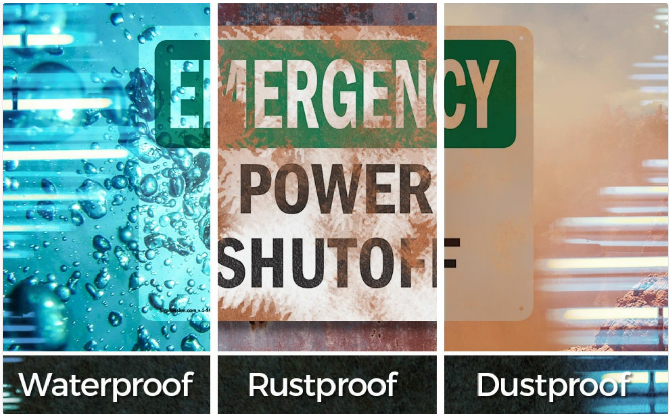
Image 5.2: Illustration demonstrating the sign's resistance to water, rust, and dust, ensuring durability in various conditions.