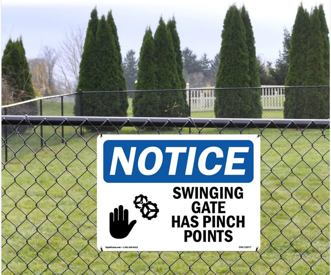
Image 3.1: A SignMission sign mounted on a chain-link fence, illustrating the 4-corner holes designed for easy installation.