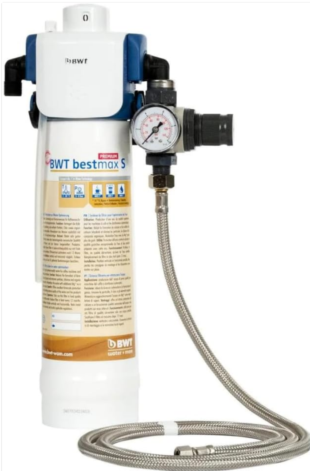
Figure 4: An example of the BWT Besthead FLEX installed with a filter candle and connected hoses.