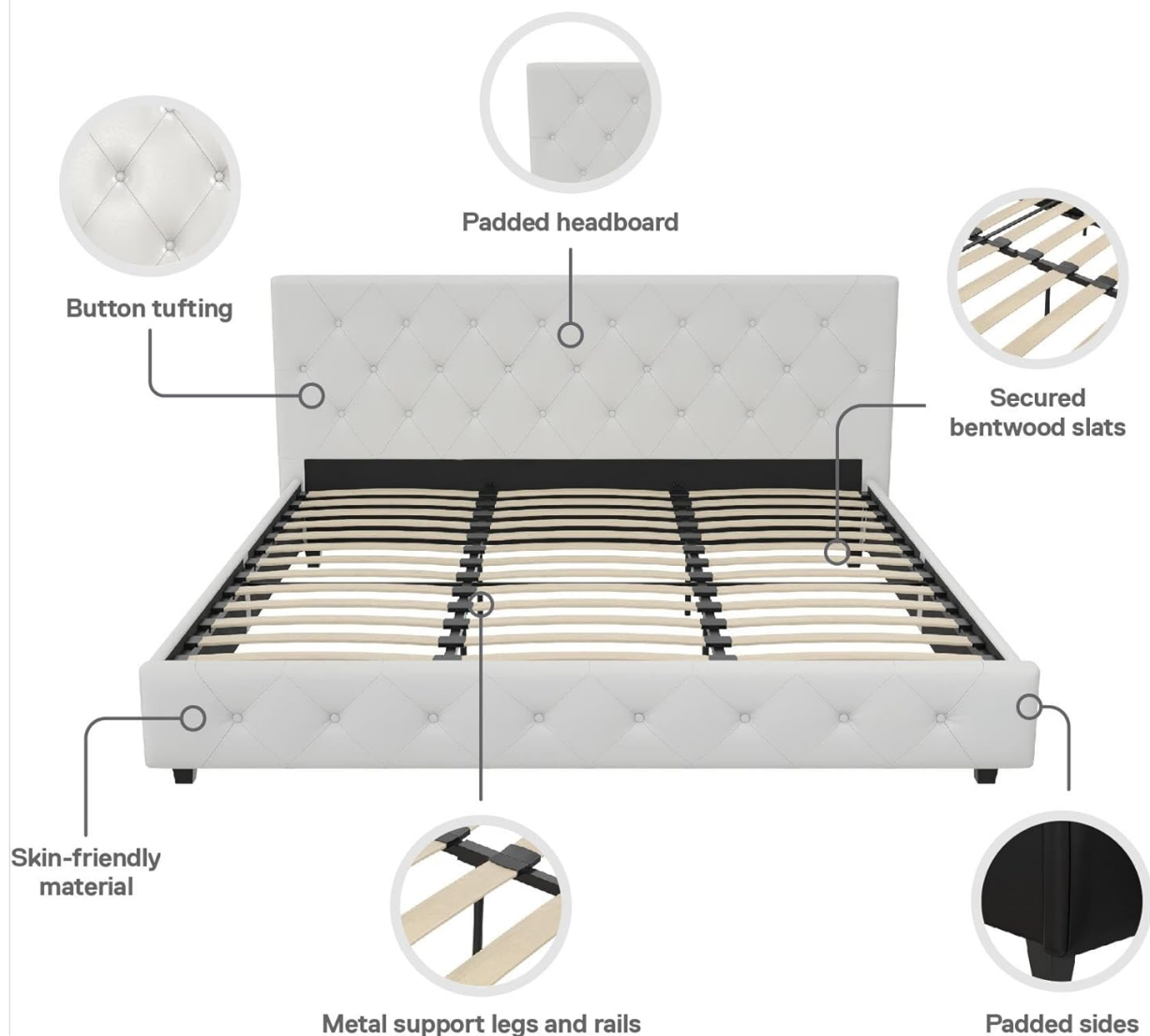
Image: A visual representation of the bed's dimensions (length, width, height) and key features such as weight limit, no box spring requirement, and design elements.