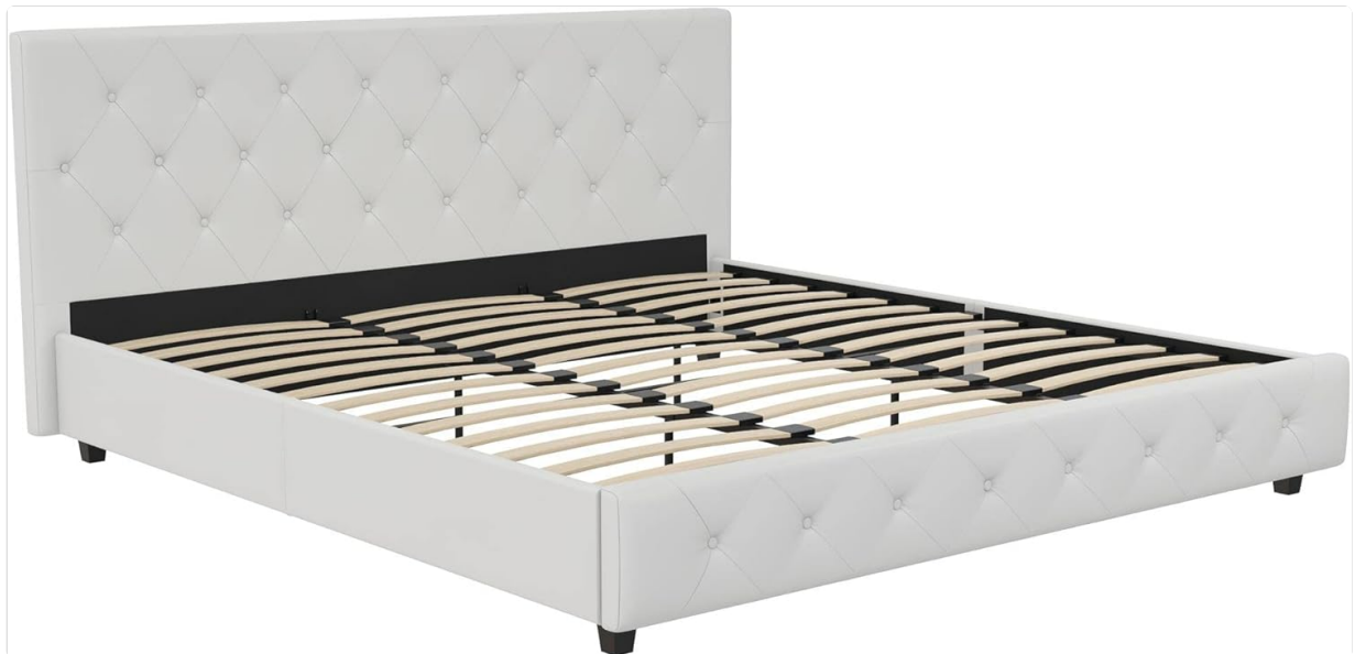
Image: The DHP Dakota King White Faux Leather Upholstered Platform Bed, fully assembled, showcasing its diamond button-tufted headboard and footboard, and the slat support system.

This manual provides detailed instructions for the assembly, operation, and maintenance of your DHP Dakota King White Faux Leather Upholstered Platform Bed. Please read all instructions carefully before beginning assembly and retain this manual for future reference.