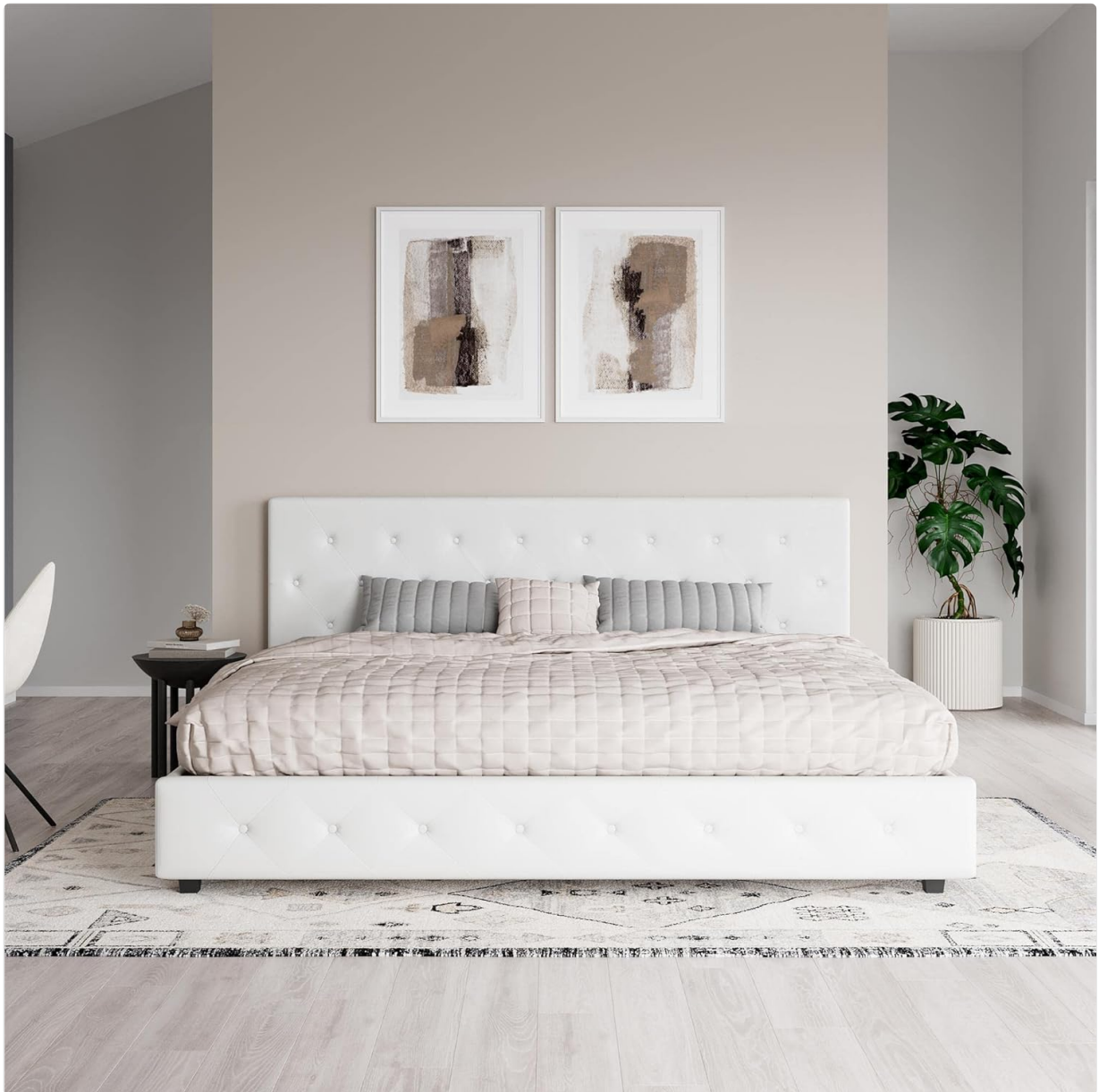
Image: The DHP Dakota King bed, complete with a mattress and bedding, situated in a modern bedroom, illustrating its functional use.