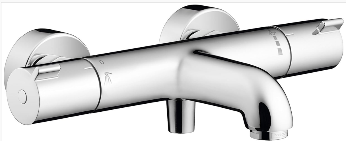
Figure 1: Front view of the Hansgrohe MyFox 13154000 Thermostatic Bath Mixer Tap. This image shows the polished chrome finish and the two control handles.

The Hansgrohe MyFox 13154000 is a wall-mounted thermostatic bath mixer tap designed for comfortable and safe temperature control in your bathtub or shower. It features precise thermostatic regulation, a built-in shower/bath selector, and safety functions to prevent scalding.