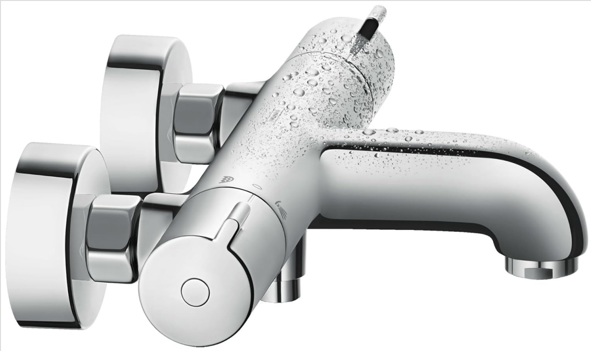
Figure 6: The Hansgrohe MyFox thermostatic mixer tap with water droplets, illustrating its functional use and polished chrome finish.