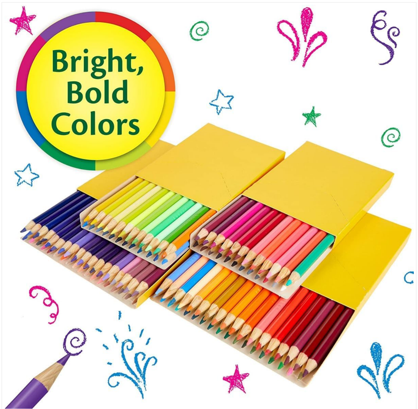
Figure 2.1: A close-up view of the pencils, demonstrating the wide range of colors available in the 120-count set.