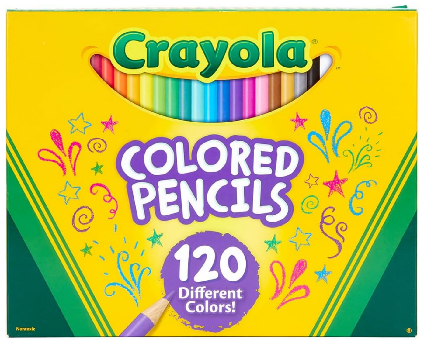
Figure 3.1: The front of the Crayola 120-Count Colored Pencils box, indicating the quantity and brand.

Before first use, inspect all pencils for any visible damage. While Crayola pencils are designed for durability, occasional transit impacts can occur. Ensure all 120 colors are present and tips are intact.