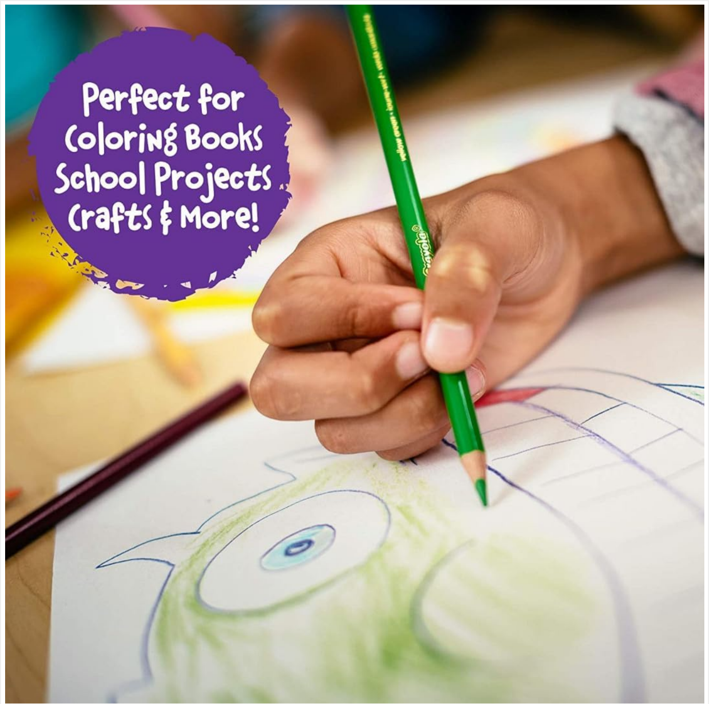
Figure 4.1: A child actively using a Crayola colored pencil, demonstrating the product in use for creative activities.

Crayola colored pencils perform well on various paper types, including standard drawing paper, construction paper, and coloring book pages. For best results with blending and layering, consider using paper with a slight tooth.