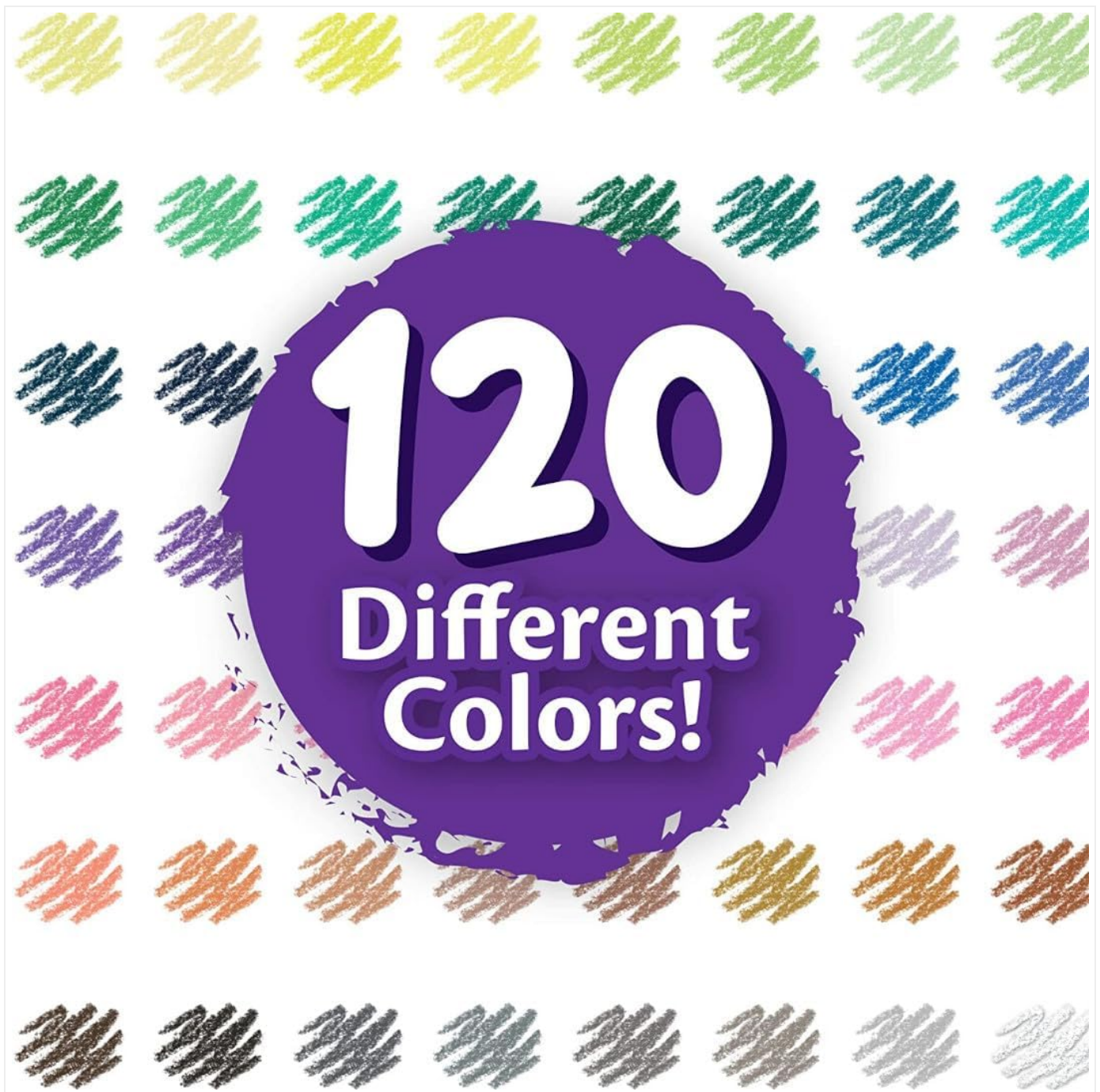
Figure 7.1: A visual representation of the 120 distinct colors included in the set.