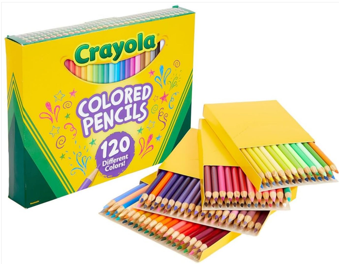
Figure 1.1: The Crayola 120-Count Colored Pencils set, showcasing the vibrant assortment of colors and packaging.

The Crayola 120-Count Colored Pencils set provides a vast array of vibrant colors for artistic expression. Designed for both children and adults, these pencils are suitable for various creative projects, including coloring books, school assignments, and detailed artwork. The set emphasizes ease of use, durability, and a broad spectrum of hues to inspire creativity.