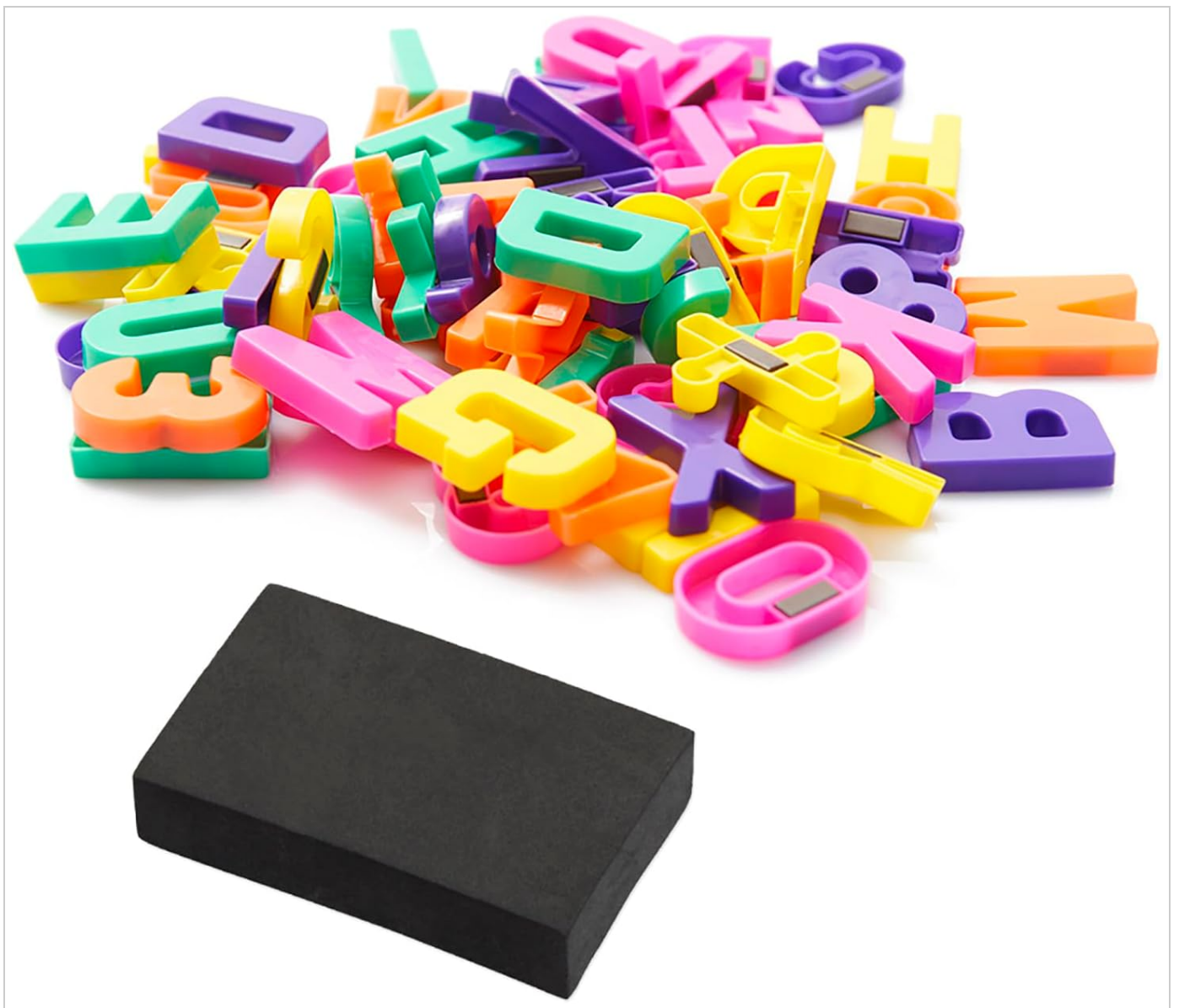
Image: A pile of colorful magnetic letters and numbers, along with a black eraser, on a white background, representing accessories for the magnetic whiteboard.