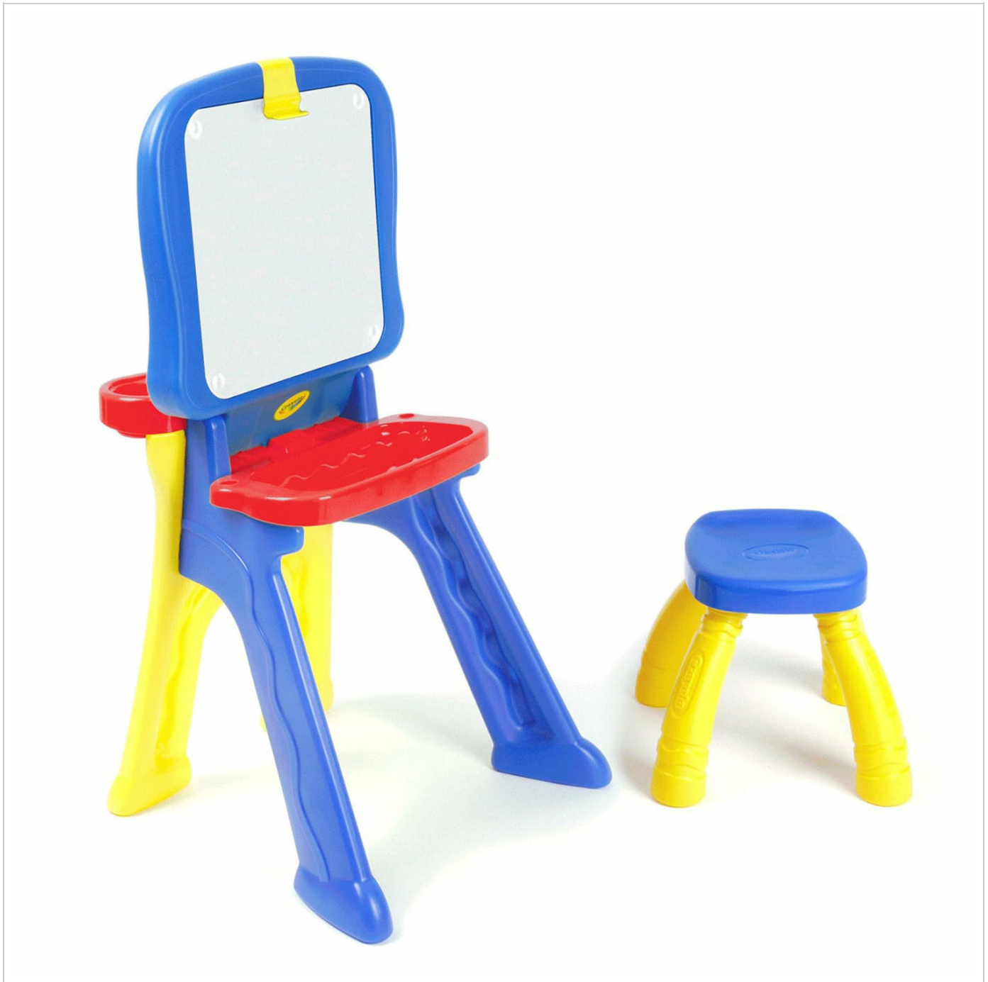
Image: The Crayola Triple The Fun Art Studio configured as an activity desk with a child-sized stool. The desk surface is blue, and the legs are yellow and blue. A red tray for art supplies is visible at the back of the desk.

instructions for detailed, step-by-step guidance on assembling the easel, activity desk, and stool. Ensure all components are securely fastened before use.