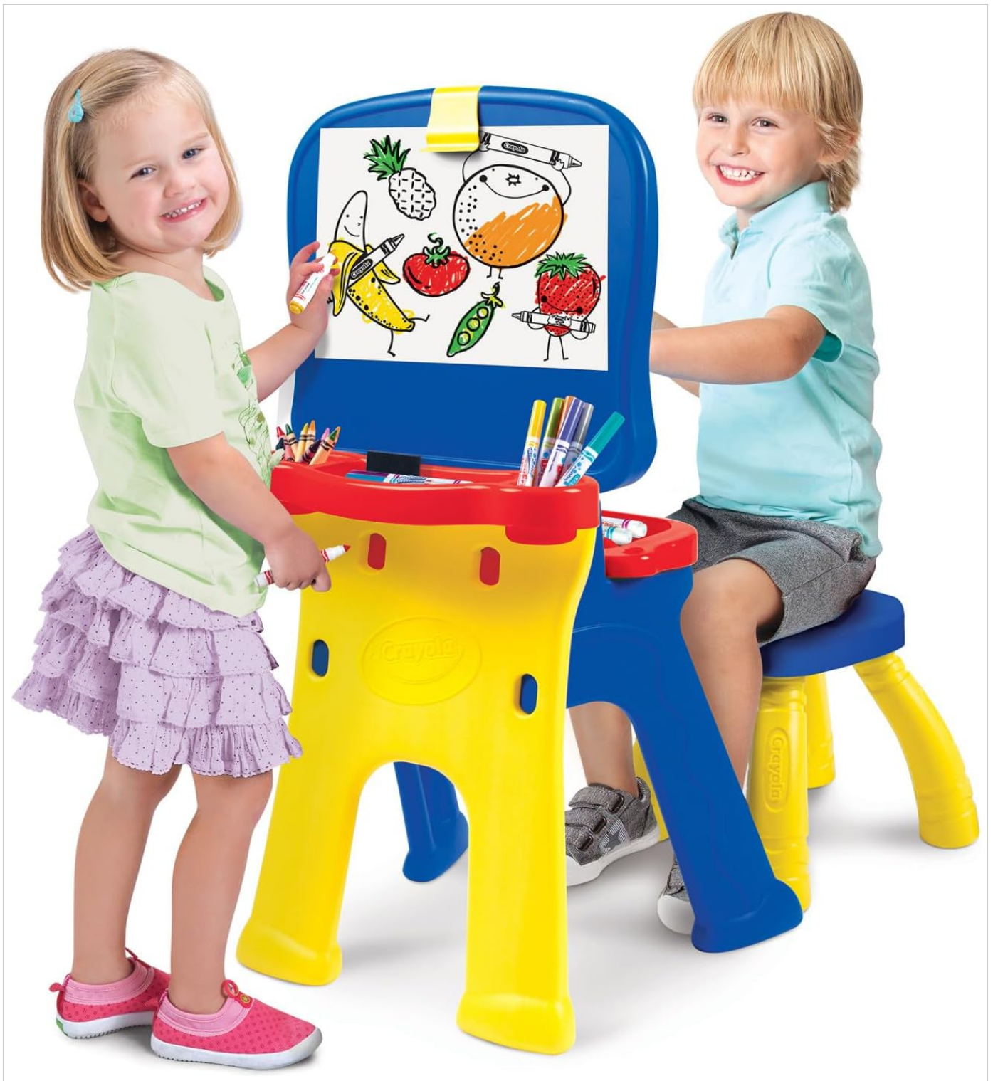
Image: Two children, a boy and a girl, happily drawing on opposite sides of the Crayola Triple The Fun Art Studio in easel mode. The girl is on the whiteboard side, and the boy is on the chalkboard side.