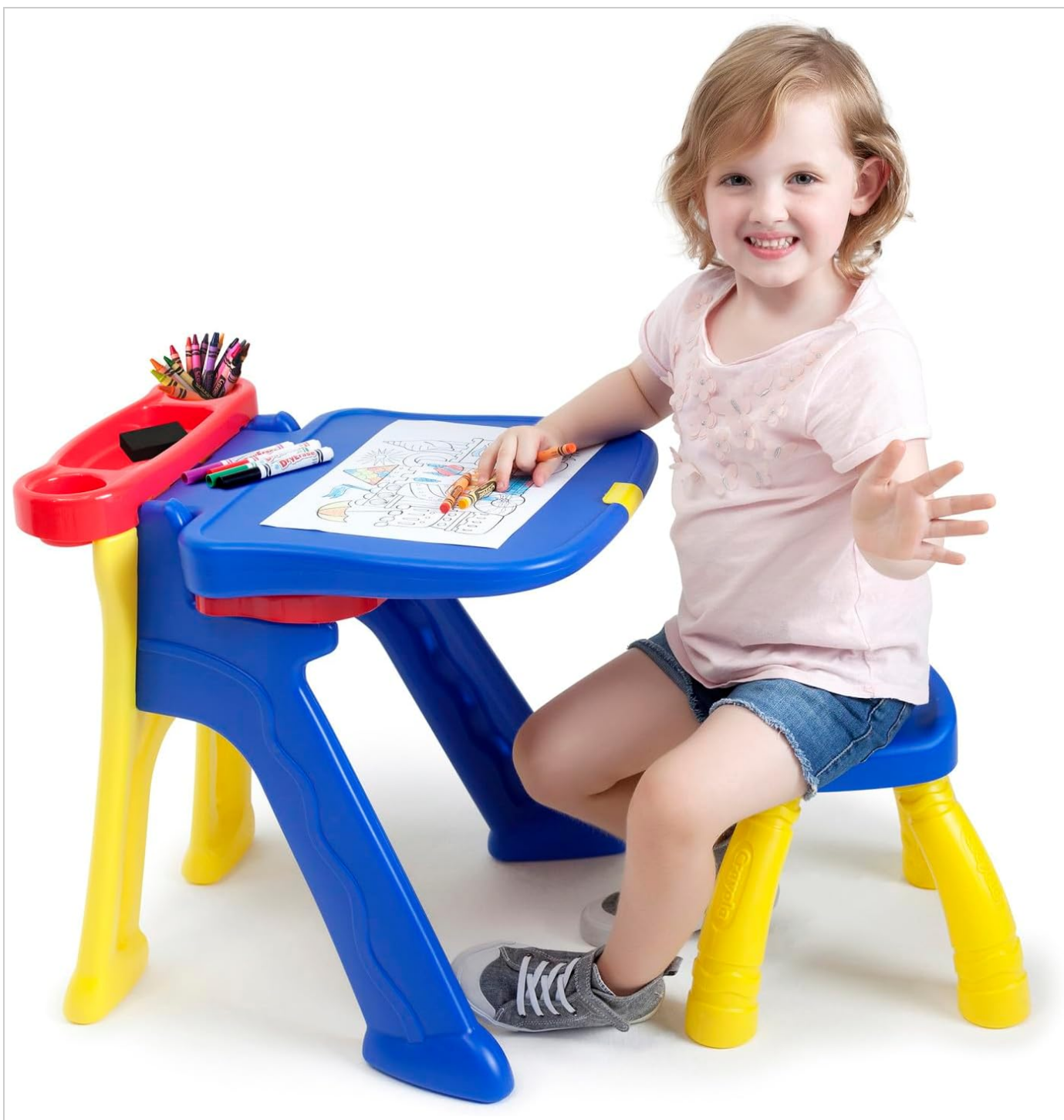
Image: A young girl sitting on the blue and yellow stool, engaged in coloring on a piece of paper placed on the blue activity desk of the Crayola Art Studio.