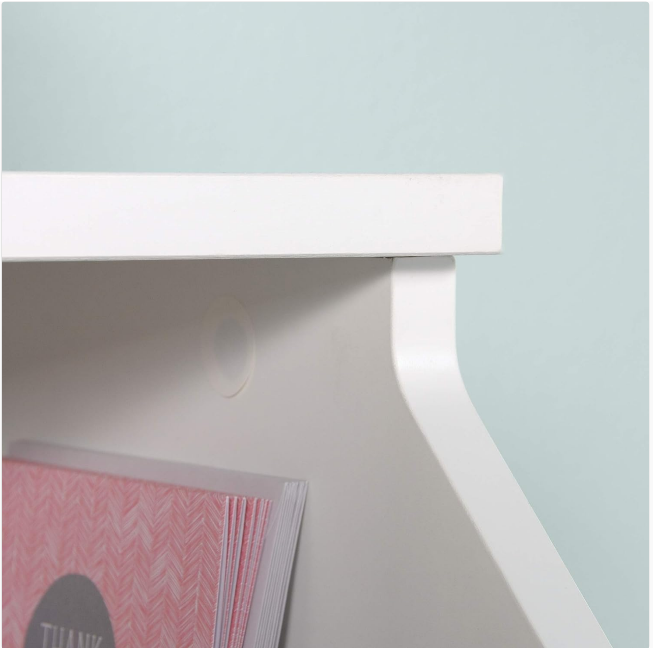
Figure 3.3: Detail of the cord access opening on the hutch's back panel.