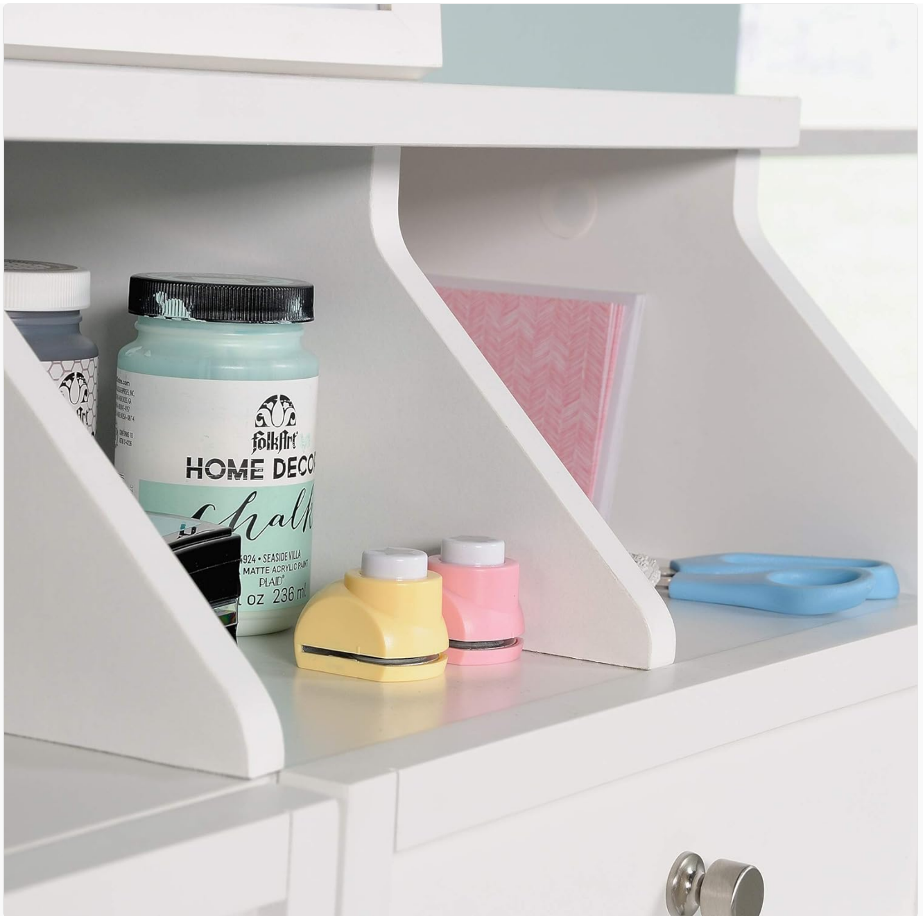
Figure 3.2: Cubbyhole sections displaying craft items, illustrating their utility for accessible storage.