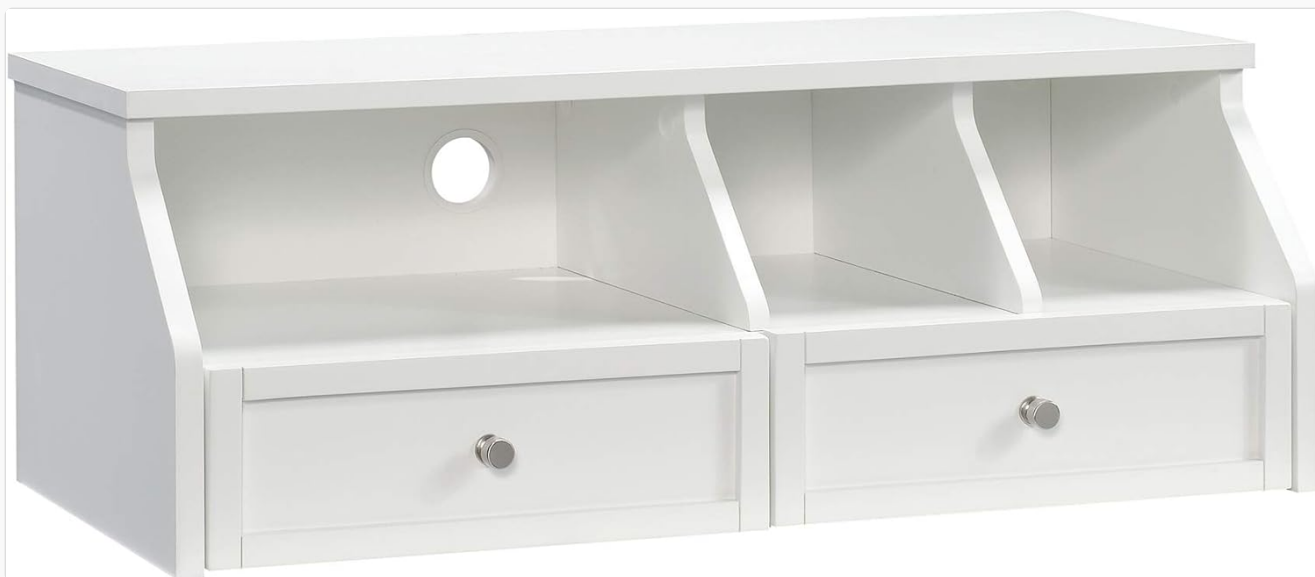
Figure 1.1: Front view of the Sauder Craft Pro Series Organizer Hutch, showcasing its white finish, two drawers, and two open cubbyhole sections.

The Sauder Craft Pro Series Organizer Hutch is designed to enhance your craft space by providing additional storage and organization. This versatile hutch is intended to be attached to compatible Sauder storage cabinets (models 421405, 421407) or the Craft Table (model 421417). It features two smooth-gliding drawers with full extension slides, dedicated cubbyhole storage areas, and an enclosed back with convenient cord access.