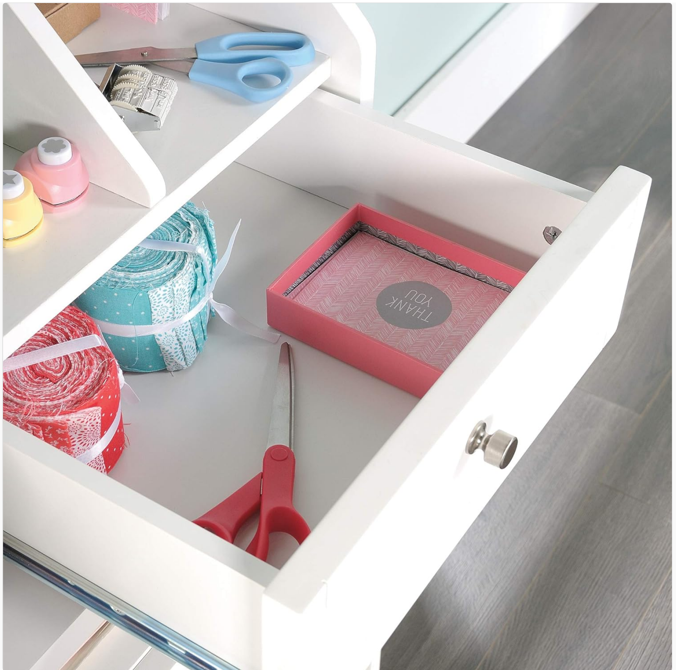
Figure 3.1: An open drawer revealing organized craft supplies, demonstrating the full extension slide capability.