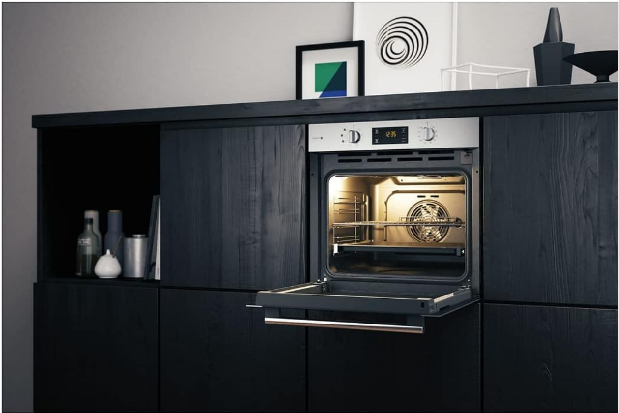
Figure 5: The Hotpoint-Ariston oven integrated into a modern kitchen setting, with its door slightly ajar, revealing the illuminated interior and the oven racks. This demonstrates the appliance in its operational environment.