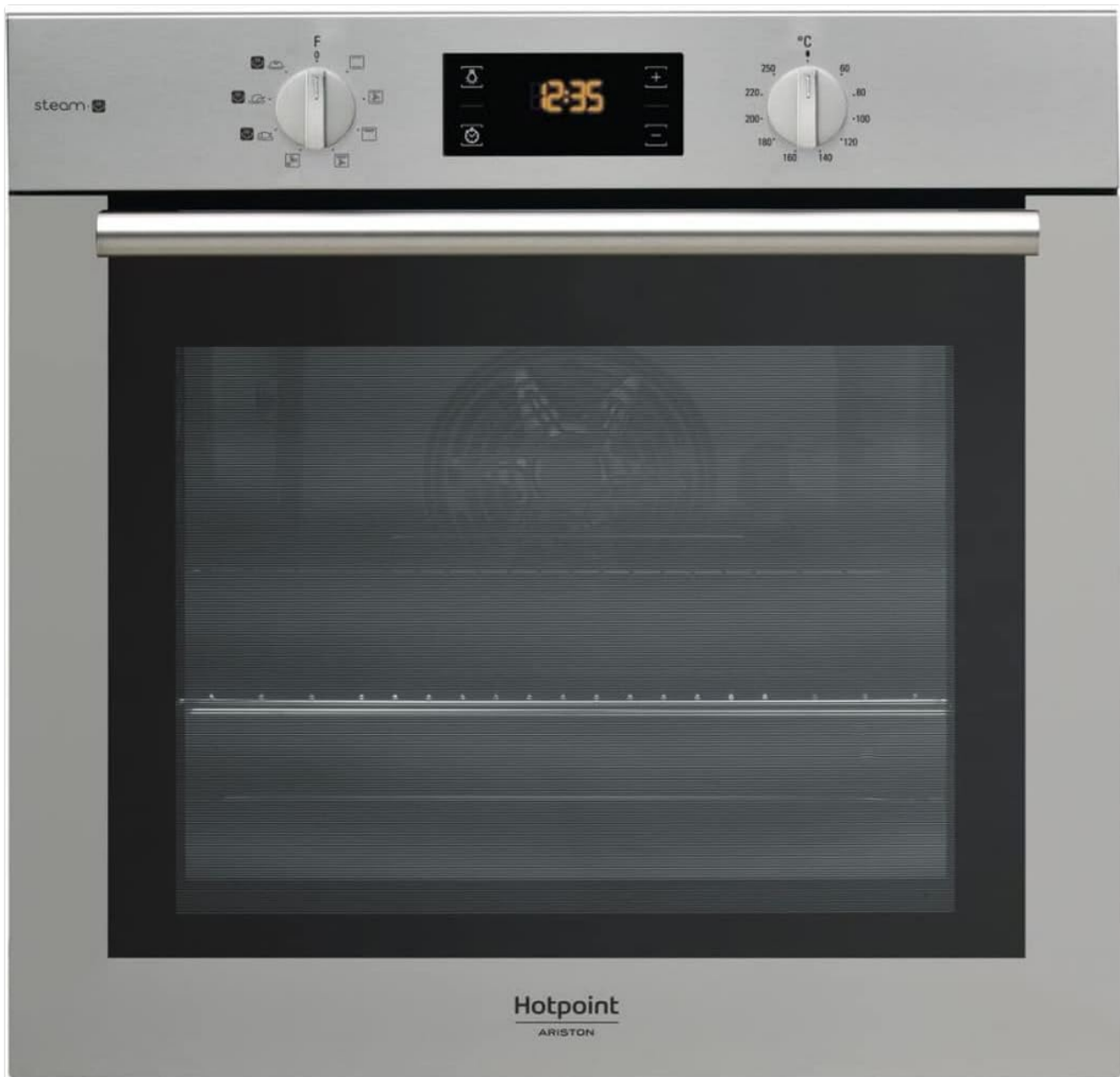
Figure 1: Front view of the Hotpoint-Ariston FA4S 544 IX HA electric oven. This image displays the stainless steel finish, the control panel with two rotary knobs and a digital display, and the oven door with a large viewing window and a horizontal handle.