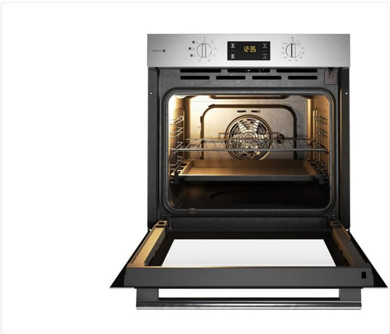
Figure 6: Interior view of the Hotpoint-Ariston oven, showing the removable wire racks, the fan at the back for convection cooking, and the heating elements. This view is useful for understanding cleaning access.