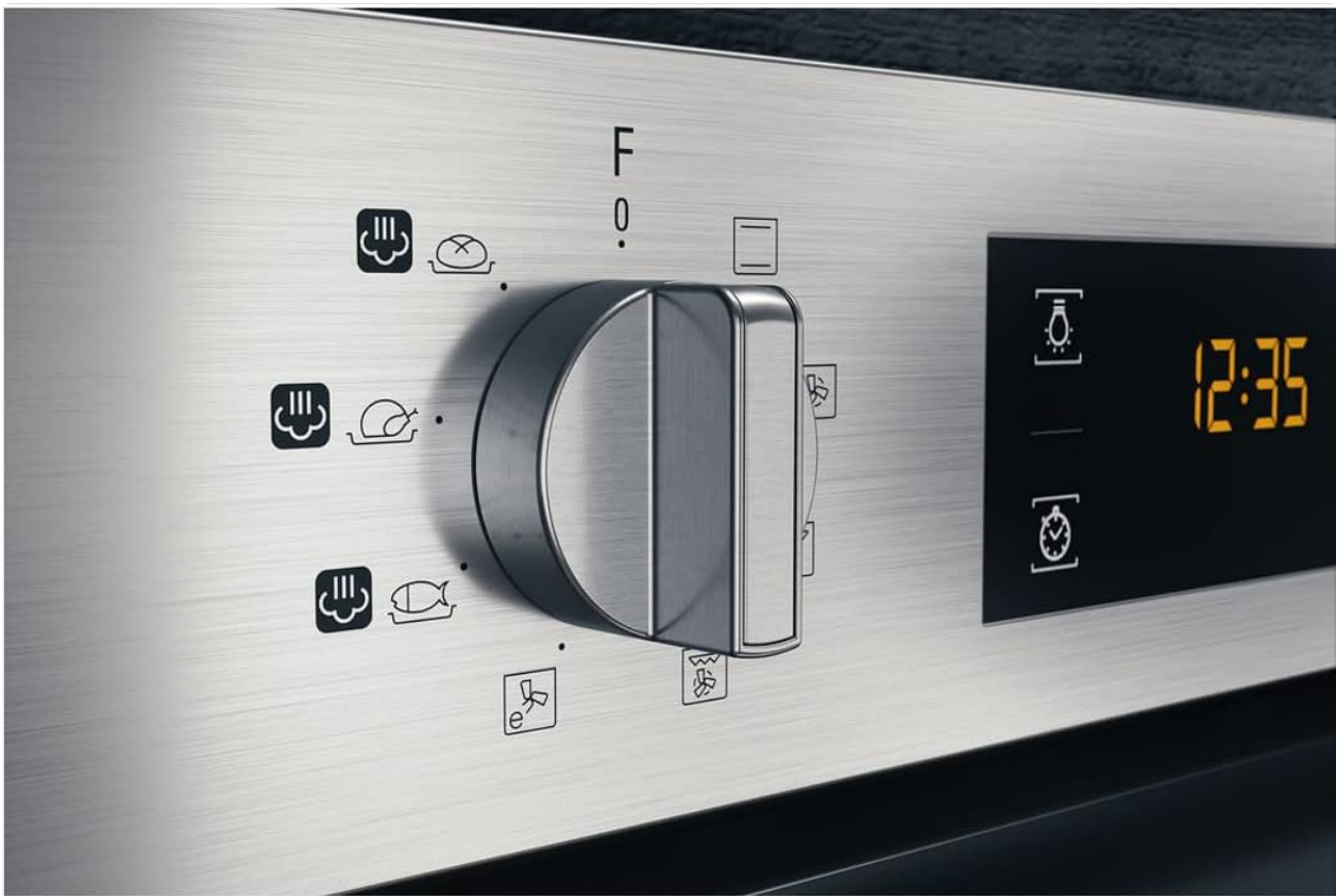
Figure 4: Detailed view of the function selector knob, showing icons for various cooking programs such as conventional baking, grilling, and fan-assisted modes. The 'F' and 'O' markings indicate the off position and other settings.