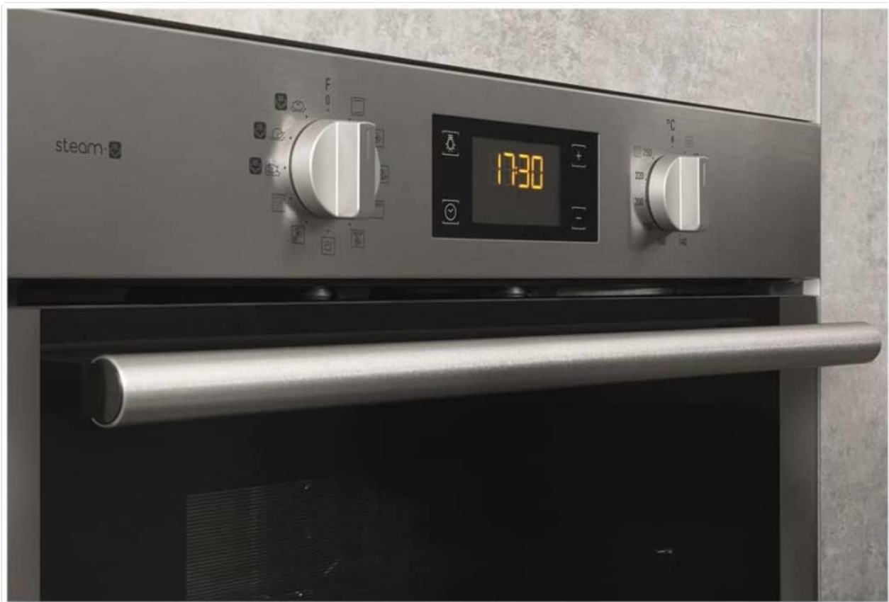
Figure 3: Close-up view of the oven's control panel, highlighting the digital display showing "17:30", and the two rotary knobs for function and temperature selection. Various cooking icons are visible around the function knob.