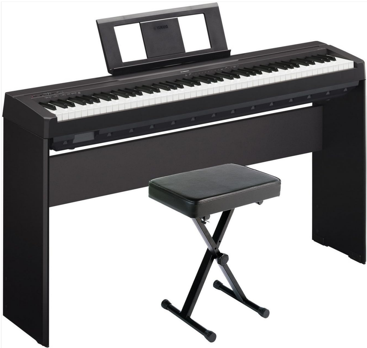
The Yamaha P45 88-Key Weighted Digital Piano Home Bundle, including the digital piano, wooden furniture stand, and padded bench.