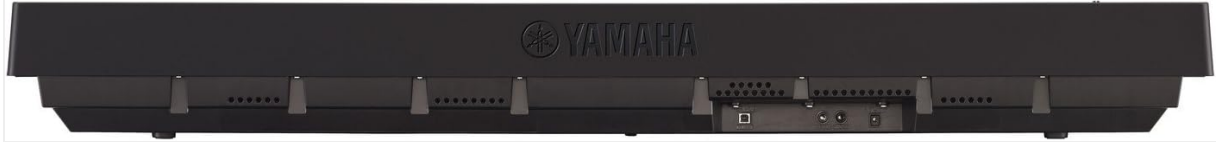
Rear view of the Yamaha P45 Digital Piano, highlighting the various connectivity ports including DC IN, Headphones, and Sustain Pedal.