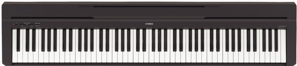
Top view of the Yamaha P45 Digital Piano, showcasing the 88 weighted keys and the control panel for power, volume, and function selection.

The USB TO HOST port allows connection to a computer or mobile device for use with various educational, music creation, or entertainment applications. This enables MIDI data transfer.