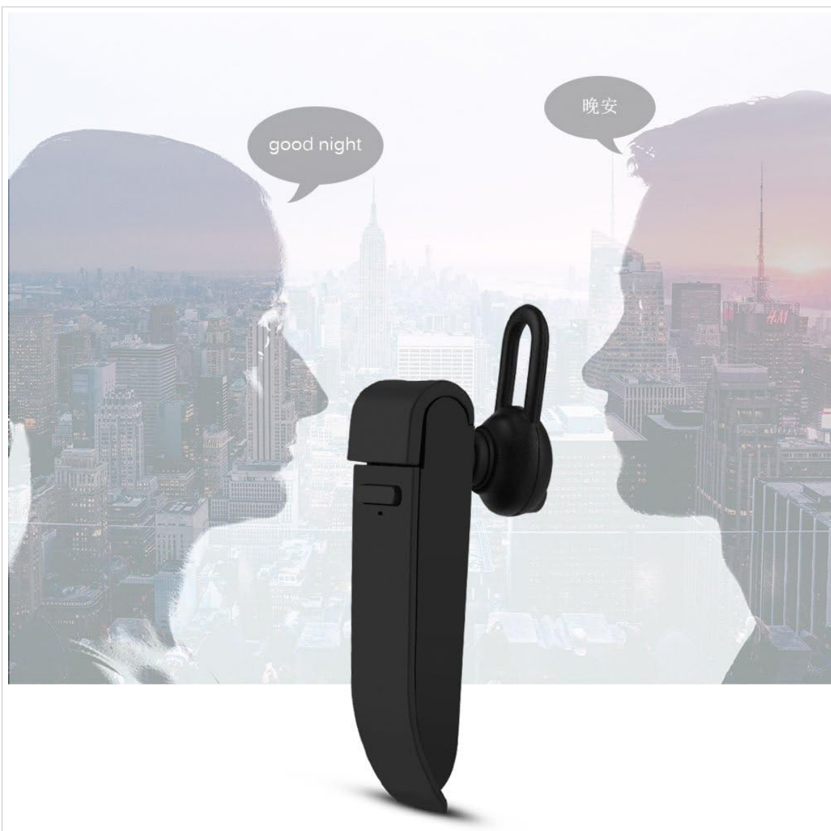
Image 5.1: A conceptual image demonstrating the earphone's translation capability between two languages.