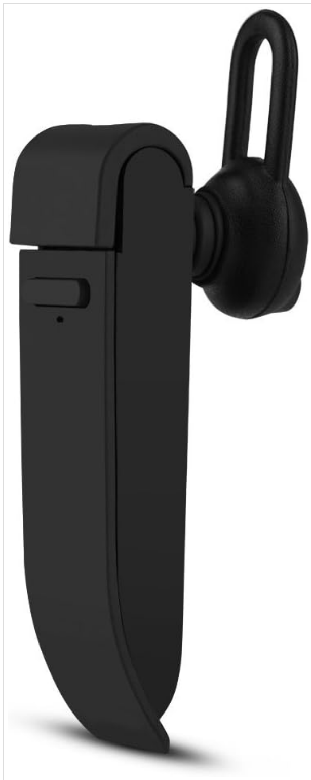
Image 1.1: Main view of the Zerone Multi-Language Translator Bluetooth Earphone.