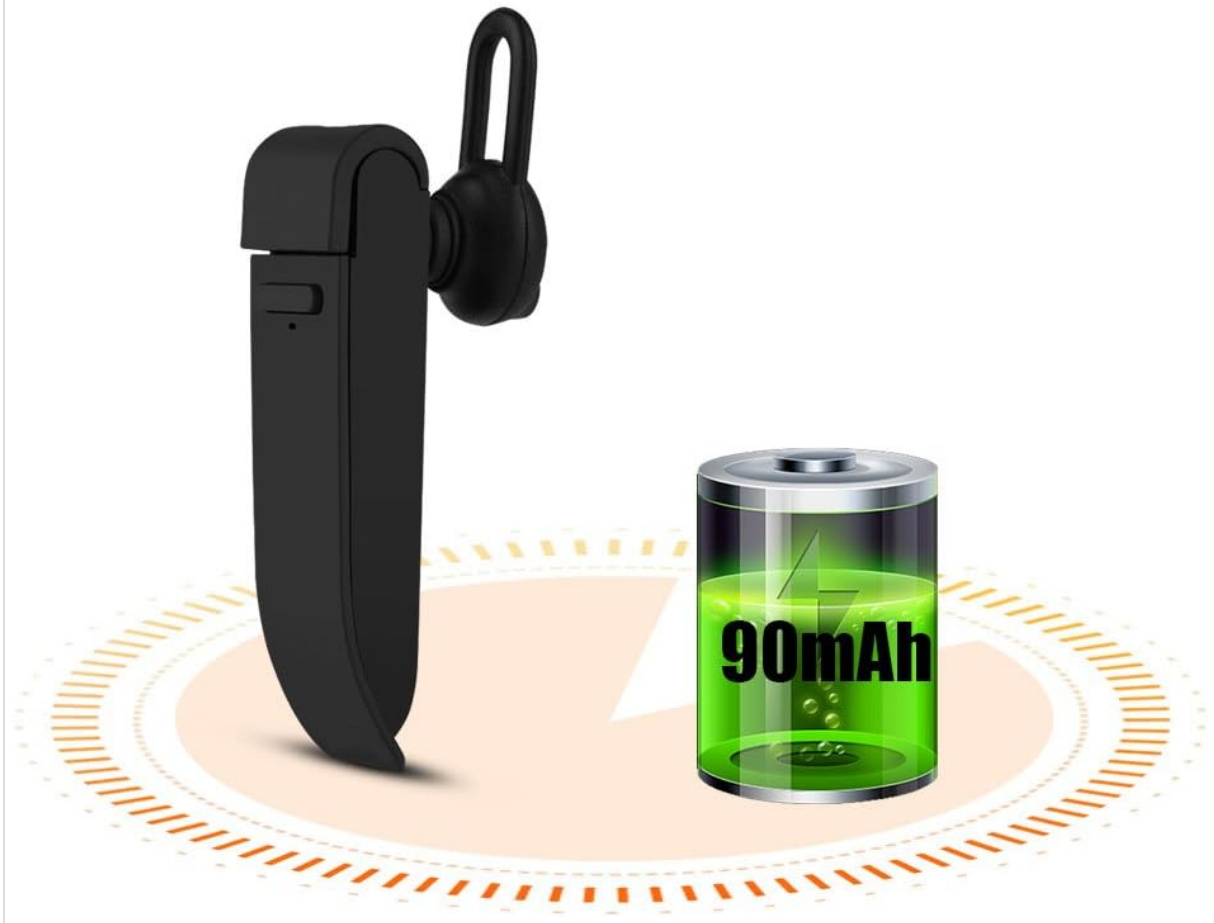
Image 3.4: Details on the earphone's 90mAh rechargeable lithium battery and extended usage times.