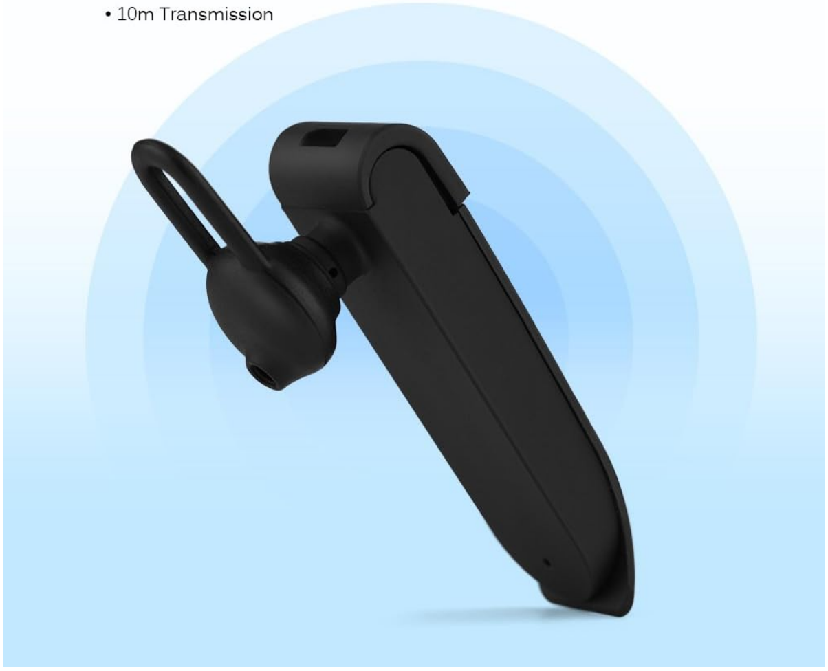
Image 3.2: Illustration of the high fidelity audio output with an 8mm moving coil speaker.