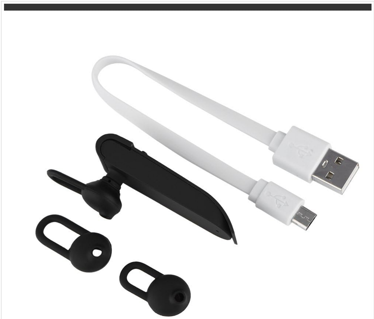
Image 2.1: The earphone with its charging cable and two additional ear tips.