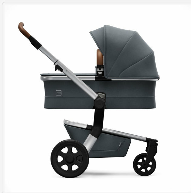
The Joolz Hub Stroller with its seat fully reclined, suitable for a child's rest.

The ergonomic seat offers six positions, allowing your baby to sleep, sit, or snooze comfortably. Adjust the recline by pressing the levers on either side of the seat and moving it to the desired angle. Ensure the seat is securely locked in place before use.