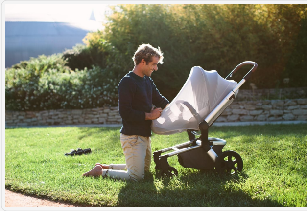
A man adjusting the large, protective canopy of the Joolz Hub Stroller.