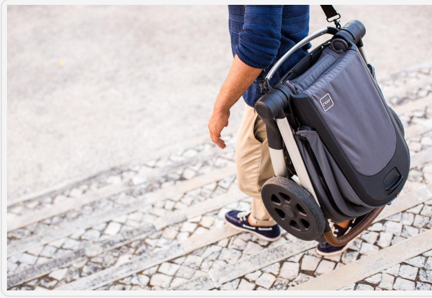
A man carrying the Joolz Hub Stroller in its compact folded state, demonstrating its portability.