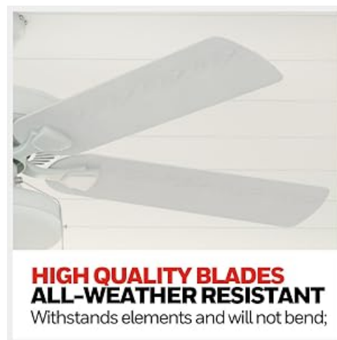
Figure 6.1: The durable blades are designed for all-weather use.

The fan blades are constructed from high-quality, all-weather resistant material designed to withstand outdoor elements without bending or warping. Periodically check blade screws for tightness.