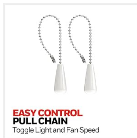
Figure 5.1: The fan and light are controlled by separate pull chains.

The second pull chain operates the integrated LED light kit. Pull the chain to turn the light on or off. The light kit includes two E26/A15 LED bulbs, providing 1200 lumens with a 3000K color temperature.