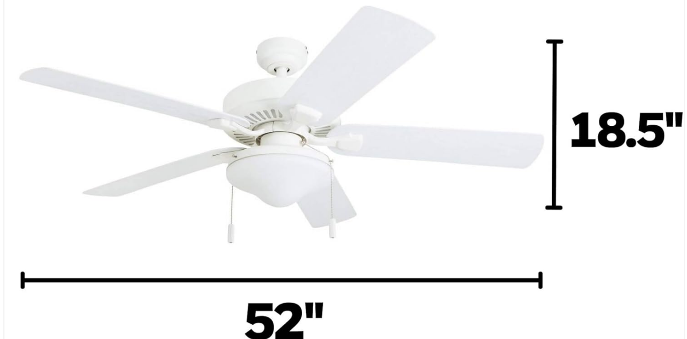
Figure 8.1: Key dimensions of the Honeywell Belmar 52 Inch Ceiling Fan.