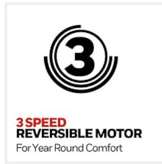
Figure 5.2: The reversible motor enhances comfort in all seasons.