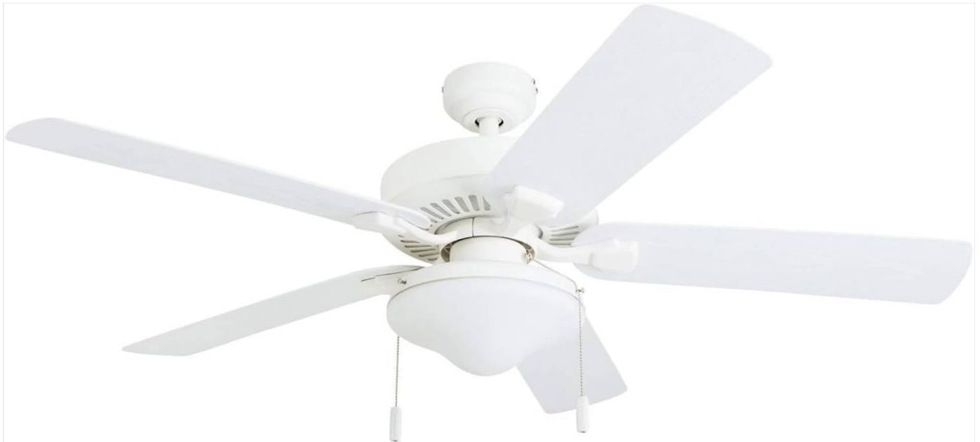
Figure 1.1: The Honeywell Belmar 52 Inch Ceiling Fan with Light in White finish.

Key features include a 52-inch blade span, a 5-blade design, pull chain control for fan speed and light, and a reversible motor for year-round comfort. Please read all instructions carefully before beginning installation.