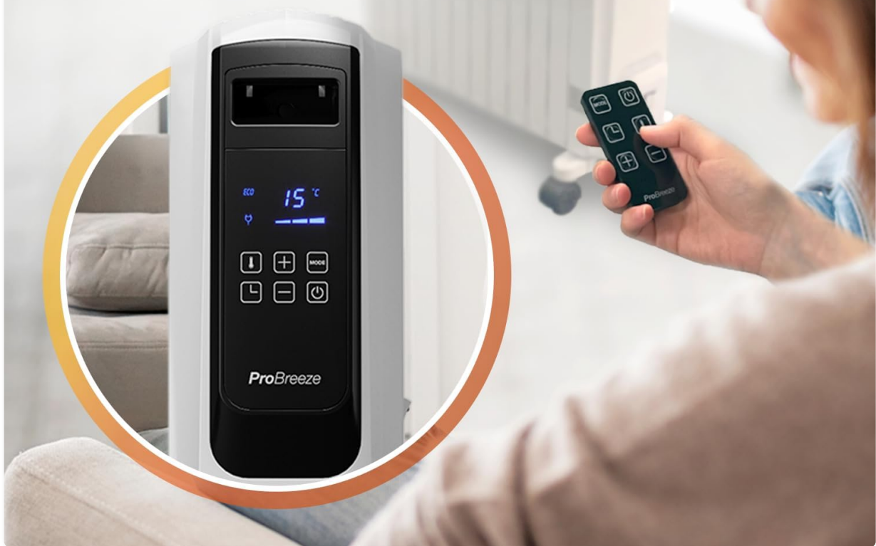
Image: The digital control panel and remote control offer convenient operation of the radiator.

Commandez le chauffage à l'aide du panneau de commande numérique ou de la télécommande sans fil .