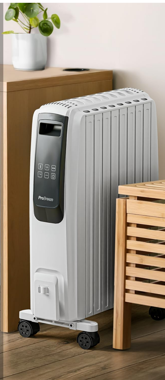
Image: The compact design, integrated carry handles, and caster wheels make the radiator easy to move and store.