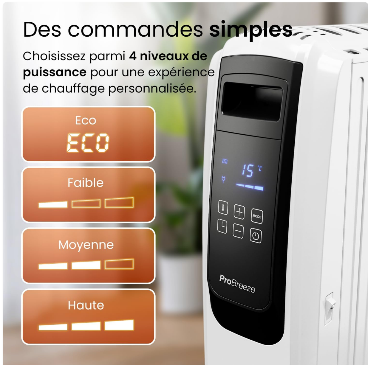
Image: Choose from 4 power levels for a customized heating experience.