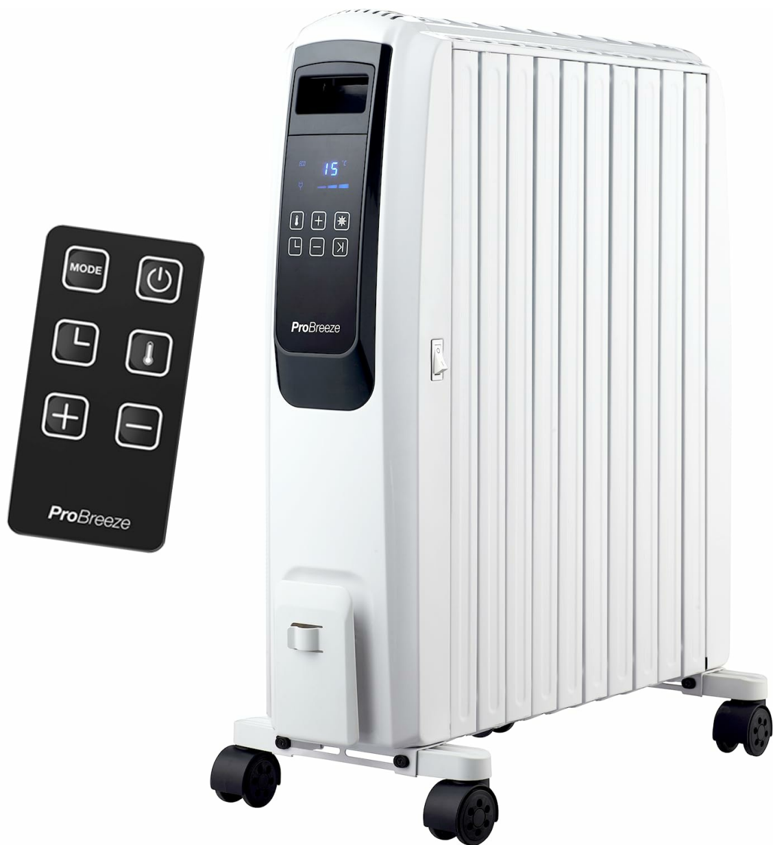
Image: Pro Breeze 2500W Digital Oil-Filled Radiator, showcasing its modern design and digital display.