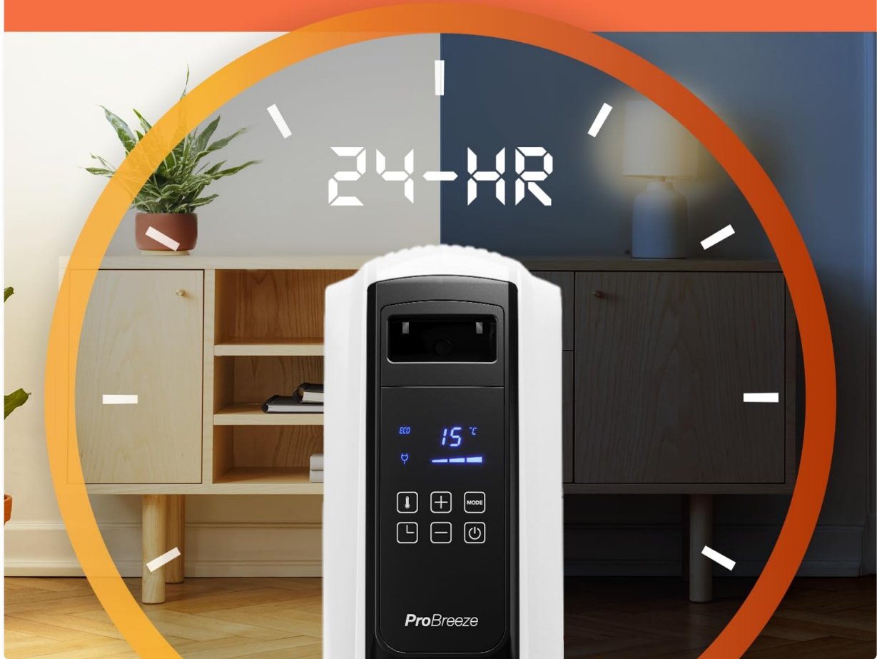
Image: Program the 24-hour timer to suit your schedule for convenient heating.

Programmez la minuterie de 24 heures en fonction de votre emploi du temps.