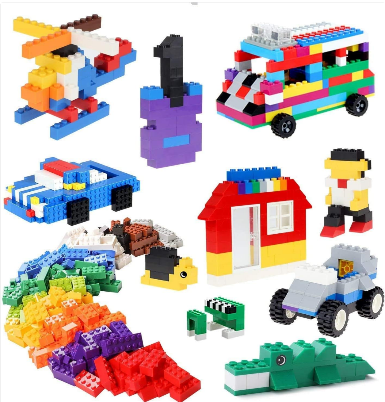
Image 4.2: Examples of various models that can be constructed with the building blocks, such as a helicopter, car, house, and different animal figures.

Video 4.1: A demonstration of building various items like a car, house, and crocodile using the burgkidz building blocks, highlighting the ease of assembly and creative potential.