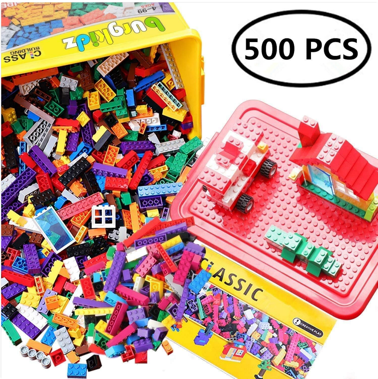
Image 2.1: Contents of the burgkidz building block set, including loose blocks, the baseplate lid, and a small car and house built from the pieces.