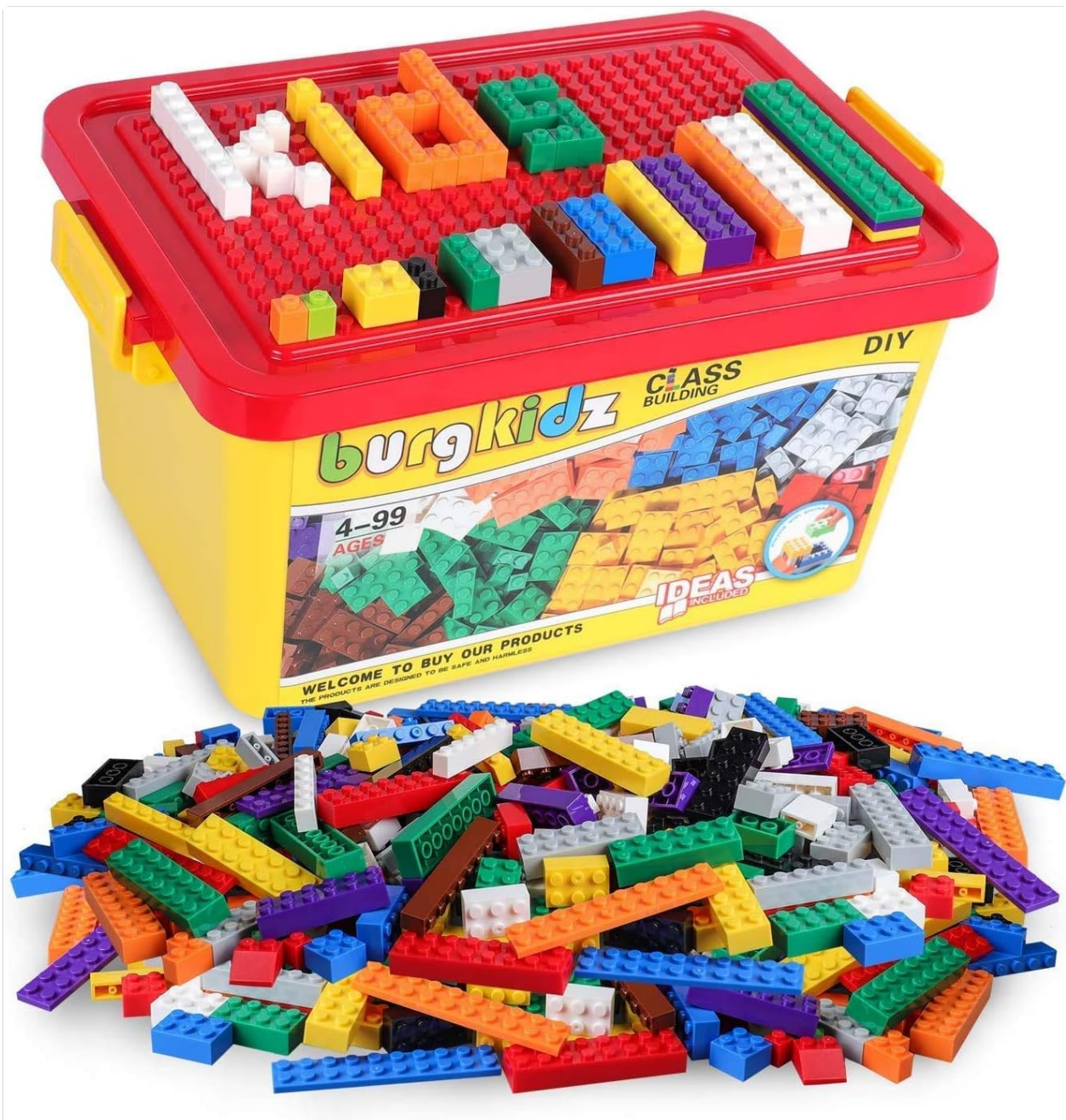
Image 1.1: The burgkidz Classic Building Blocks Set, showcasing the storage box, a baseplate lid, and several example creations built from the blocks.