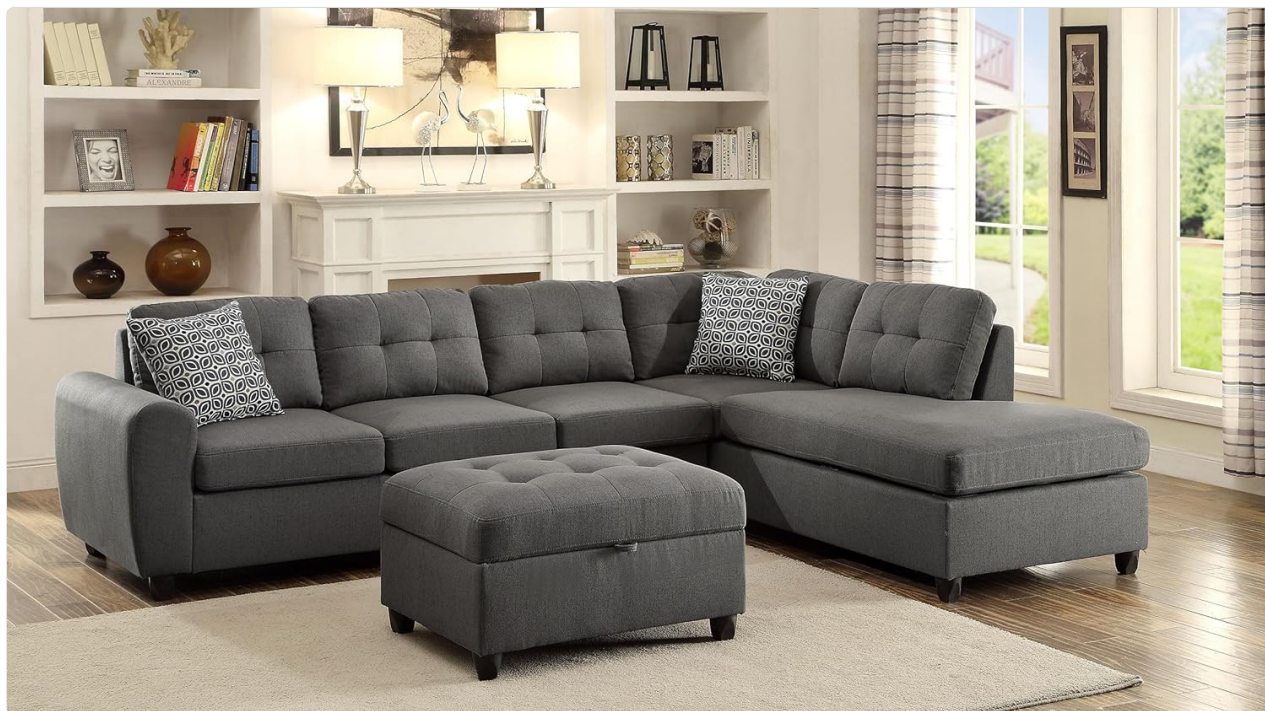
Image: The fully assembled Coaster Stonenesse Sectional Sofa, showcasing its grey linen-like fabric and included accent pillows.