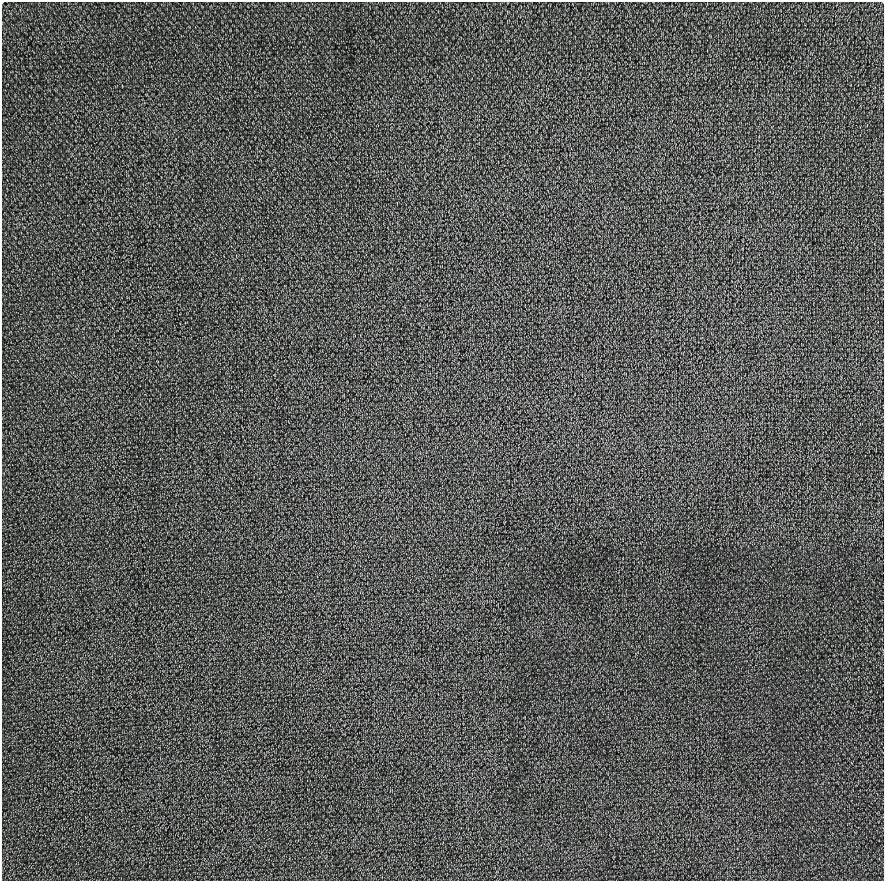
Image: A close-up view of the grey linen-like fabric, highlighting its texture and weave.