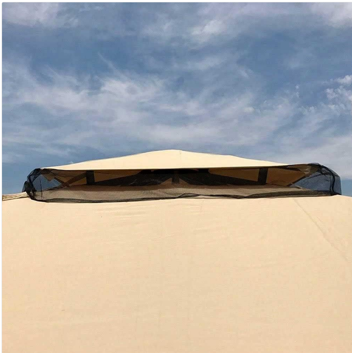
Image: A close-up view of the gazebo canopy's chimney roof design. This feature is crucial for ventilation and enhancing wind resistance, preventing the canopy from acting like a sail in gusty conditions.