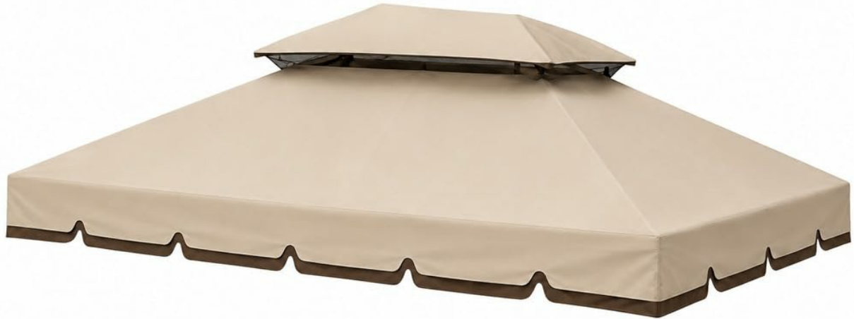
Image: The BAKAJI 3x3m beige gazebo replacement canopy, showcasing its overall design and color. This image highlights the main product with its windproof chimney and UV protection features.