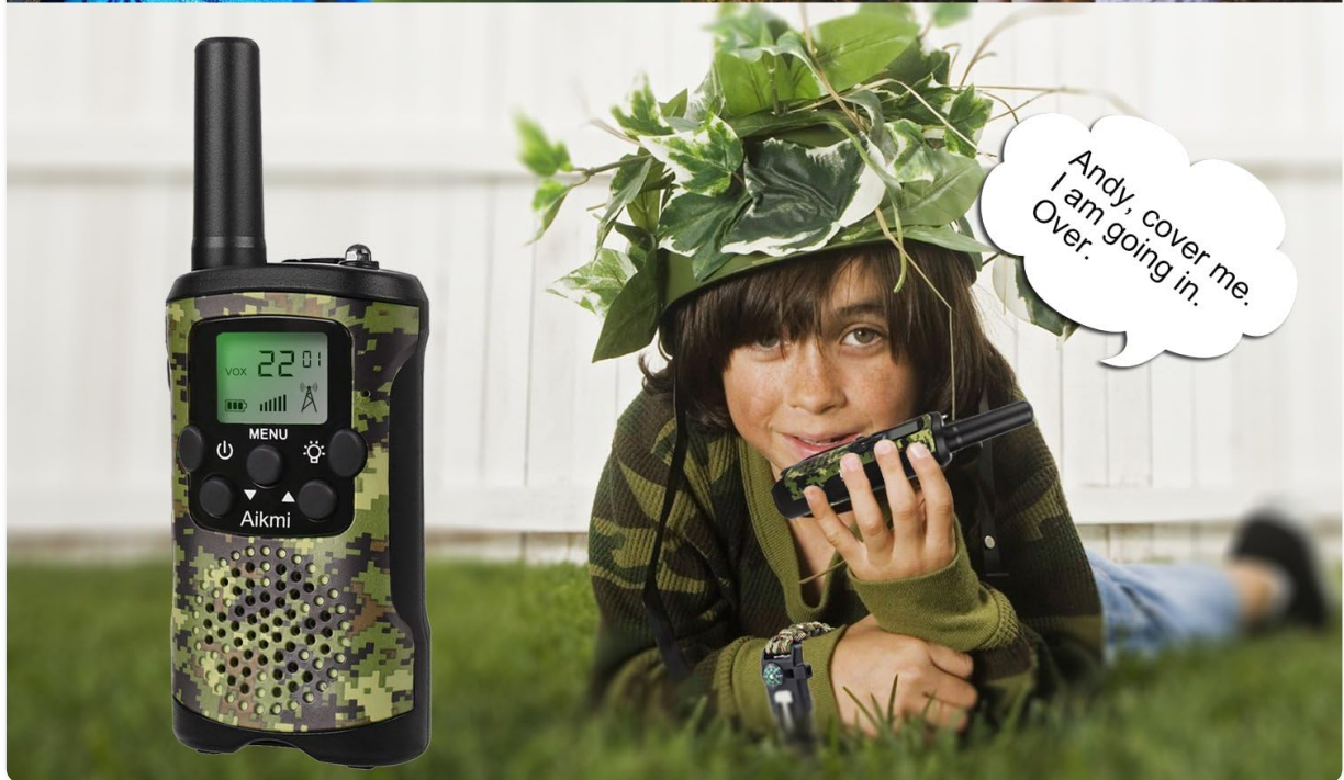
Image: Children enjoying outdoor activities with their walkie talkies.