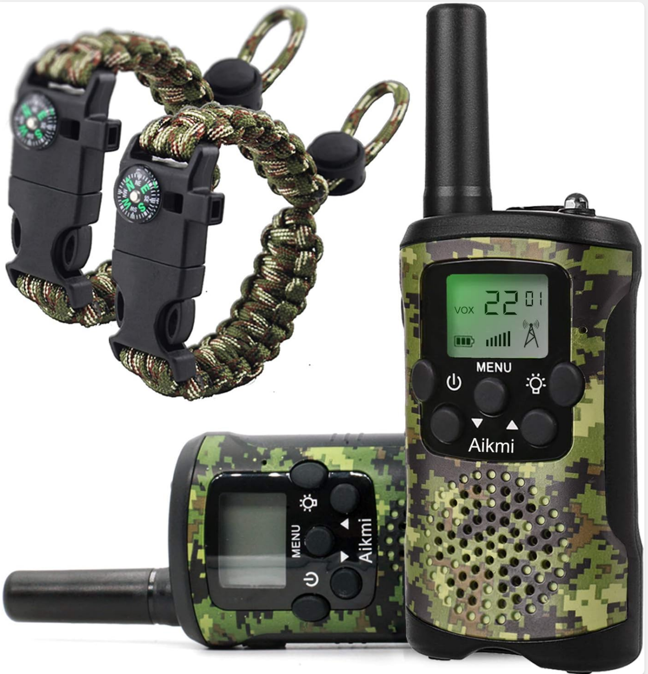
Image: Aikmi Kids Walkie Talkies with included accessories.