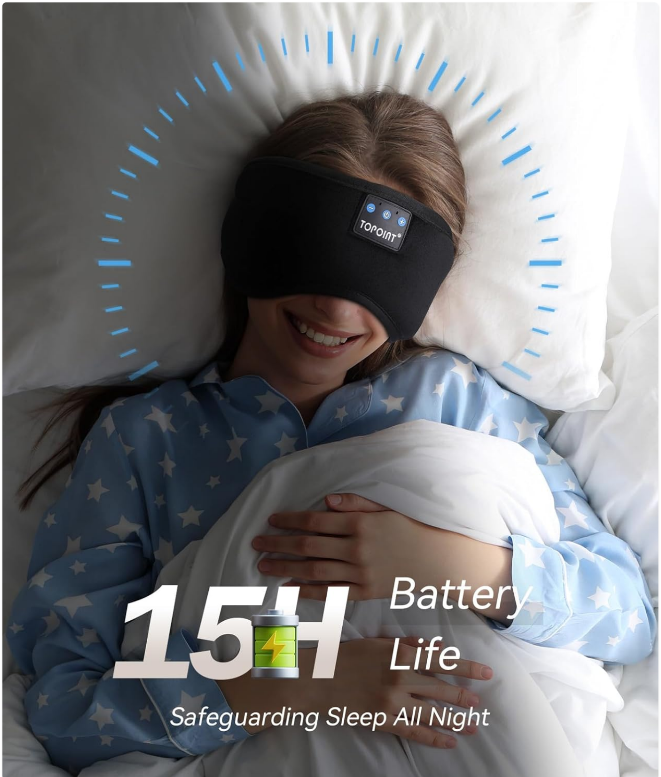
Image: The sleep mask being charged, illustrating its long battery life.

4. A full charge typically takes approximately 2 hours and provides up to 15 hours of playback time.