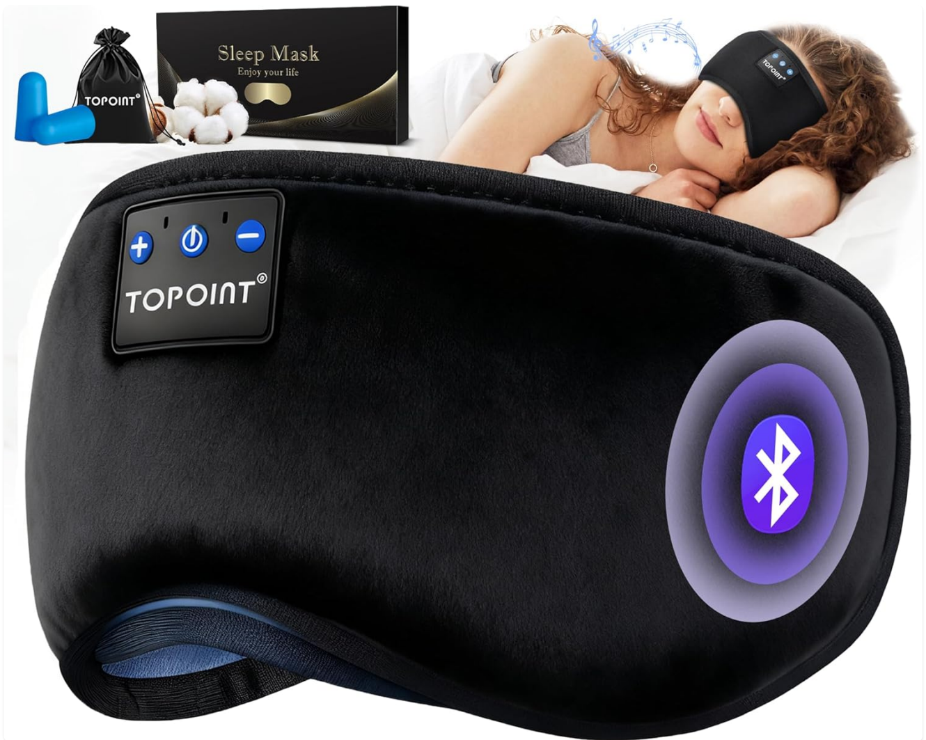
Image: The TOPOINT Bluetooth Sleep Mask, highlighting its features and included accessories.