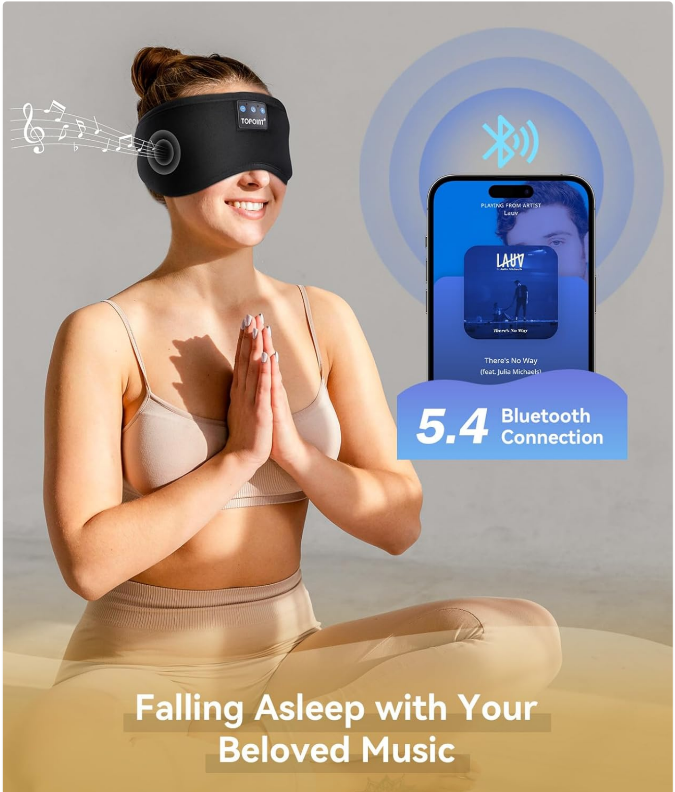
Image: Demonstrating the Bluetooth 5.4 connection process with a smartphone.