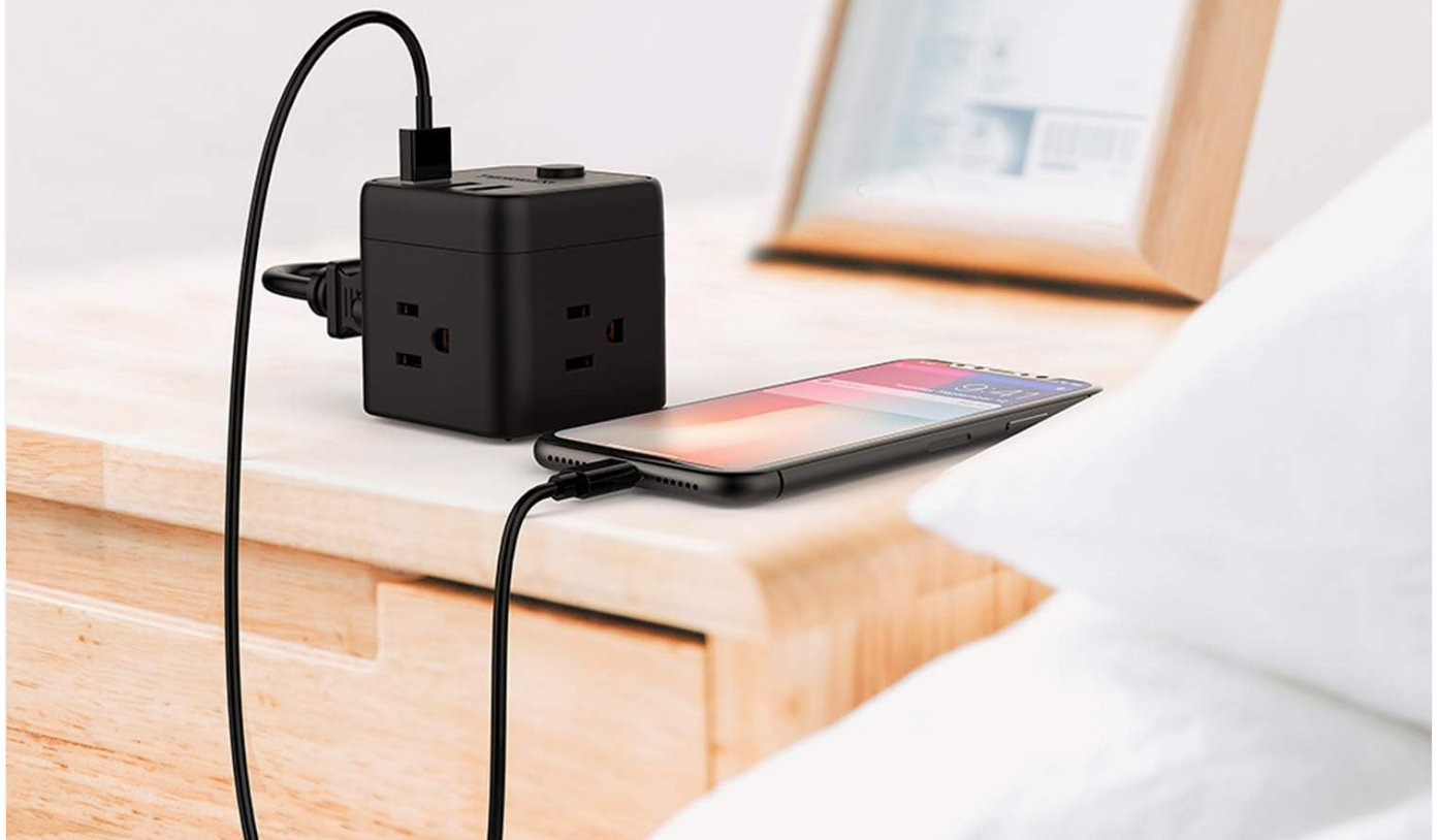
Image: The TESSAN Power Strip Cube positioned on a nightstand, actively charging a smartphone, illustrating its practical use in a bedroom setting.

An ideal accessories for bedroom, hotel, dorm room