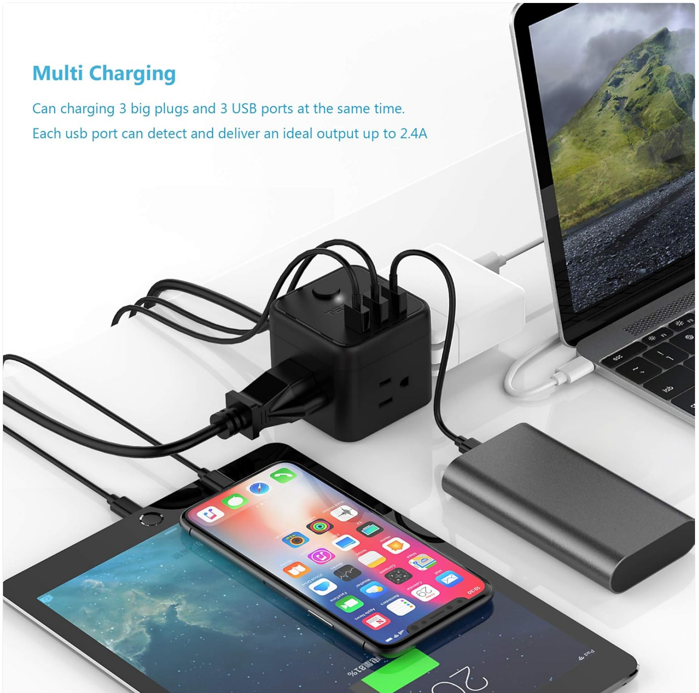
Image: The TESSAN Power Strip Cube actively powering and charging a variety of devices, including a laptop, tablet, and smartphone, showcasing its multi-charging functionality.

Each usb port can detect and deliver an ideal output up to 2.4A