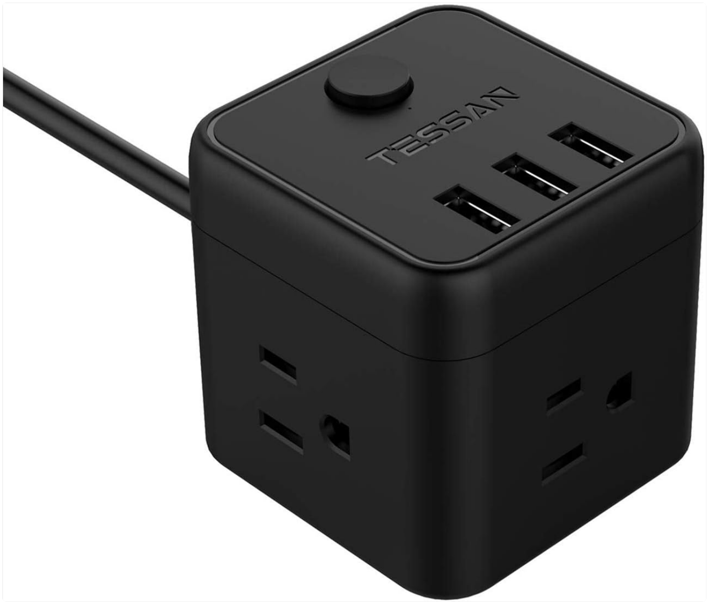
Image: The TESSAN Power Strip Cube, showcasing its compact black design with three AC outlets and three USB ports, connected to a 5-foot power cord.