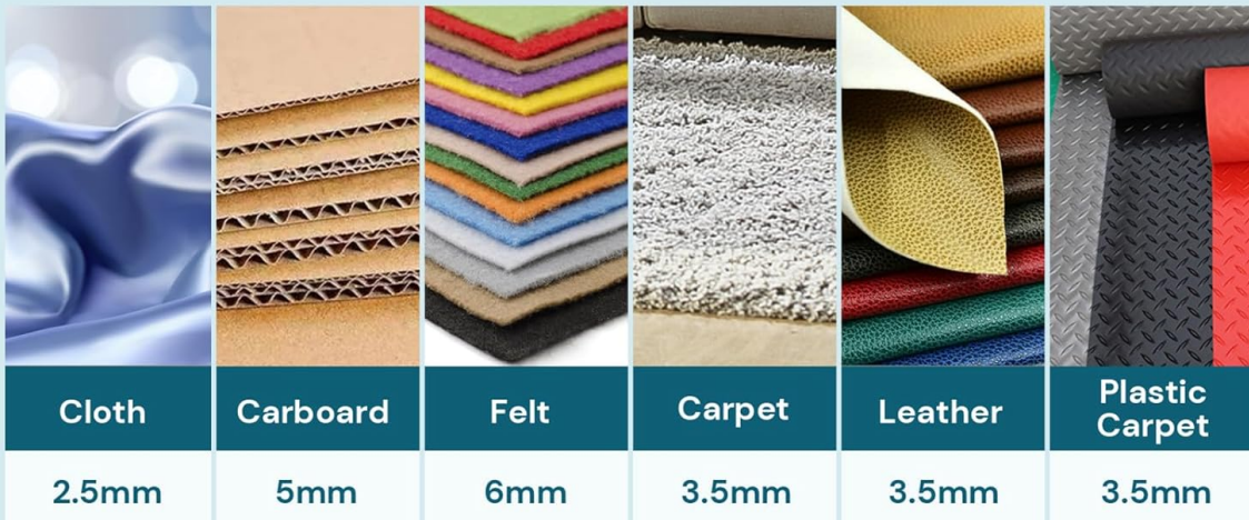
Image: Comparison of D-Blade and O-Blade, with examples of materials and their maximum cutting thicknesses.