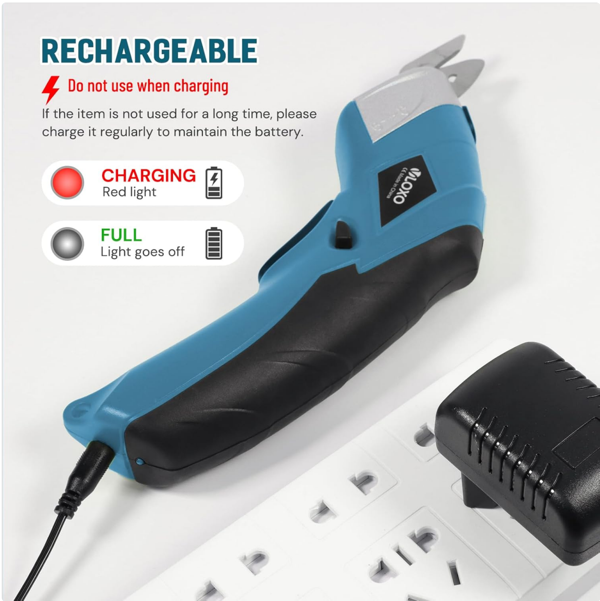
Image: Visual representation of the charging process and indicator lights.