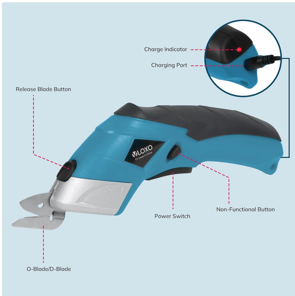
Image: Labeled diagram of the VLOXO Cordless Electric Scissors, highlighting key components such as the blades, power switch, and charging port.