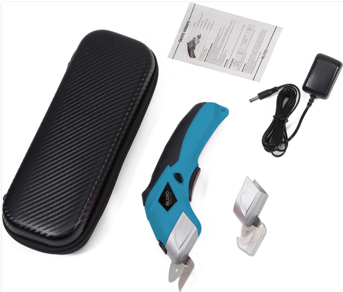
Image: All components included in the VLOXO Cordless Electric Scissors package.