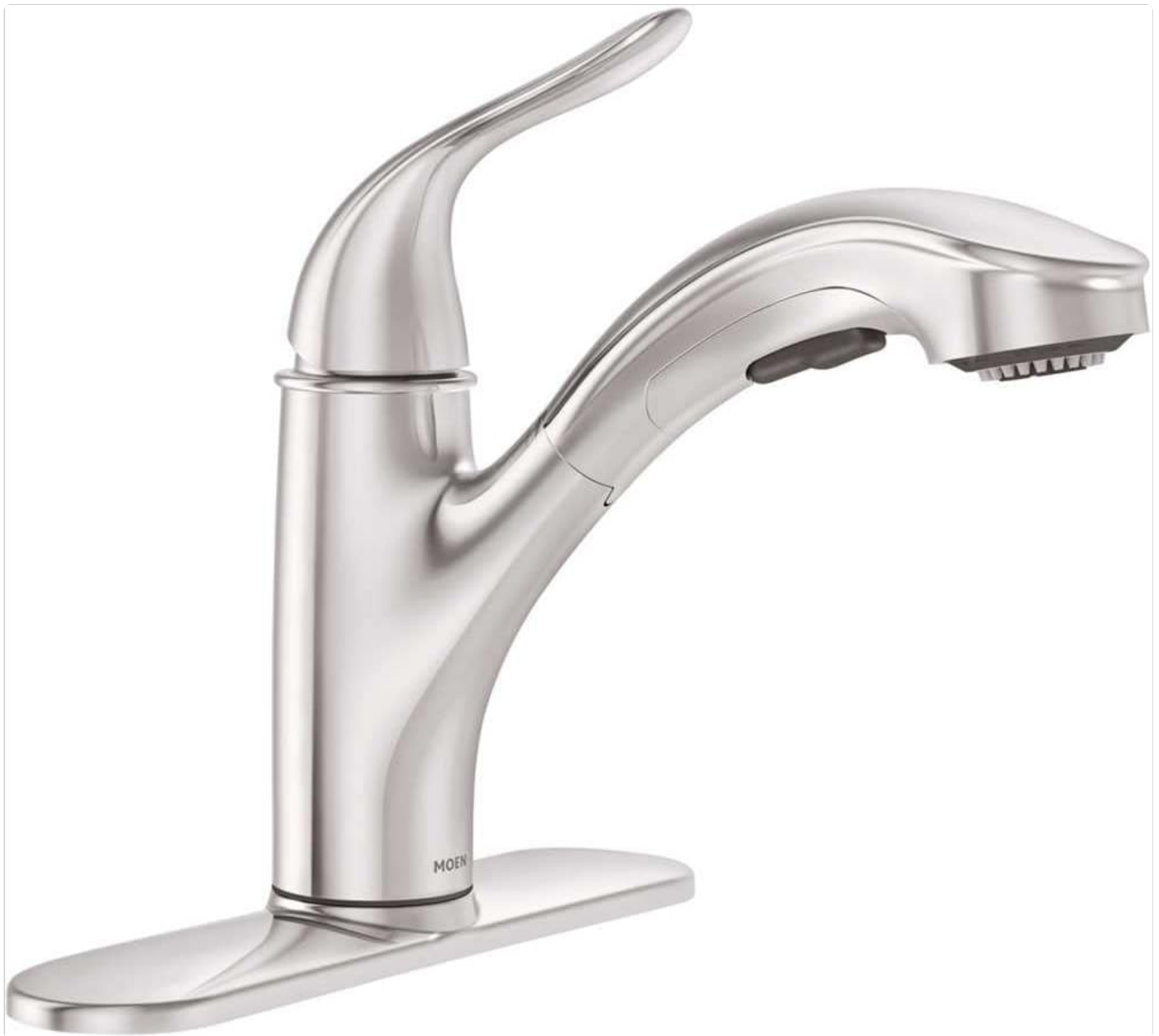
Figure 1: Moen Brecklyn Single-Handle Pull-Out Sprayer Kitchen Faucet, Chrome finish. This image displays the faucet's overall design, including the single handle on the right and the pull-out sprayer head.