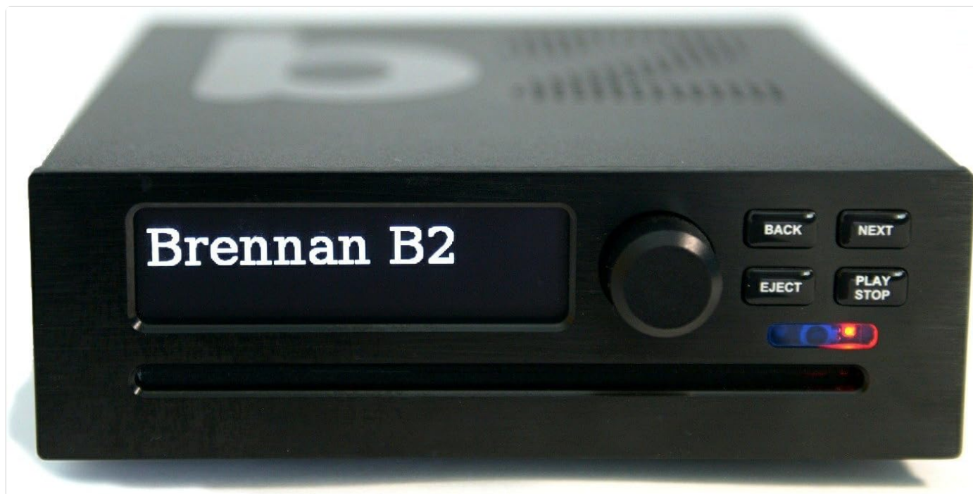
Image: Front view of the Brennan B2, showing the display, control knob, and buttons.

The Brennan B2 is a versatile HiFi system designed for ripping, storing, and playing your music collection. It features a built-in CD ripper, a large hard disk for storage, and a stereo power amplifier. The B2 supports various audio formats including WAV, Lossless (FLAC), and MP3, and offers connectivity options such as Sonos, Bluetooth, Spotify, YouTube, and Internet Radio.