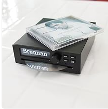
Image: Brennan B2 with a CD on top, illustrating the CD ripping function.

The B2 allows you to rip your CD collection directly to its internal hard drive.