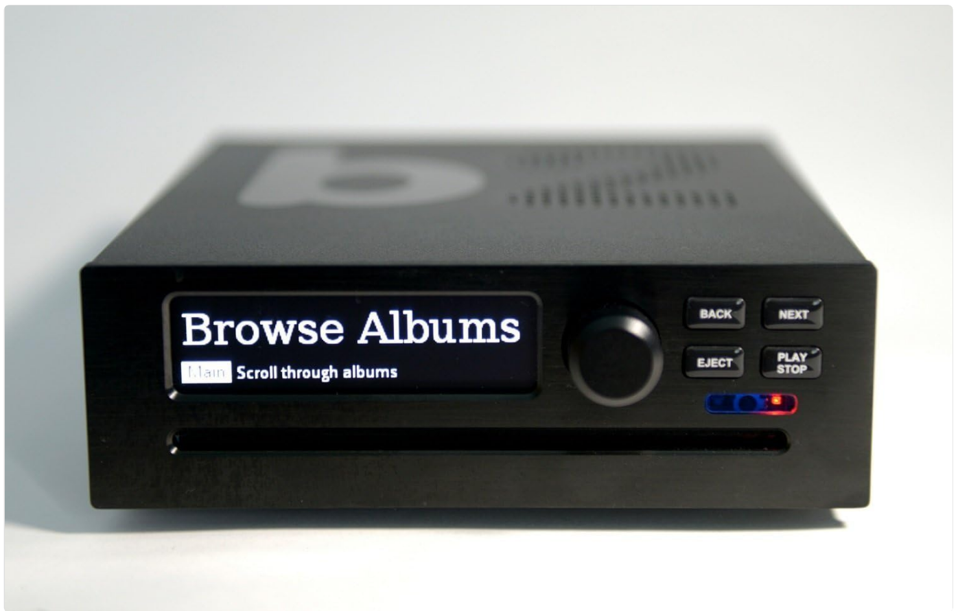
Image: The Brennan B2 display showing the "Browse Albums" menu, indicating music library navigation.