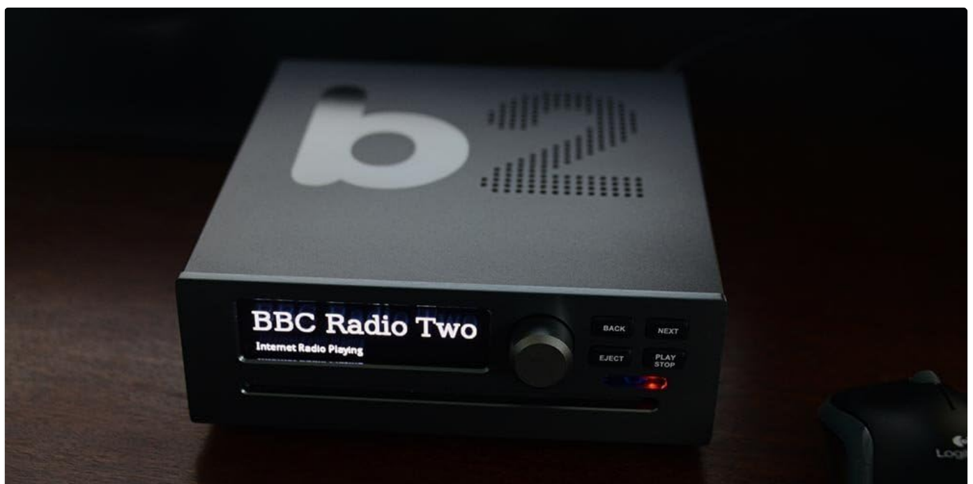
Image: The Brennan B2 displaying "BBC Radio Two", indicating active internet radio playback.

The B2 provides access to a vast array of Internet Radio stations and integrates with popular streaming services.