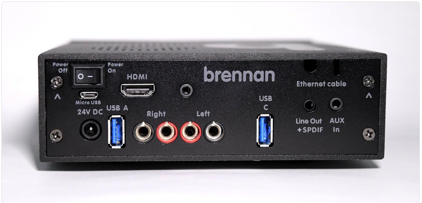
Image: Rear panel of the Brennan B2, detailing the power switch, 24V DC input, Micro USB, USB A, HDMI, Right/Left audio outputs, USB C, Line Out + SPDIF, AUX In, and Ethernet cable port.

Before powering on, connect the necessary cables to the rear panel of the B2. Refer to the diagram below for port identification.