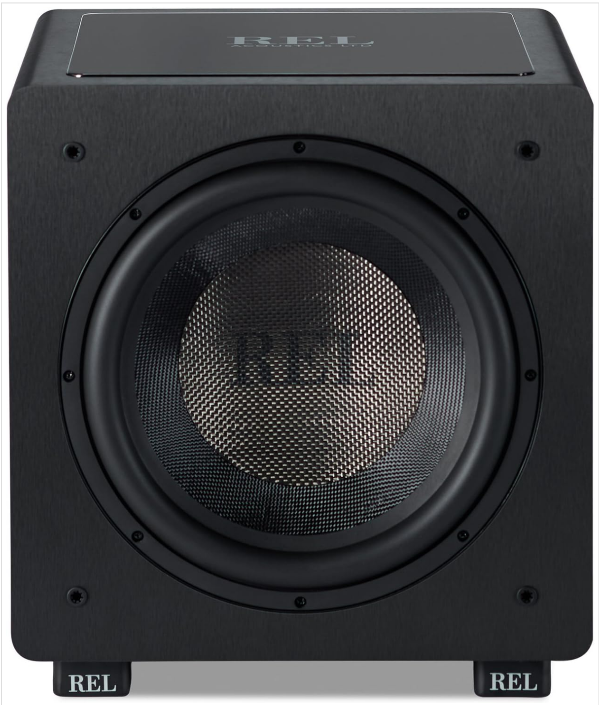
Figure 2.1: Front view of the HT/1205 Subwoofer, highlighting the 12-inch driver.