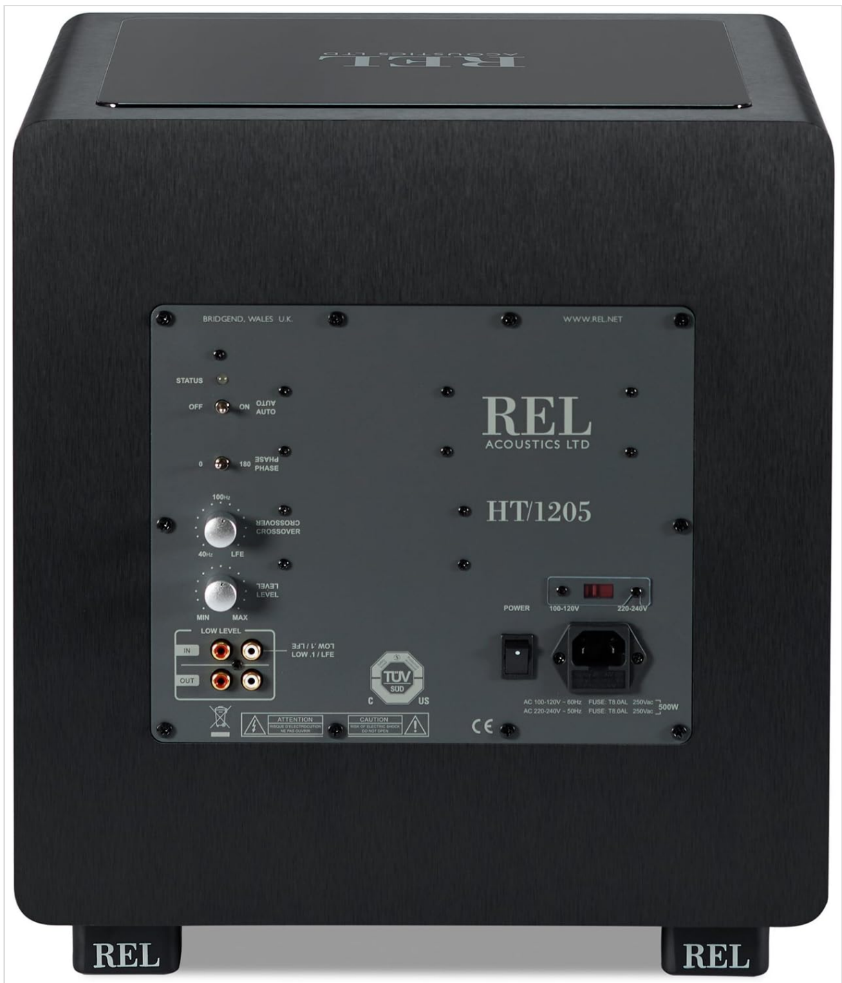
Figure 2.2: Rear panel of the HT/1205 Subwoofer with various controls and input/output options.

Video 2.1: An overview of the REL Acoustics HT/1205 Subwoofer, detailing its design and features.