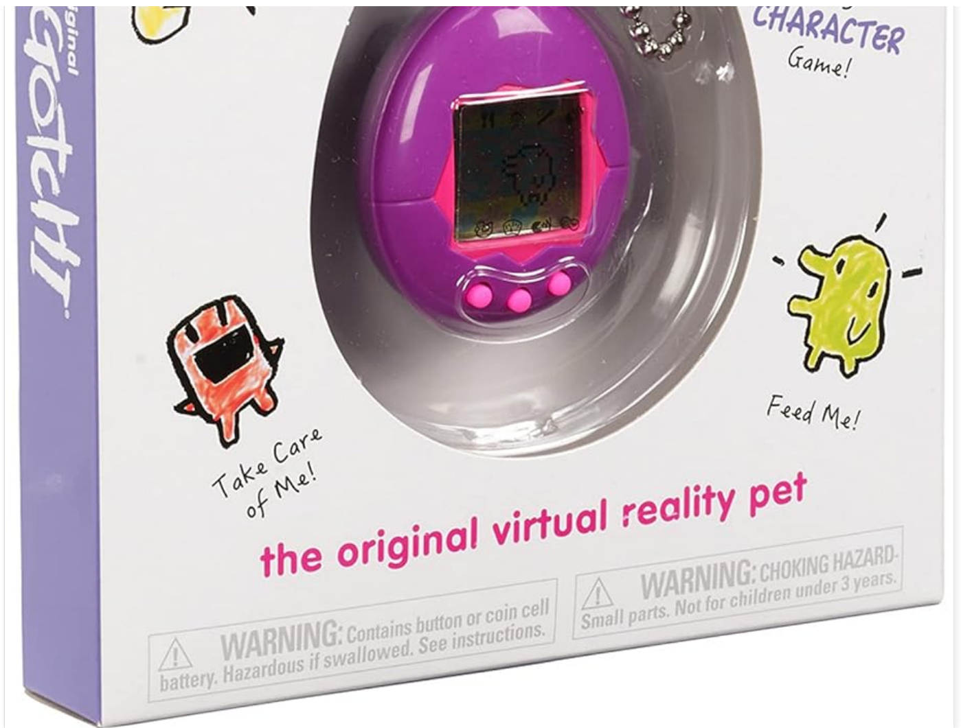
Image 2: A close-up view of the Tamagotchi Original device, highlighting the screen and the three control buttons for user interaction.