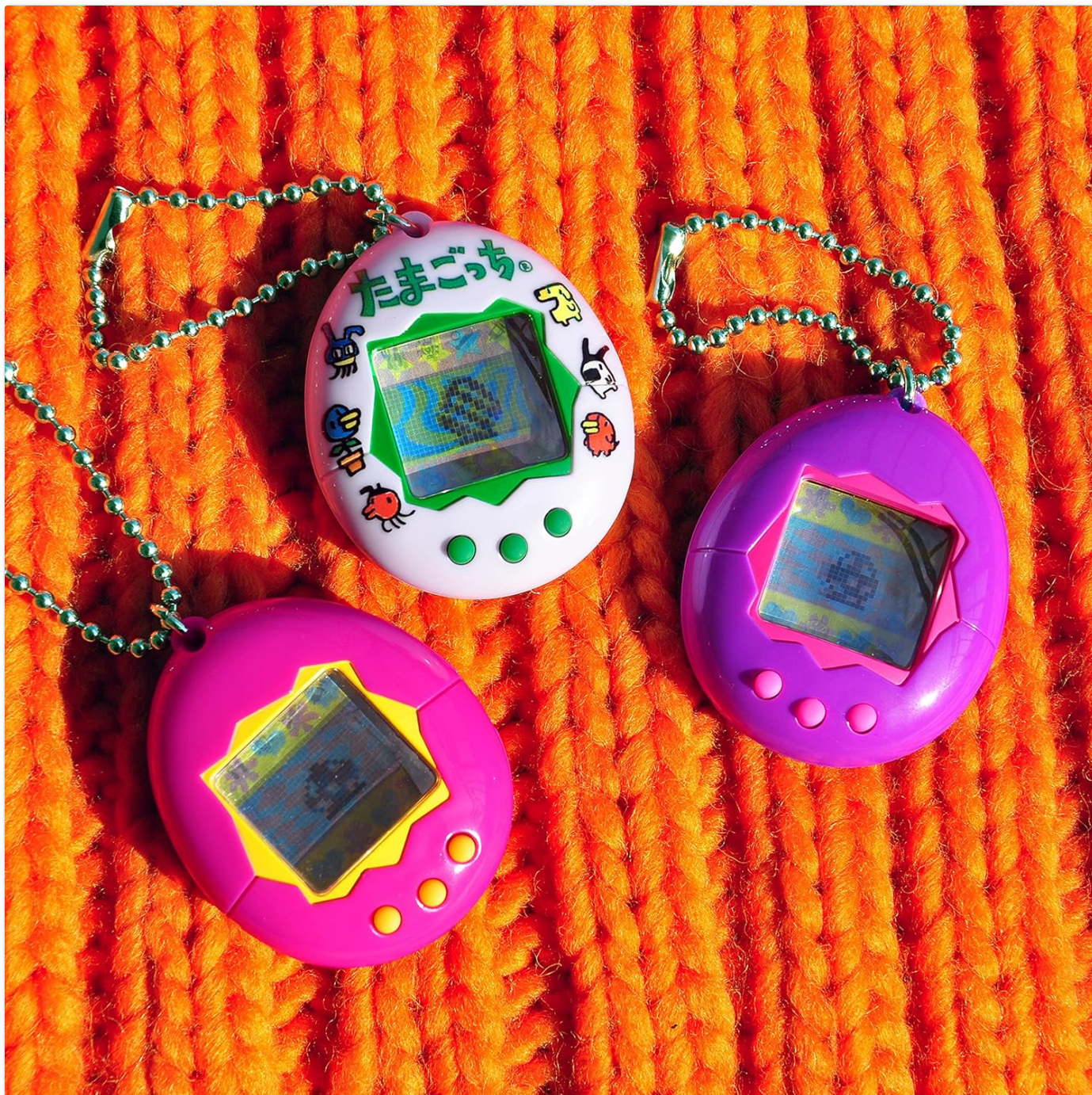
Image 4: A collection of Tamagotchi devices, illustrating the variety of colors available and the compact size of the digital pets.