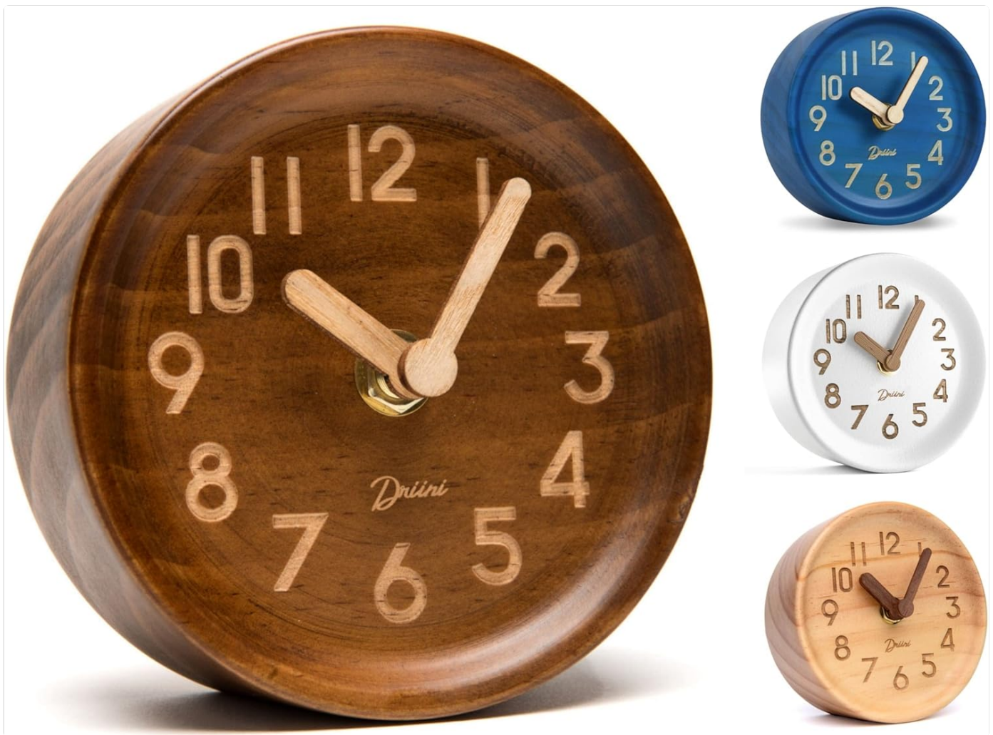
Figure 1: Driini Wooden Analog Desktop Clock (Dark Brown) and other available colors.