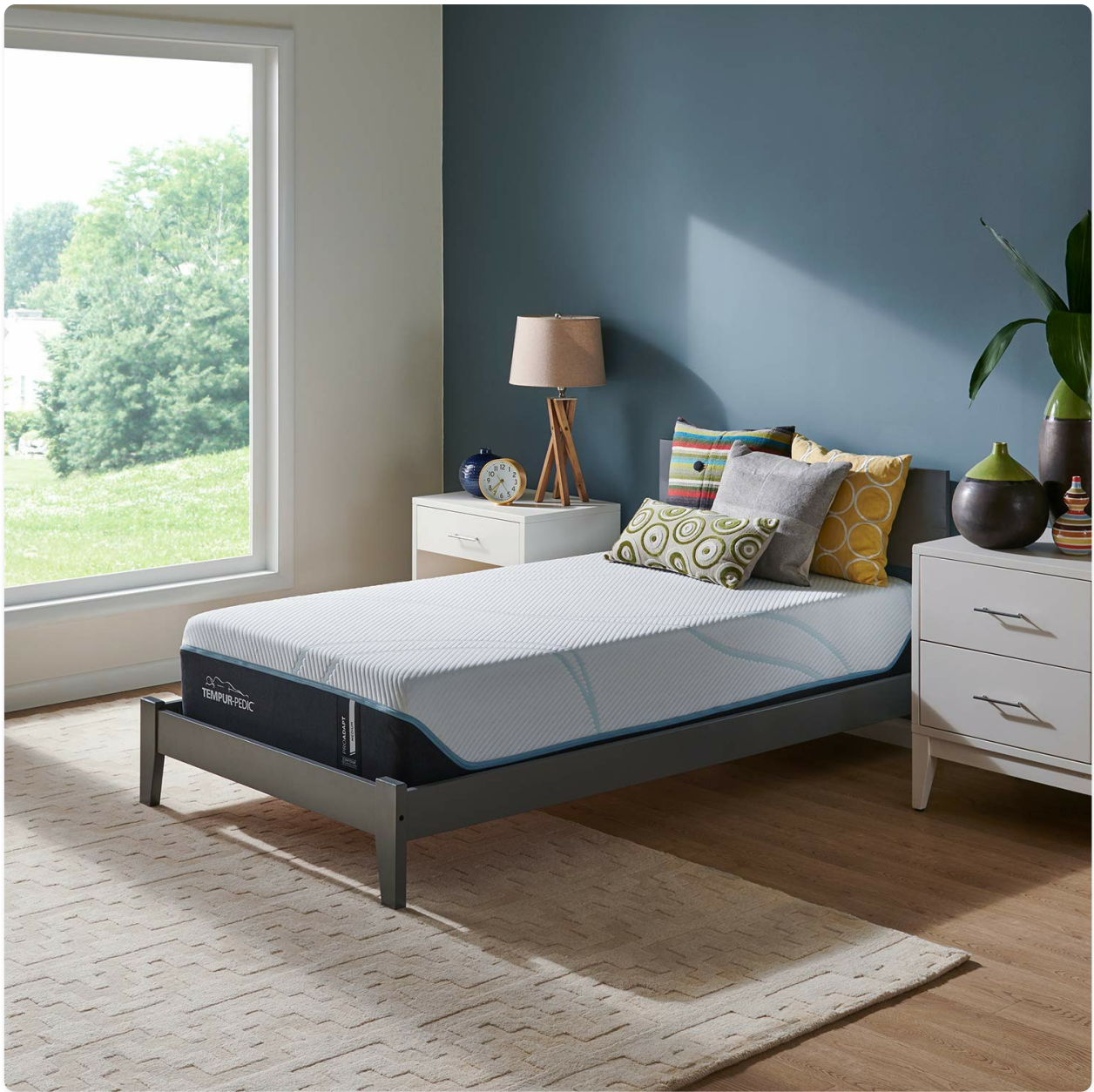
Image: The Tempur-Pedic TEMPUR-ProAdapt 12-Inch Medium Foam Mattress, Twin XL, showcasing its design and profile.