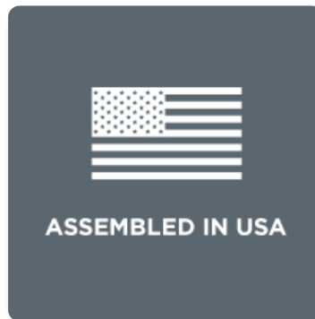
Image: An icon indicating the mattress is assembled in the USA.