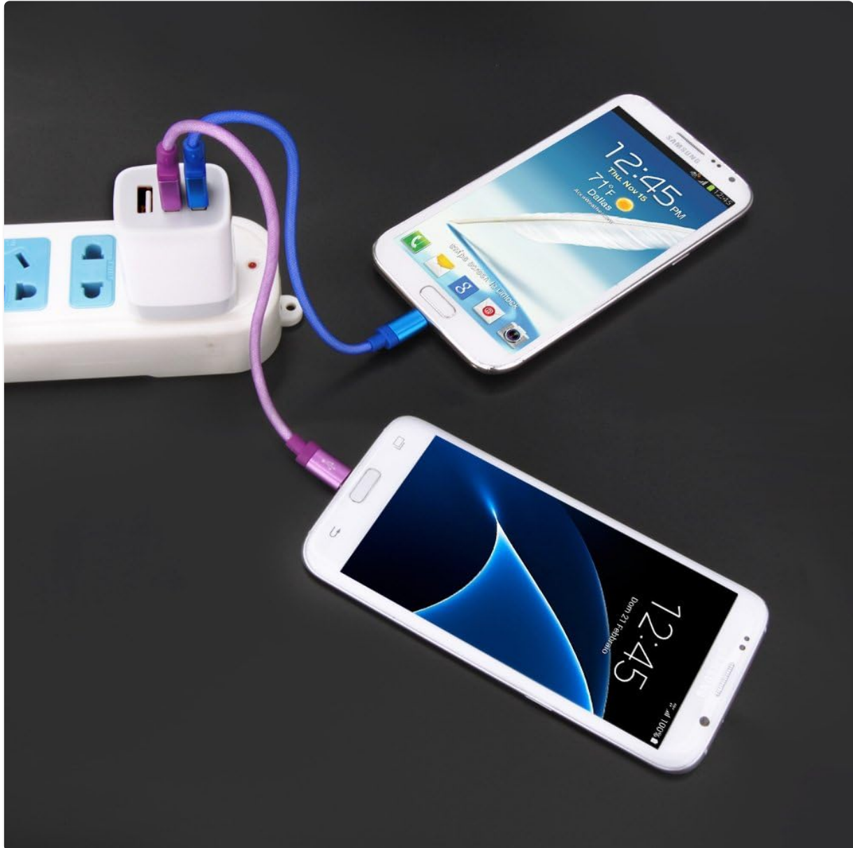
Image 3: The HOOTEK 3-Port USB Wall Charger in use, demonstrating simultaneous charging of two smartphones.