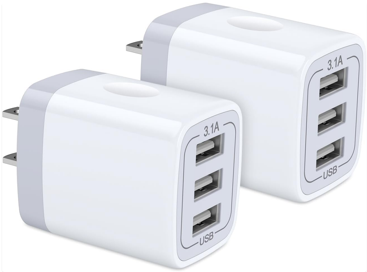
Image 1: Two HOOTEK 3-Port USB Wall Chargers, showcasing their compact design and multiple USB ports.