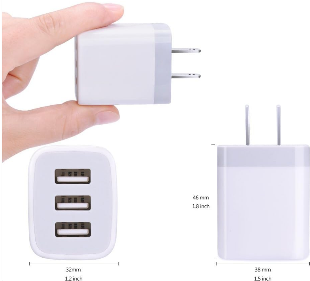
Image 2: The HOOTEK 3-Port USB Wall Charger, illustrating its compact size and dimensions (1.8 x 1.5 x 1.2 inches).