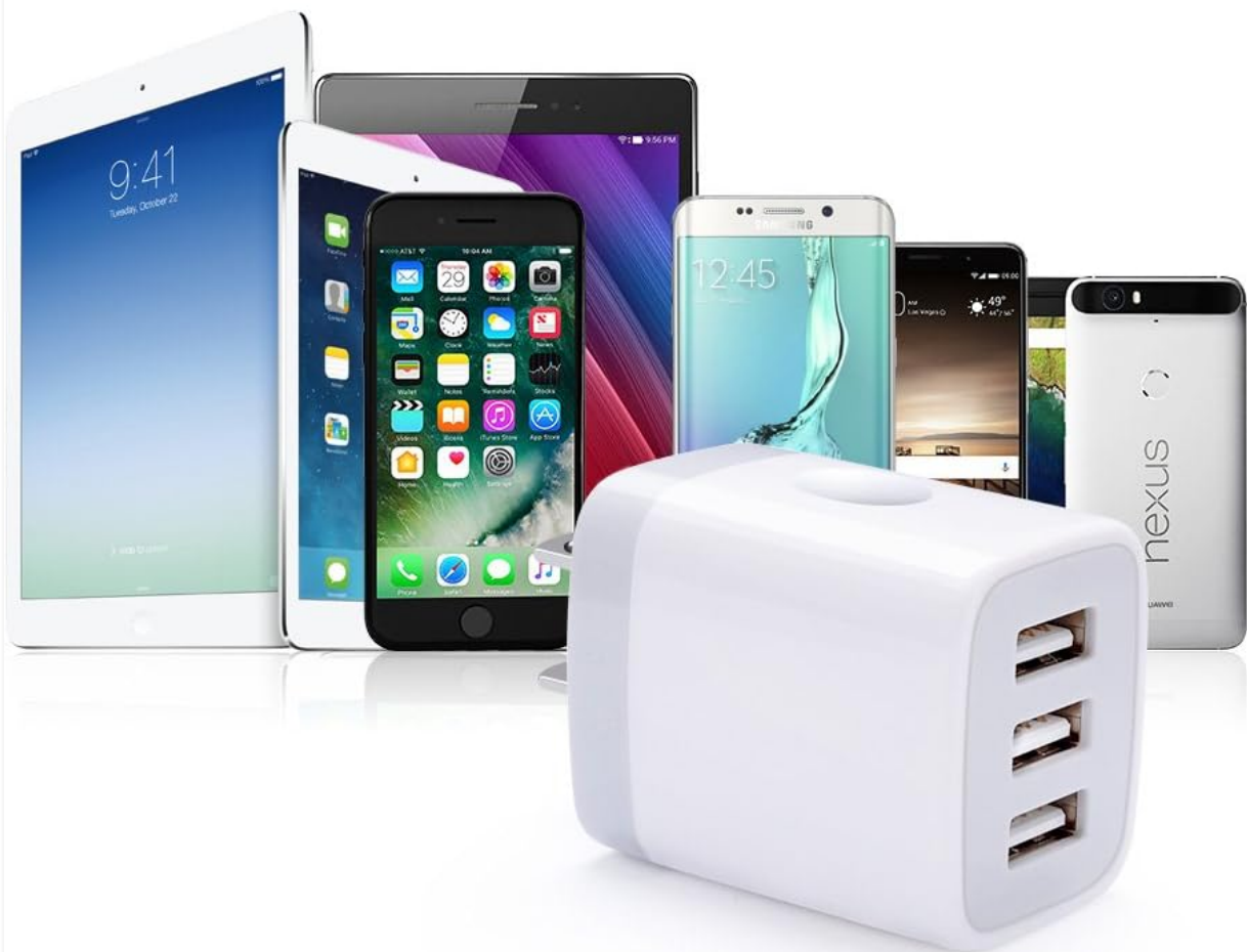
Image 4: The HOOTEK 3-Port USB Wall Charger positioned among a variety of smartphones and tablets, illustrating its broad compatibility.

Perfect fit Apple Iphone,ipad,and samsung Blackberry android Devices ETC