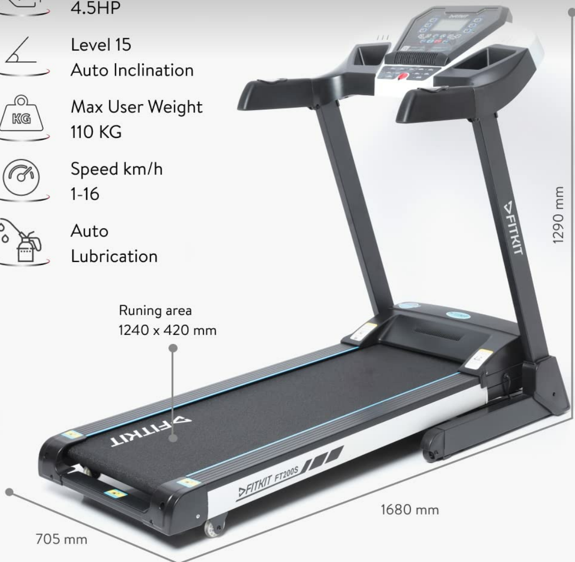
Image: An overview of the Fitkit FT200S Treadmill, illustrating its overall dimensions and key features like motor power and maximum user weight.