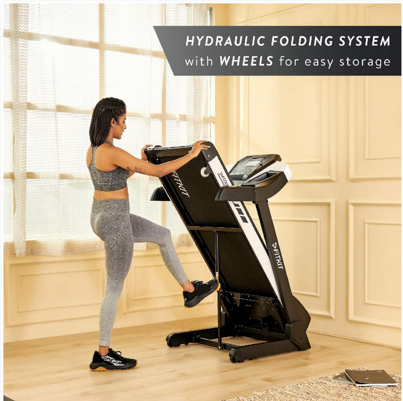
Image: The Fitkit FT200S Treadmill showcasing its hydraulic folding system for convenient storage and setup.

The treadmill features a hydraulic folding system for easy storage. To unfold, gently lower the running deck until it locks into place.