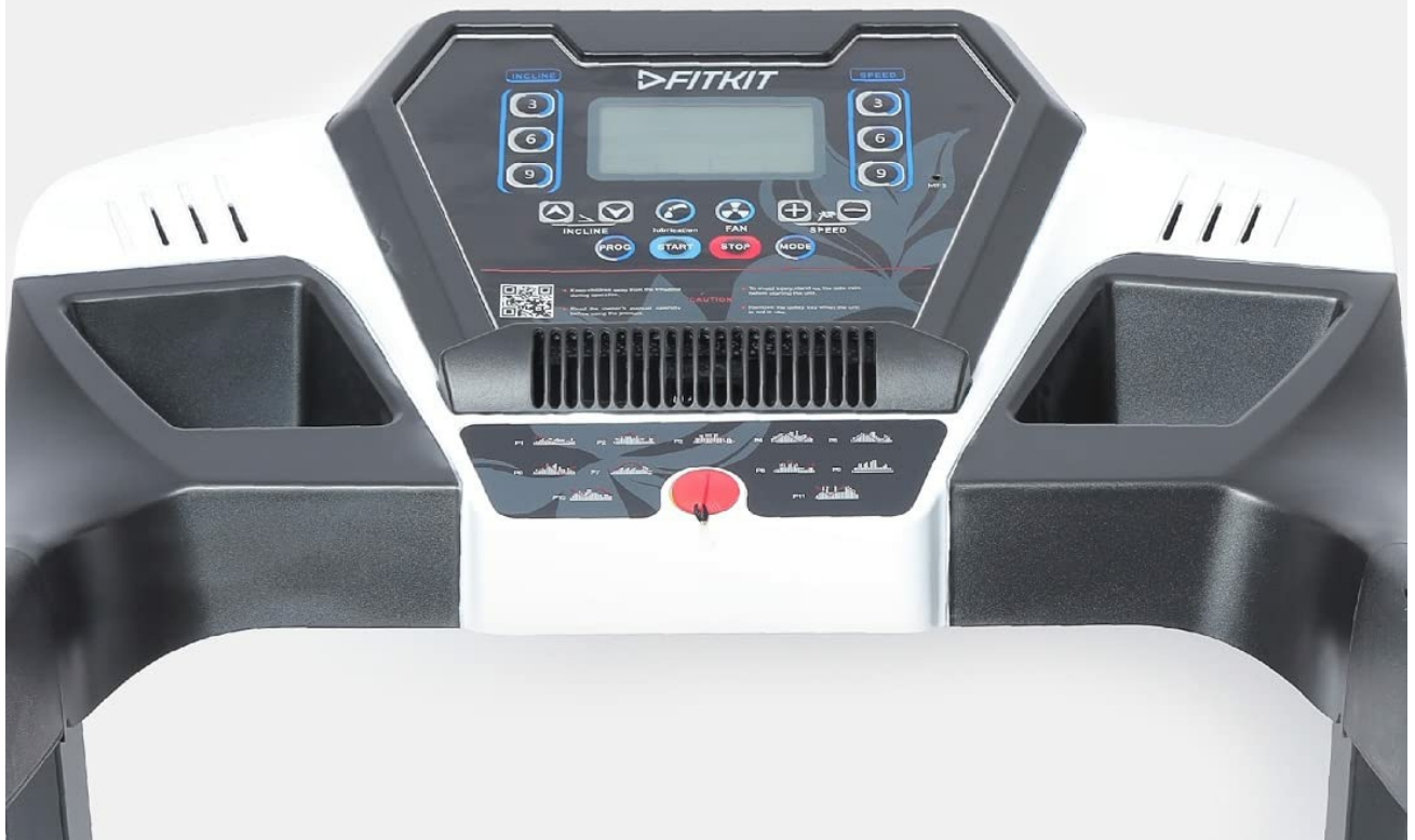
Image: Detailed view of the treadmill's control panel, highlighting the LCD screen, speed and incline buttons, and integrated holders.

*Connection to Cultsport and Fitwarz app