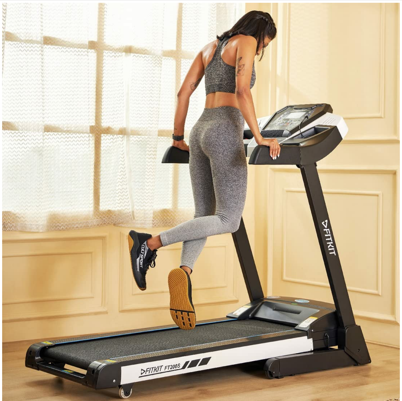
Image: A person actively using the Fitkit FT200S Treadmill, illustrating the ergonomic design and user experience.