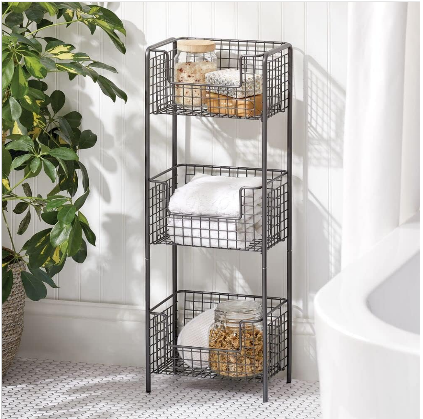
Image: The mDesign 3-Tier Storage Organizer in Graphite Gray, positioned in a bathroom. The baskets are filled with bath salts, folded towels, and a jar of potpourri, demonstrating its use for organizing bathroom essentials.