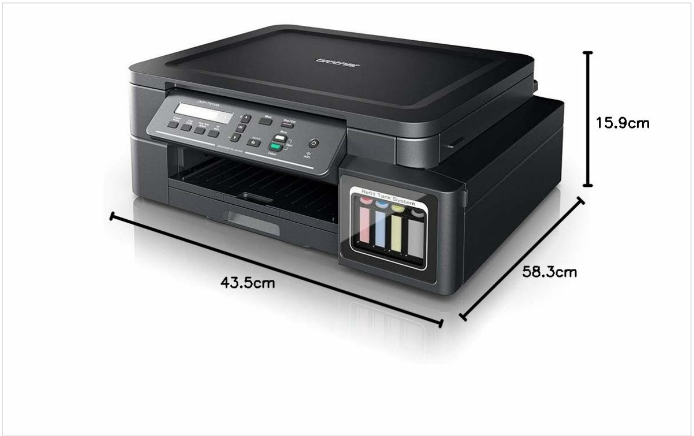
Figure 5: Dimensions of the Brother DCP-T510W printer for space planning.