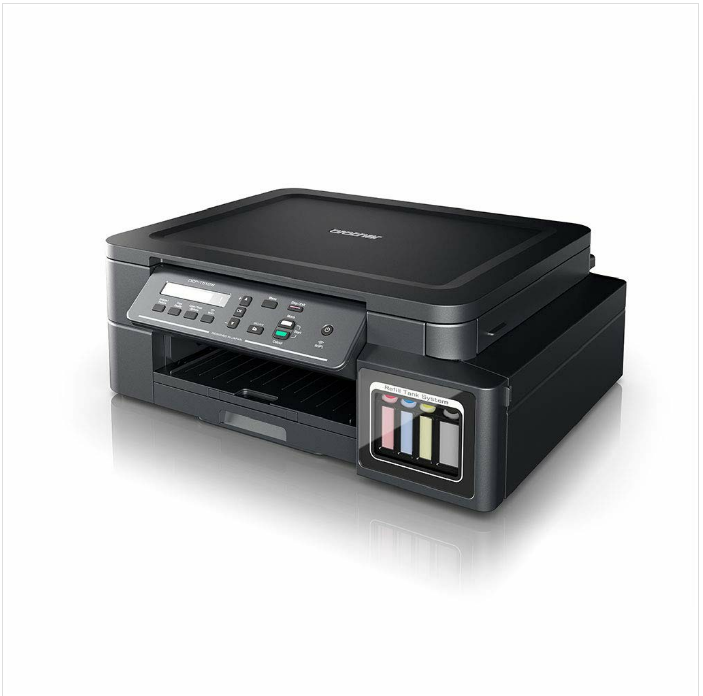
Figure 2: Angled view of the printer, showing the paper input tray and control panel.