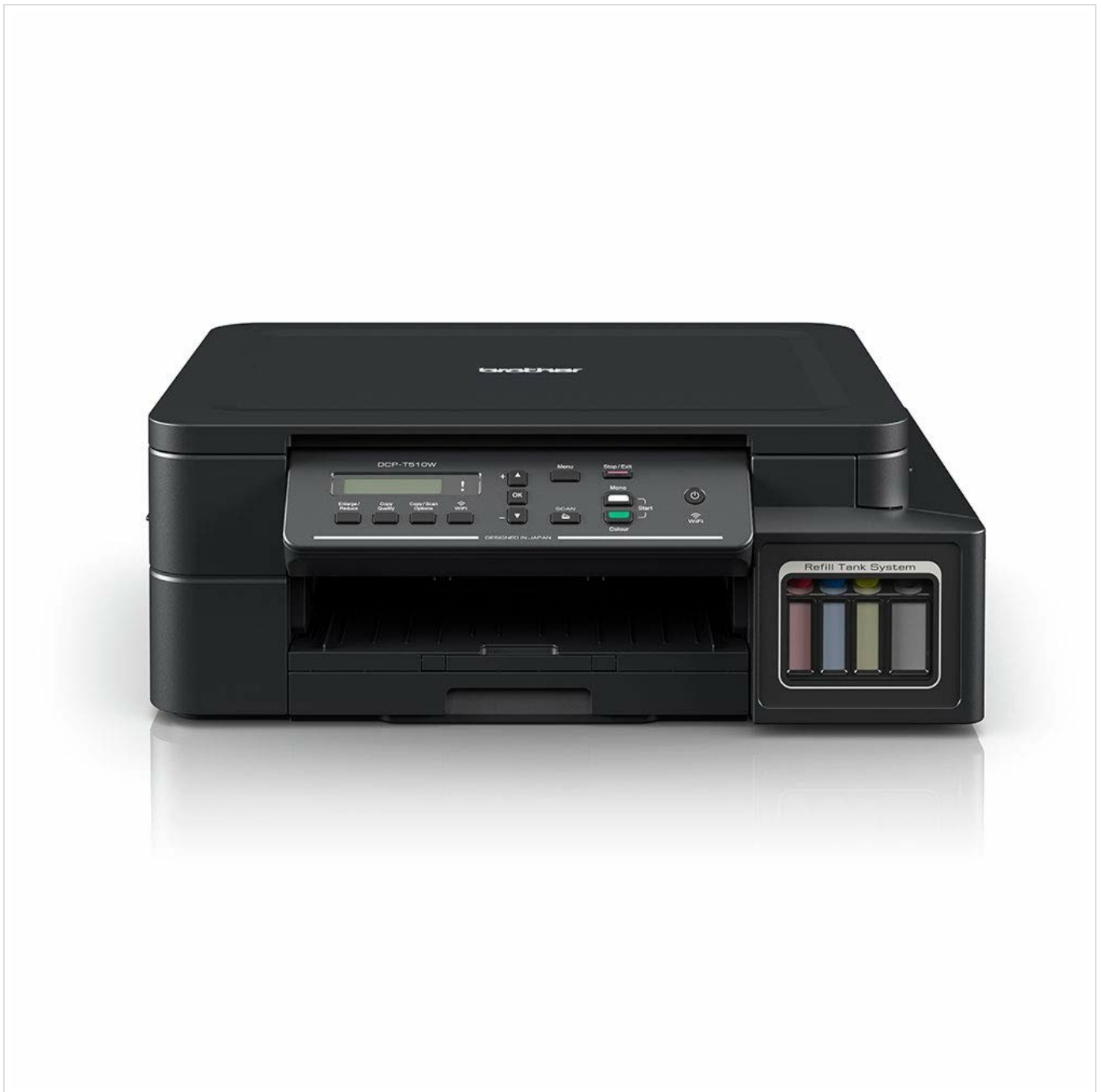
Figure 1: Front view of the Brother DCP-T510W Inkjet Printer, showcasing its compact design and integrated ink tanks.