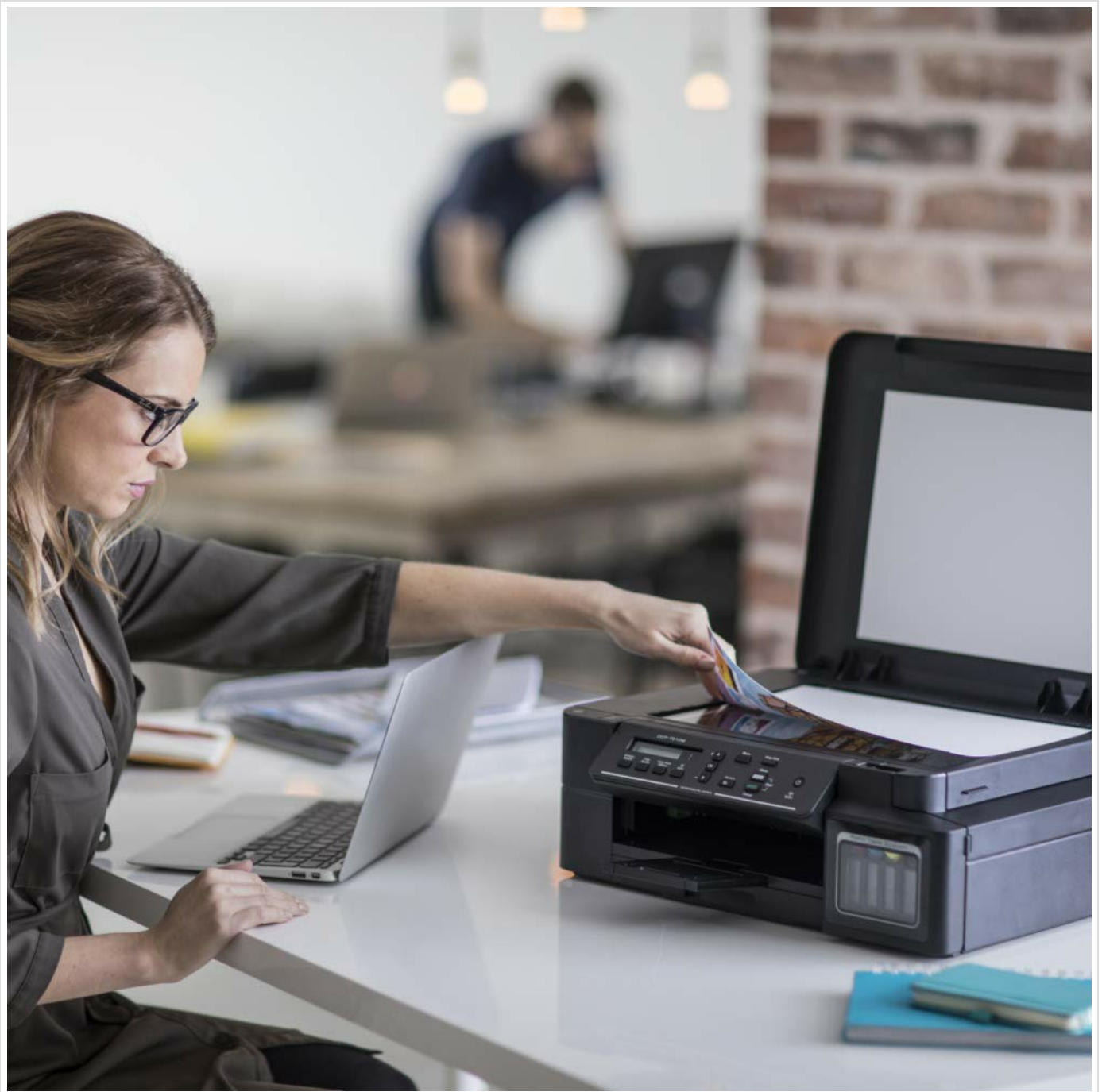
Figure 4: A user preparing to scan a document, highlighting the flatbed scanner functionality.