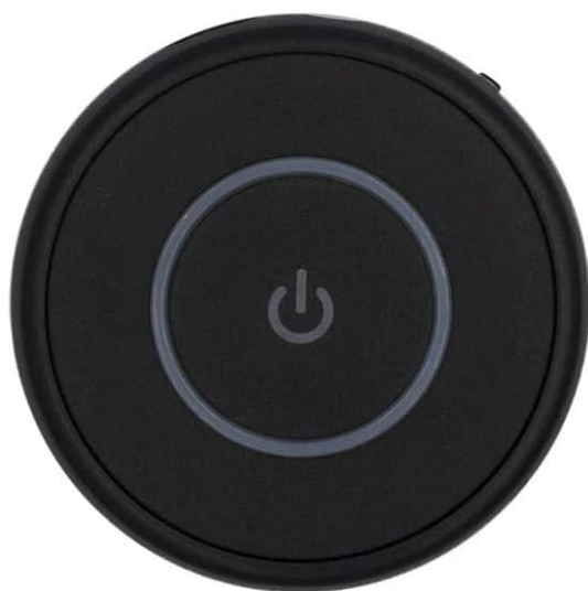
Low Latency Audio Transmitter & Receiver