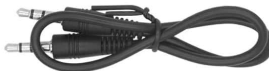
3.5mm Audio Cable

Image: The iDIGMALL BTI-018 showing its compact size with a diameter of 4.9cm, height of 1.3cm, and net weight of 21g.