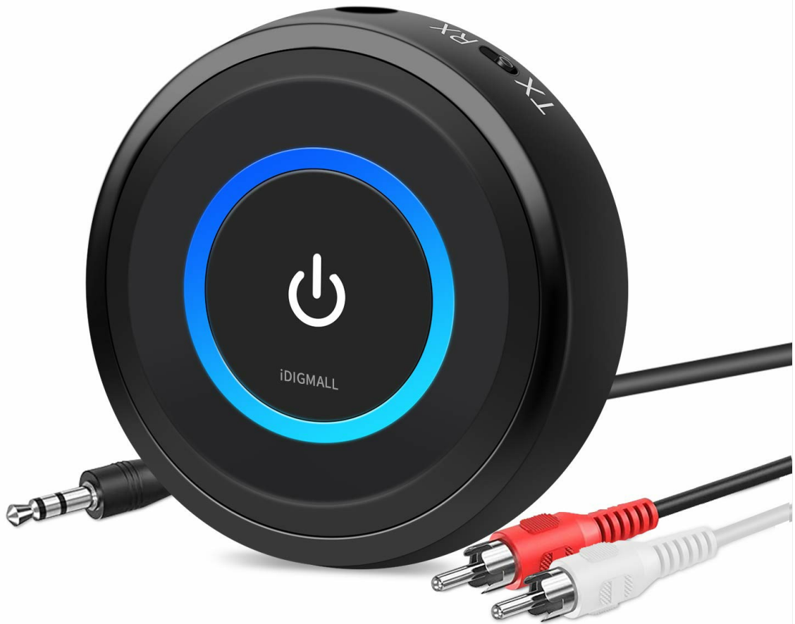
Image: The iDIGMALL BTI-018 Bluetooth 5.0 Transmitter Receiver.