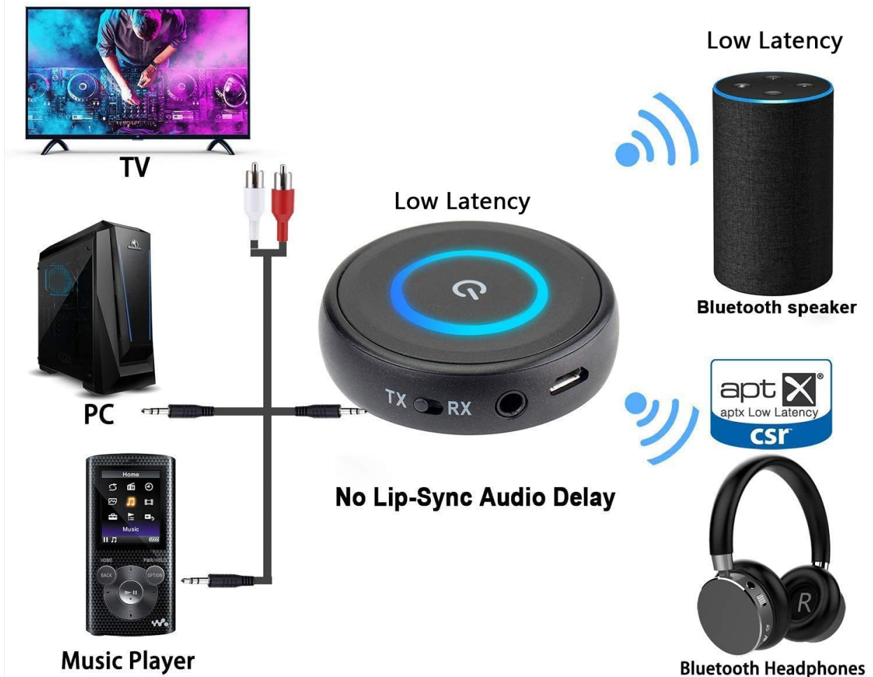
Image: The iDIGMALL BTI-018 device, 3.5mm audio cable, and RCA audio cable.

Wired connect to audio input devices and transmit HD sound via bluetooth