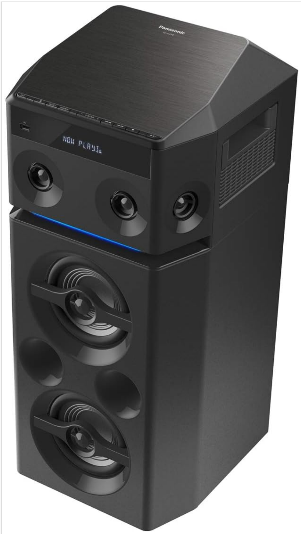
Angled view of the SC-UA30, illustrating its design and integrated handles for easy transport.