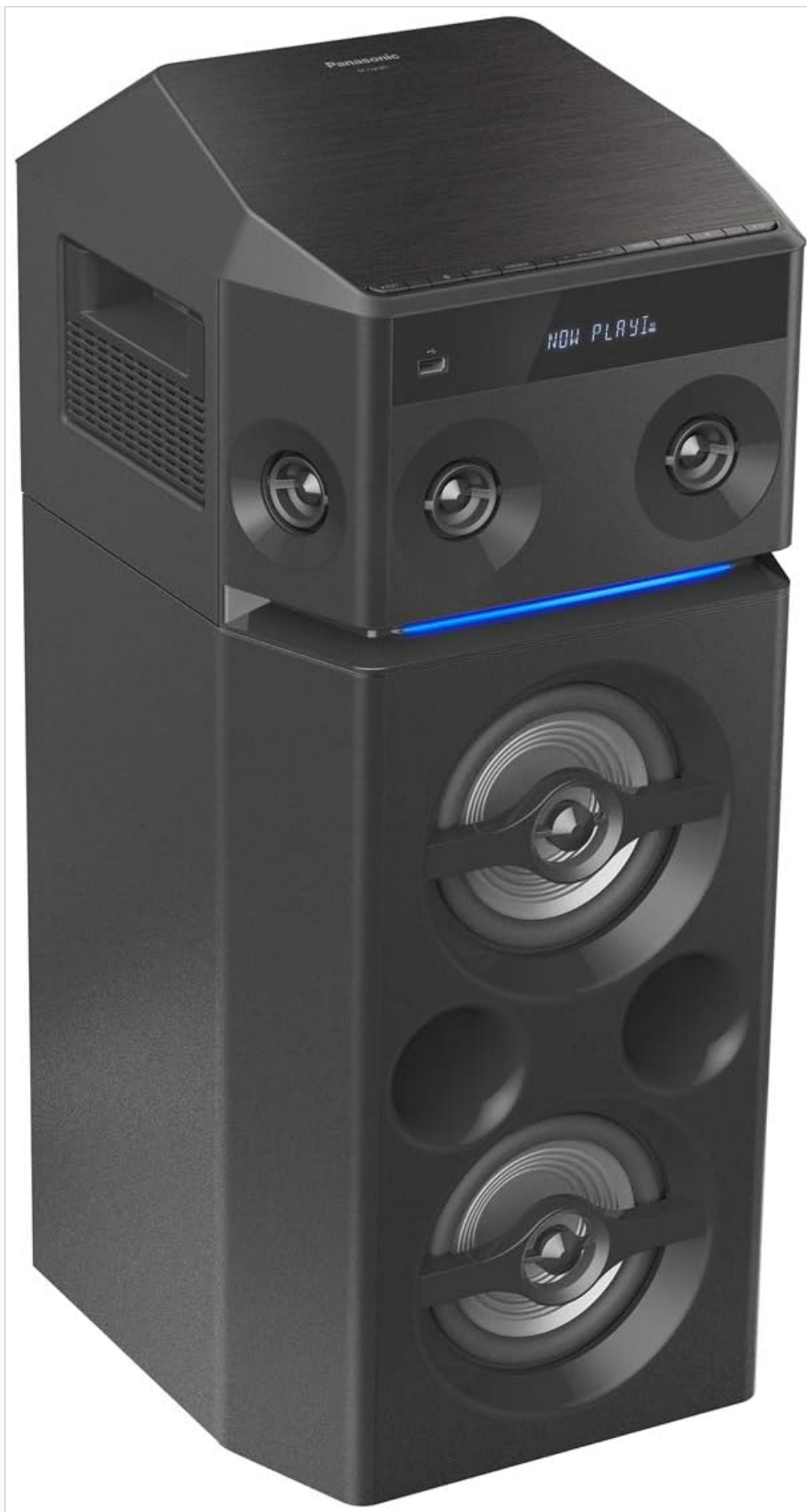
Side profile of the SC-UA30, demonstrating its vertical design.