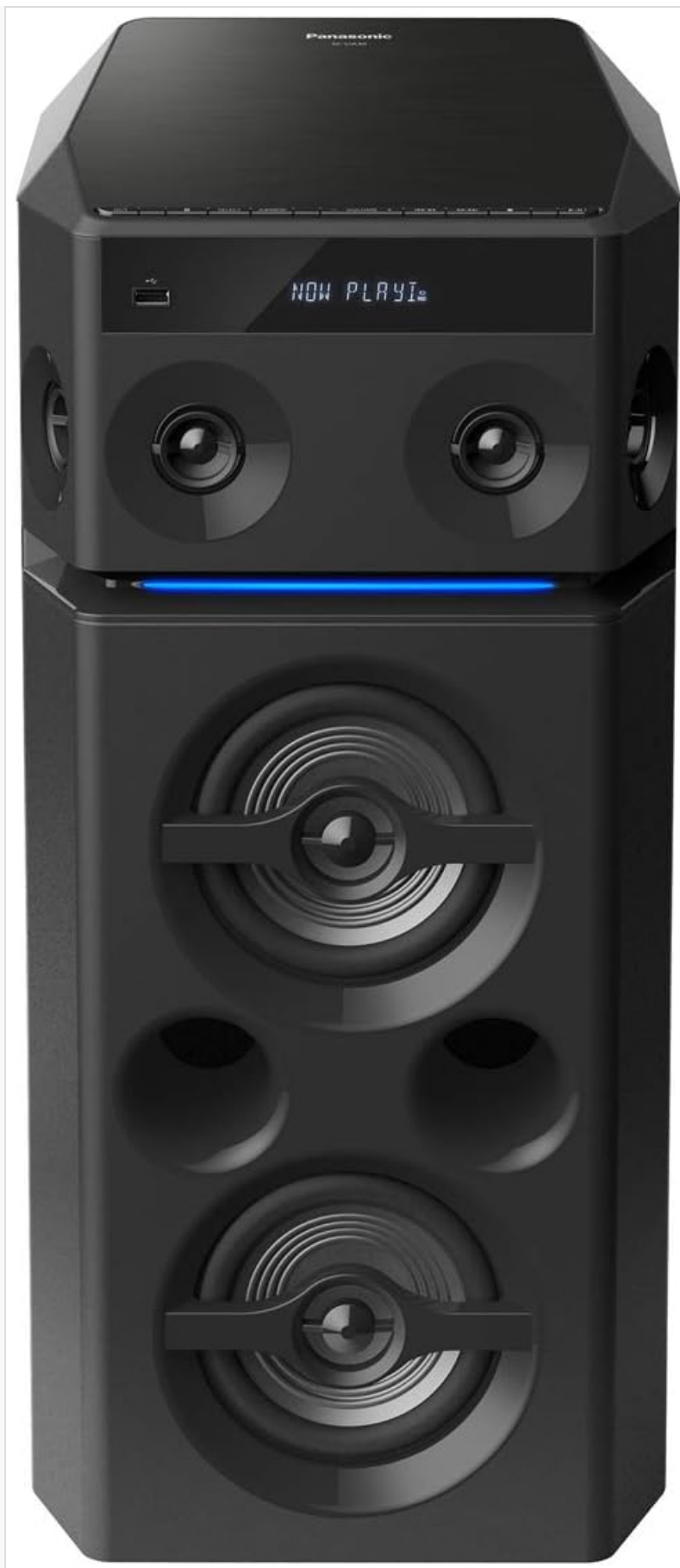
Front view of the Panasonic SC-UA30, highlighting the speaker configuration and accessible control panel.