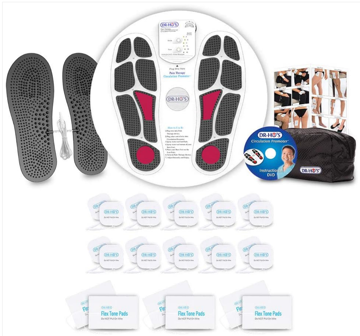
Figure 3.1: All components included in the Dr Ho's Circulation Promoter Deluxe Package.