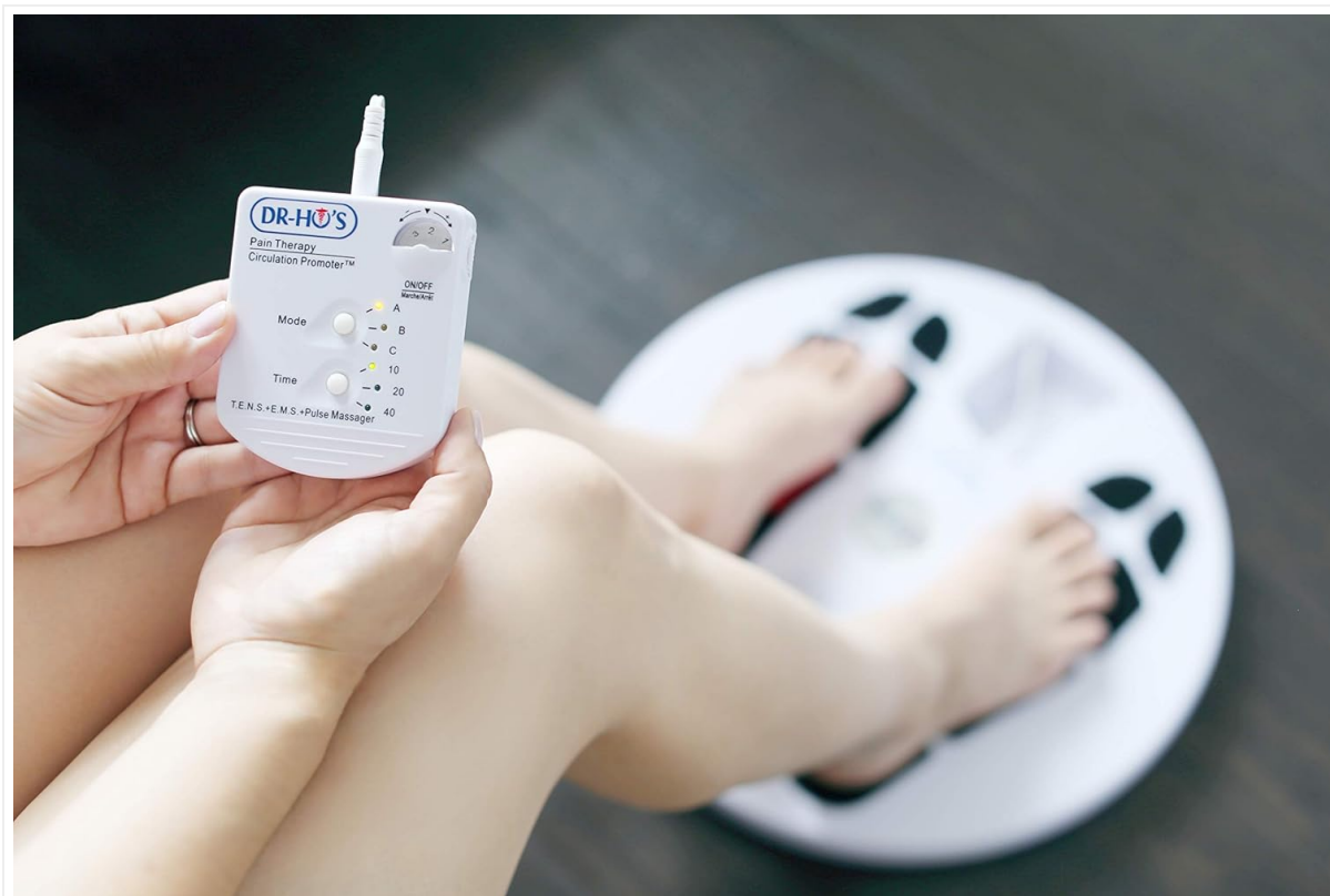
Figure 6.2: A user adjusting settings on the control unit during a session.