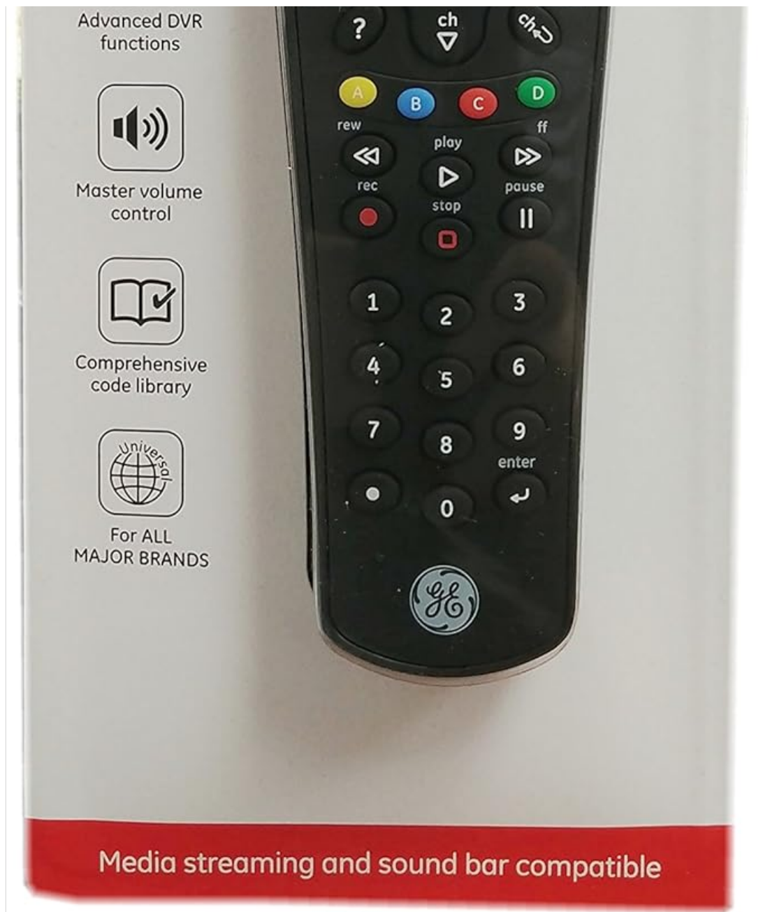
Image: The GE 34932 4-Device Universal Remote, displayed in its retail packaging. The packaging highlights features such as "Perfect for DVR," "4 Device," "Media streaming," "Advanced DVR functions," "Master volume control," "Comprehensive code library," and "For ALL MAJOR BRANDS." The remote itself is black with various control buttons.