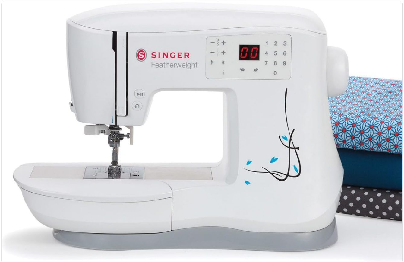
Figure 3: A detailed close-up of the needle and presser foot area on the Singer Featherweight C240, highlighting the precision components for sewing.