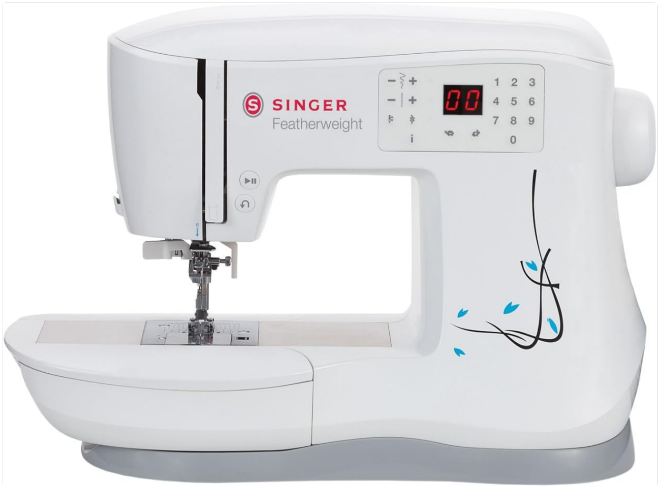
Figure 1: Front view of the Singer Featherweight C240 sewing machine, showcasing its compact design and control panel.