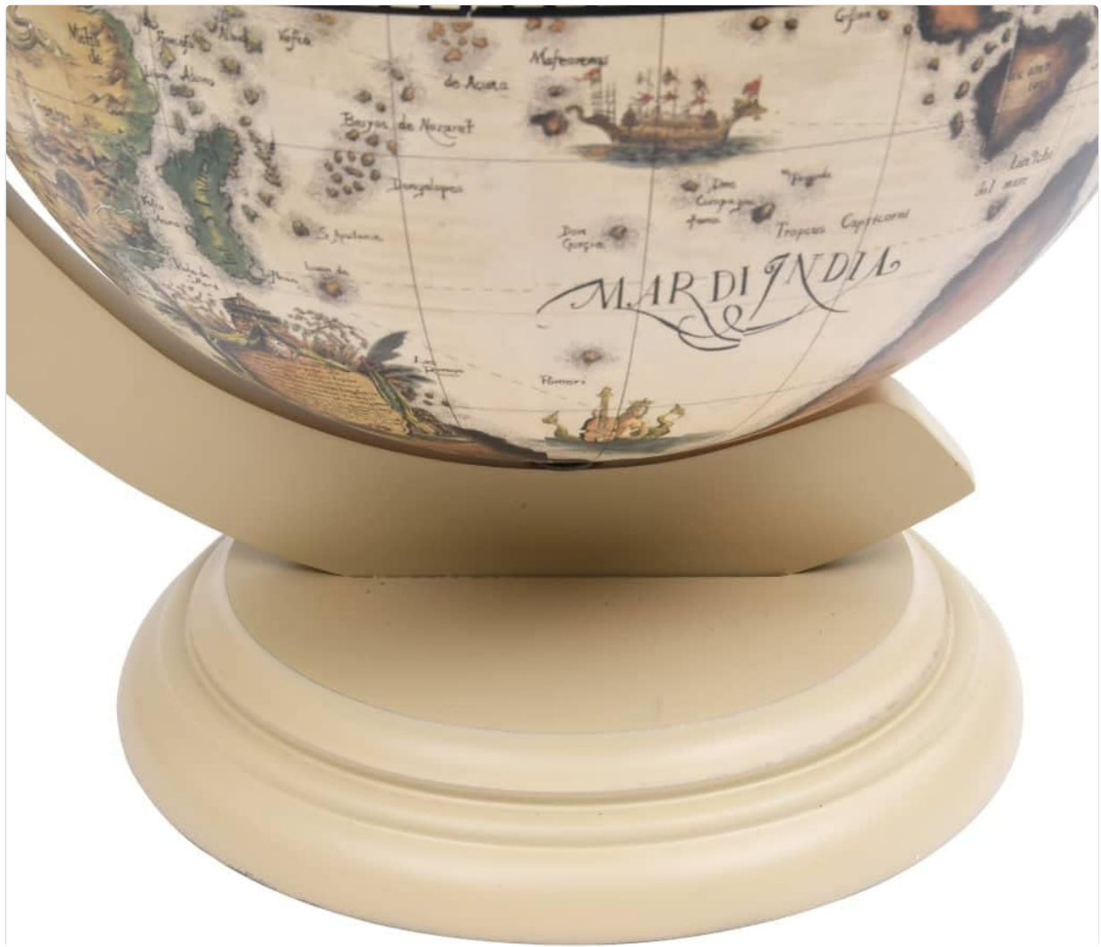
Image 3.2: Detail of the light-colored wooden base, showing the pedestal design.