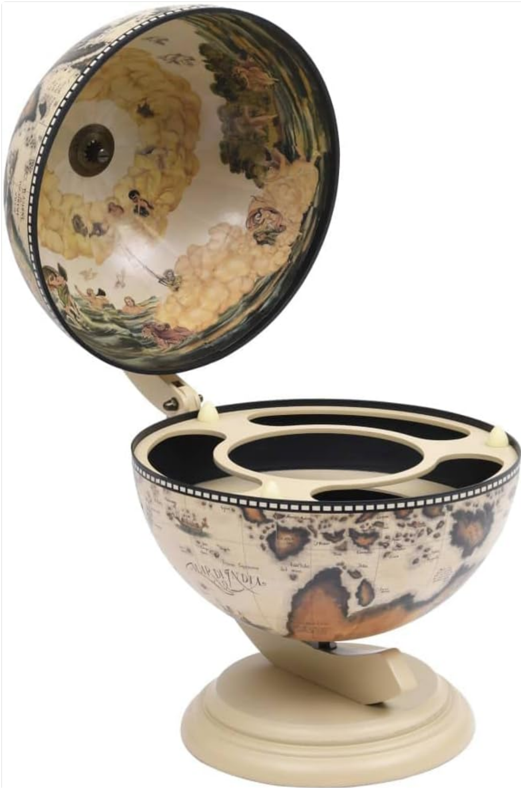
Image 4.1: The globe bar in its open position, showcasing the internal compartments for bottles and stemware.