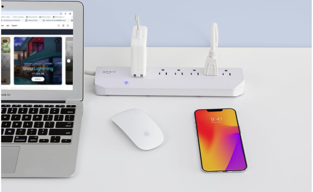
Figure 4: Remote control of individual outlets through the Geeni mobile application.