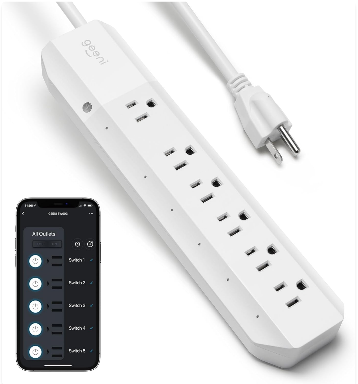
Figure 1: Geeni Smart Surge Protector and companion mobile application.