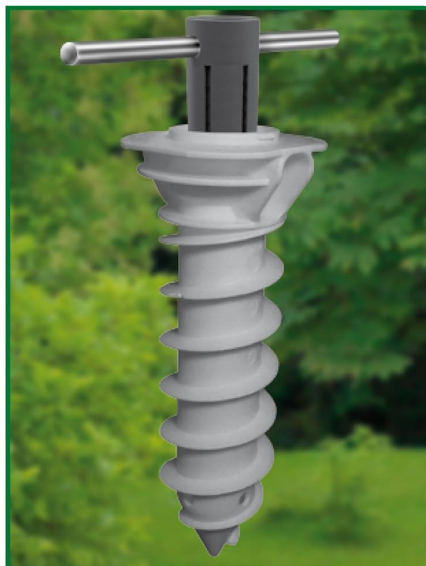
Eindreh-Bodenhülse Bodeneben Eindrehen statt Betonieren

Image: On the left, a close-up of the height adjustment mechanism, allowing for flexible working heights. On the right, a hanger holder, providing convenient spots for clothes hangers.