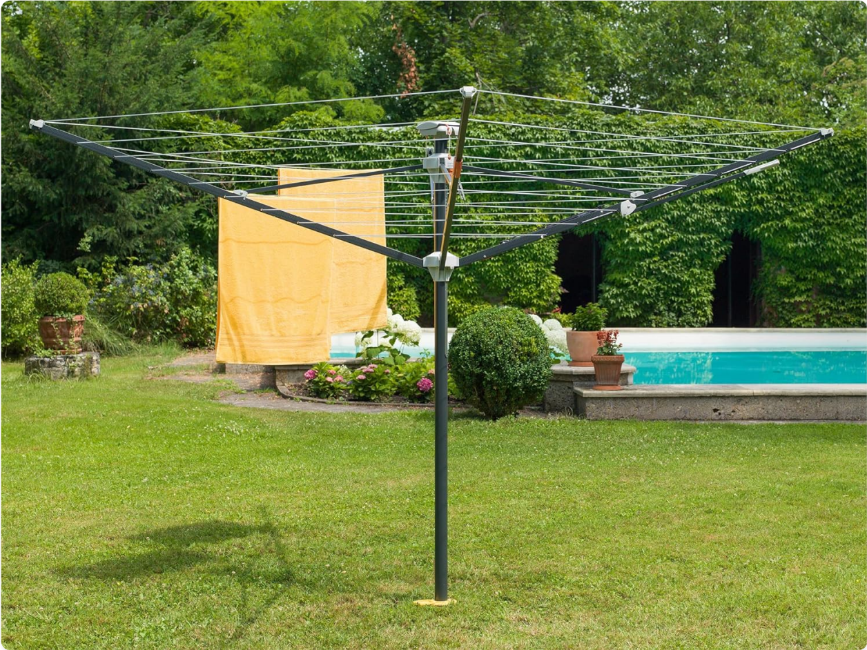
Image: The Juwel Futura Elegant XXL Clothes Dryer in a natural outdoor setting, demonstrating its full extension and capacity with laundry.