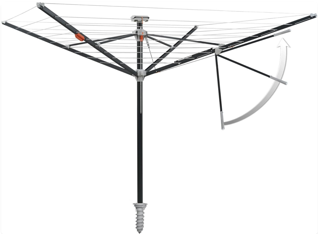
Image: The Juwel Futura Elegant XXL Clothes Dryer fully extended, ready for use in a garden.