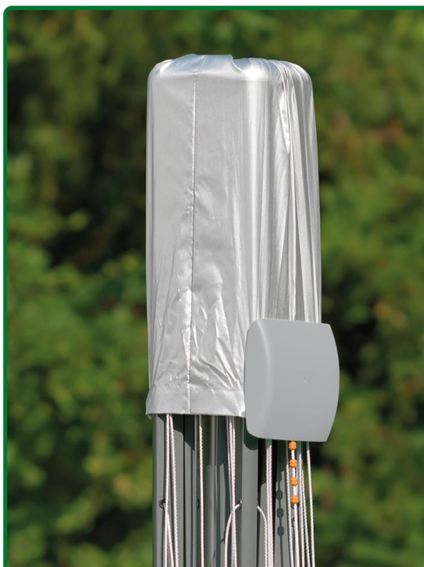
Schutzhüllenautomatik sorgt für eine immer saubere Wäschespinne