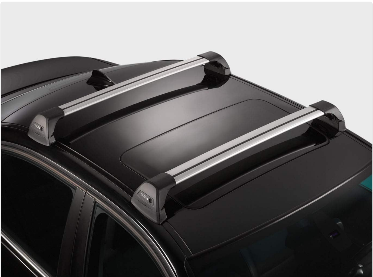
Figure 4.2: The Yakima CarshopXXL S25Y roof bars fully installed on a vehicle's roof. This image demonstrates the flush, low-profile appearance of the system.