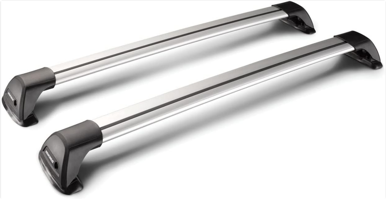
Figure 3.1: Overview of the Yakima CarshopXXL S25Y Flush/Mixed Roof Bars. This image shows the two roof bars with their end caps, ready for installation.