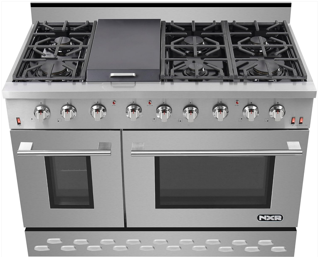
Figure 1.1: Front view of the NXR SC4811 48-inch Pro-Style Natural Gas Range.