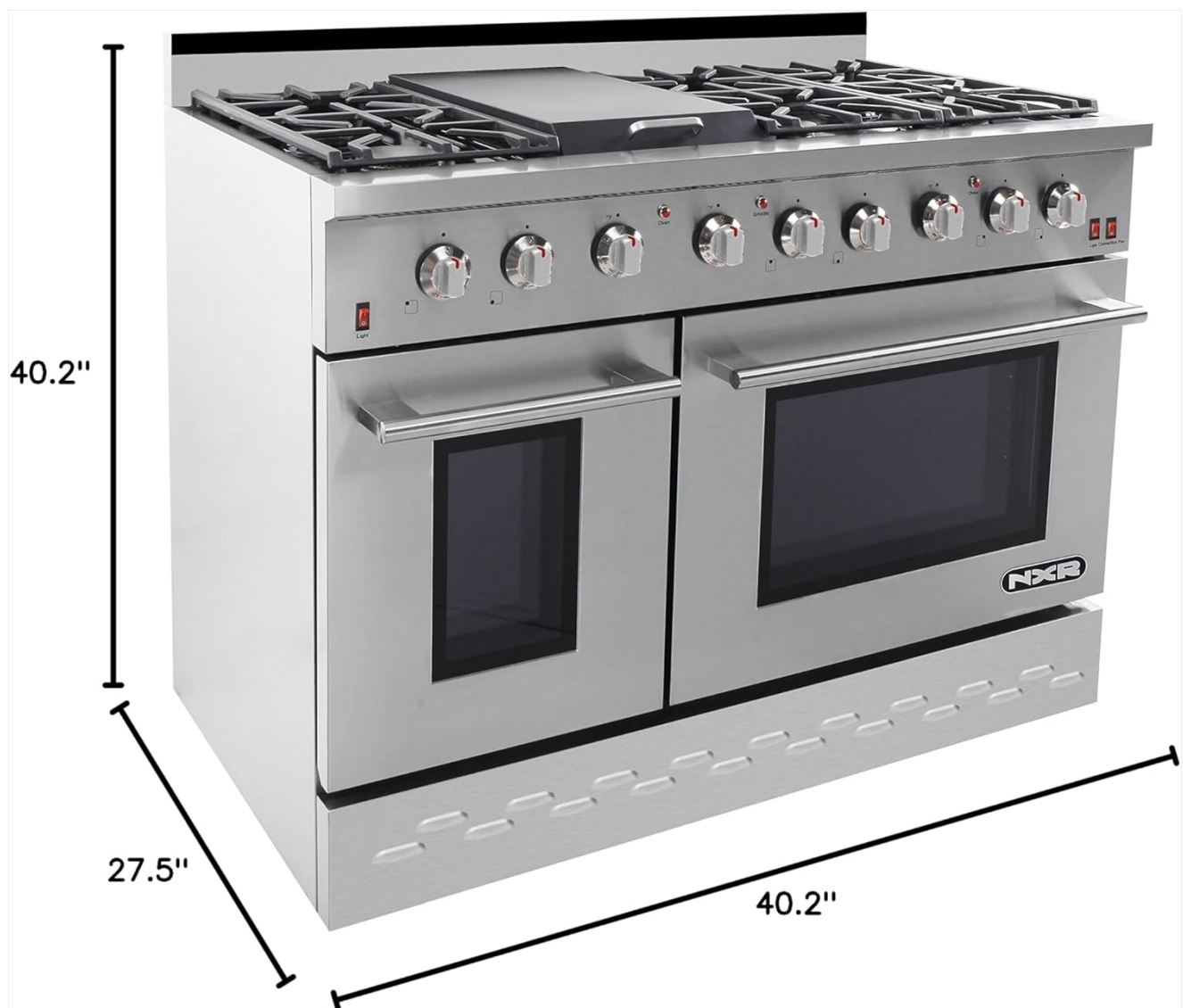
Figure 3.1: Product dimensions for installation planning.