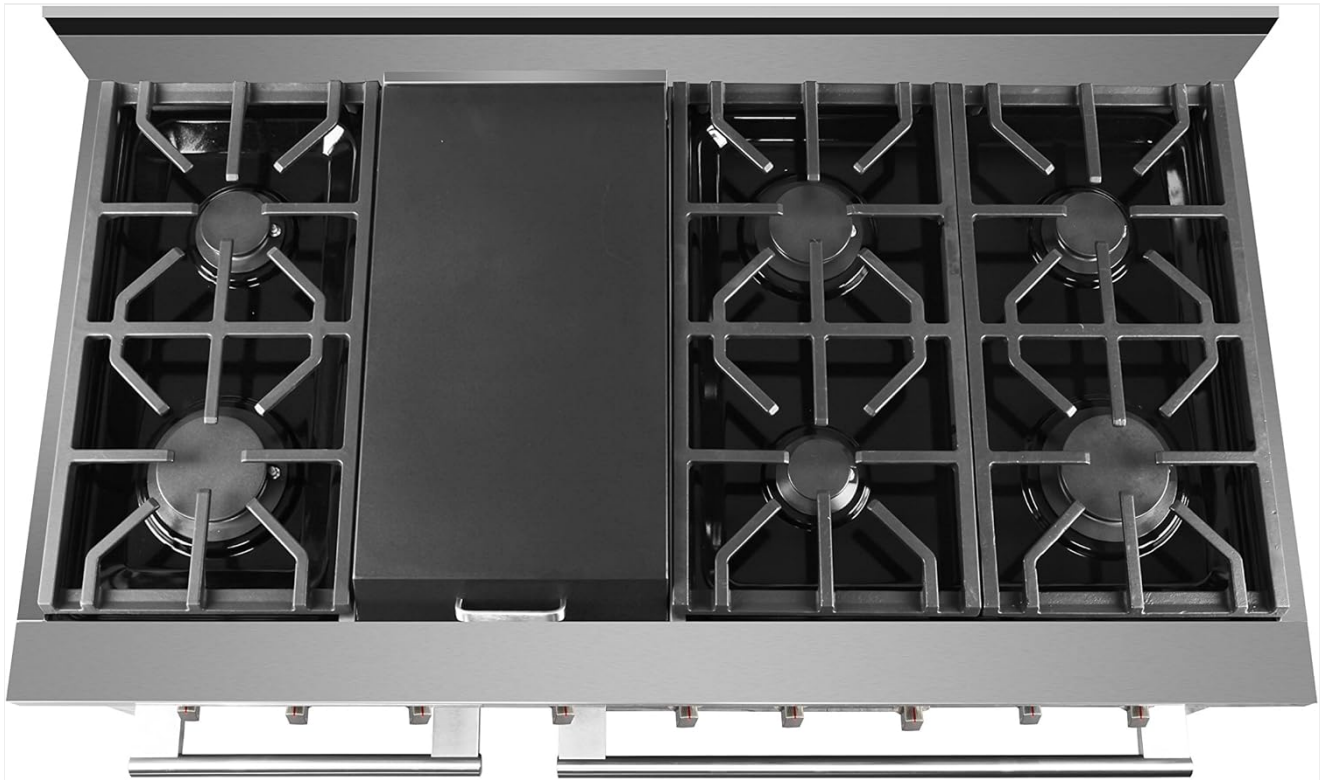
Figure 4.1: Cooktop layout with burners and griddle.