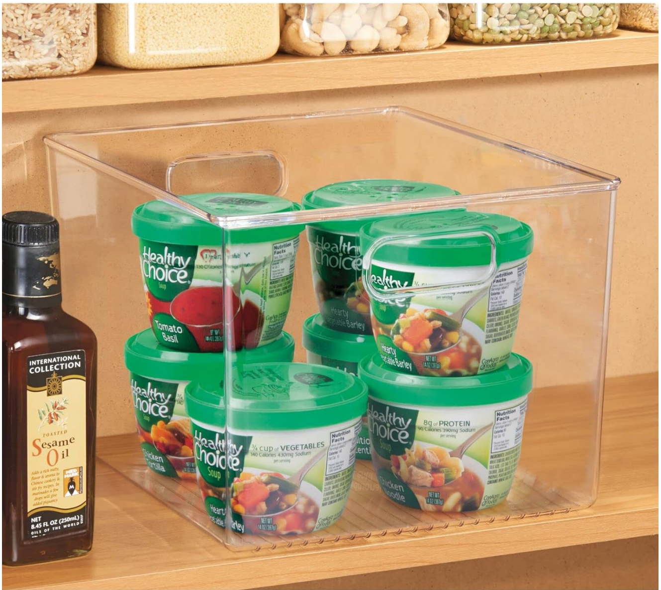
Image 3: A clear plastic storage bin holding several Healthy Choice soup containers, demonstrating its use for food storage.