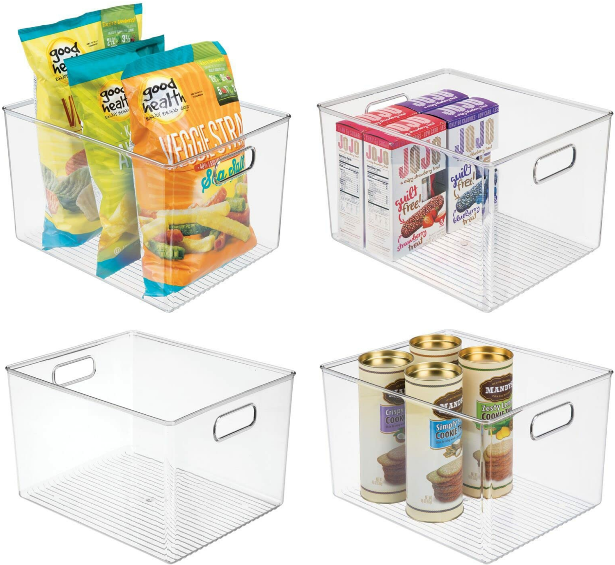
Image 1: A single mDesign Ligne Collection clear plastic storage bin, 12x10x8 inches, shown empty to highlight its design and handles.