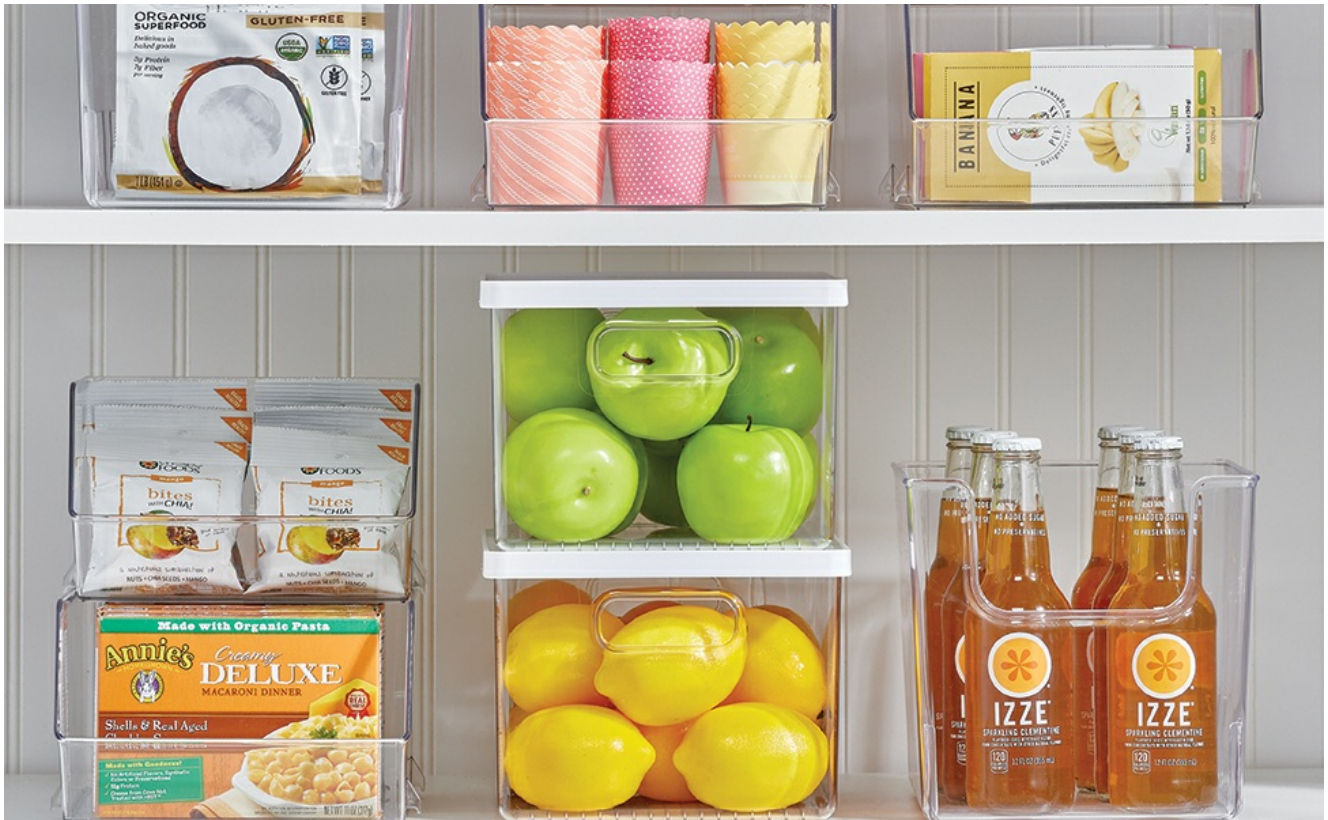
Image 2: Multiple mDesign clear plastic storage bins neatly arranged on white kitchen pantry shelves, holding various food items and drinks.

Utilize the bins to organize boxed foods, condiments, spices, baking supplies, dry goods, and snacks. They are suitable for use in pantries, cabinets, countertops, refrigerators, and freezers.