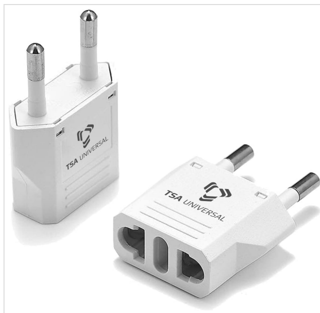
Image: Two TSA Universal travel adapters. One adapter is shown from the side, displaying its two round pins for insertion into a wall outlet. The other adapter is shown from the front, revealing two slots designed to accept a North American Type A or B plug.

This document provides essential information for the safe and effective use of your TSA Universal Travel Power Adapter, designed for connecting North American electrical plugs to Turkish outlets. This adapter facilitates the use of your personal electronic devices during international travel.