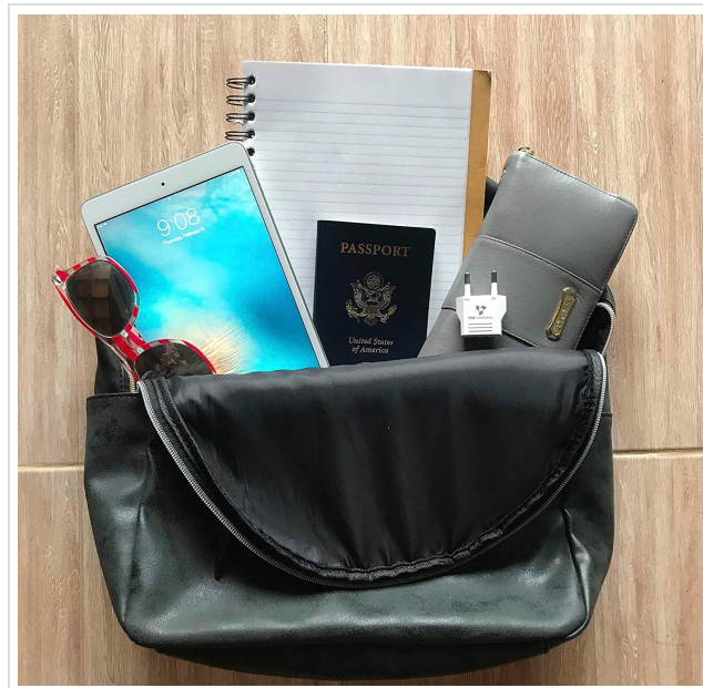
Image: The TSA Universal travel adapter is shown packed neatly inside a black travel bag, alongside other essential travel items such as a tablet, a US passport, sunglasses, and a notebook. This illustrates the compact size and portability of the adapter, making it suitable for travel.

For support or warranty claims, please contact Vericonic LLC, the manufacturer of TSA Universal products. Refer to your purchase documentation or the Vericonic website for contact details.