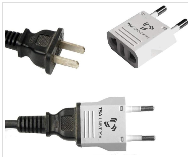
Image: A standard North American two-prong electrical plug (black) is shown being connected to the TSA Universal travel adapter (white). This illustrates the first step of connecting your device to the adapter.