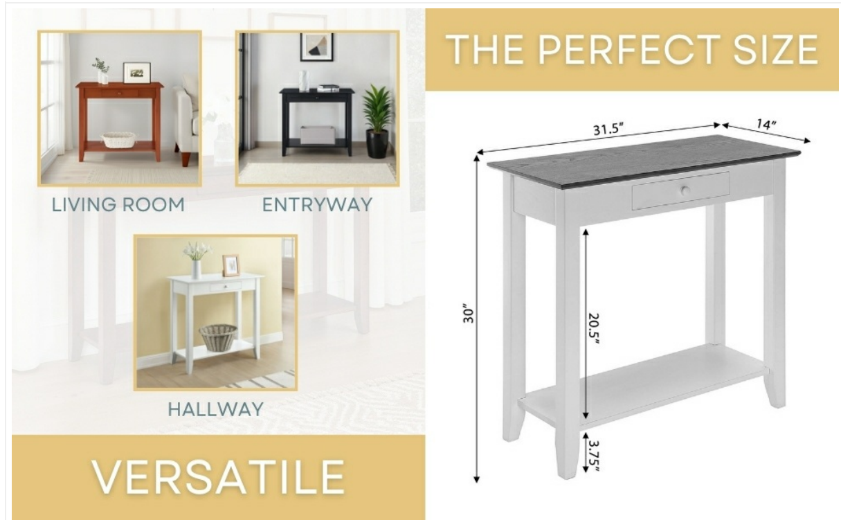
Figure 3: Product dimensions for planning placement.