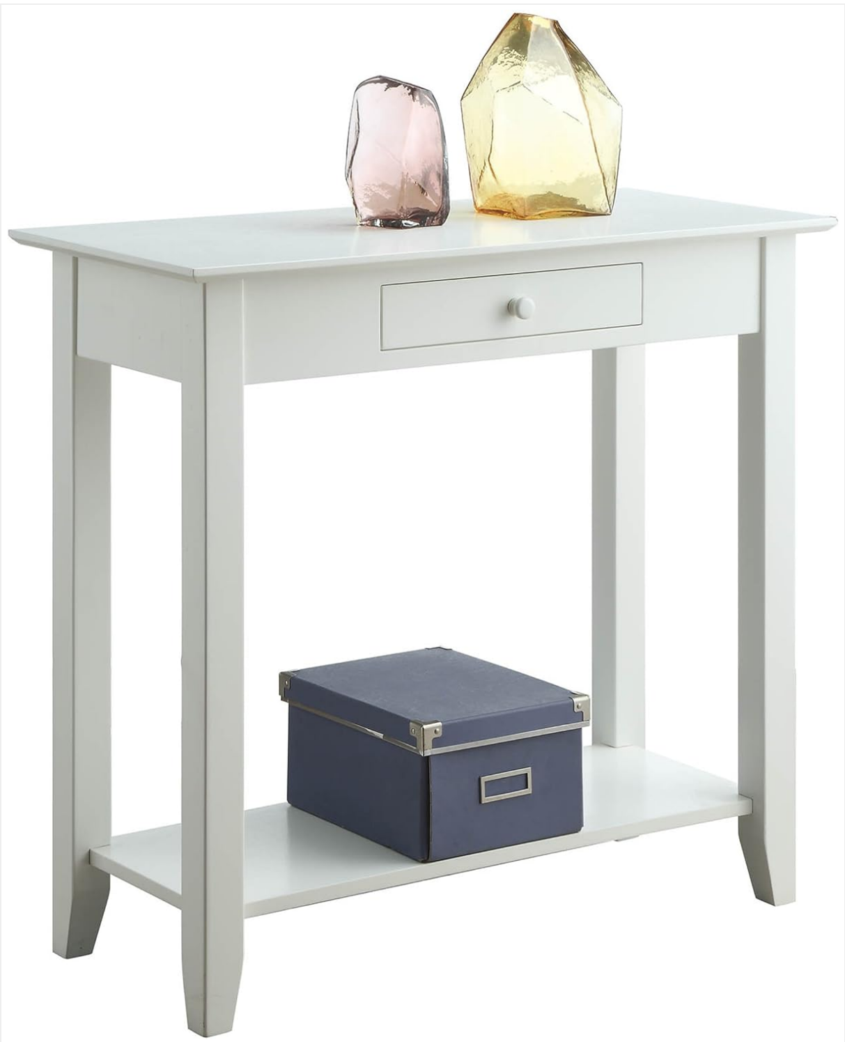
Figure 5: Example of using the bottom shelf for storage.