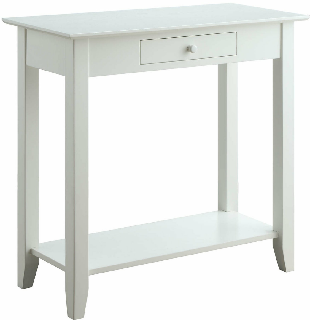
Figure 1: Front view of the American Heritage Hall Table in White.