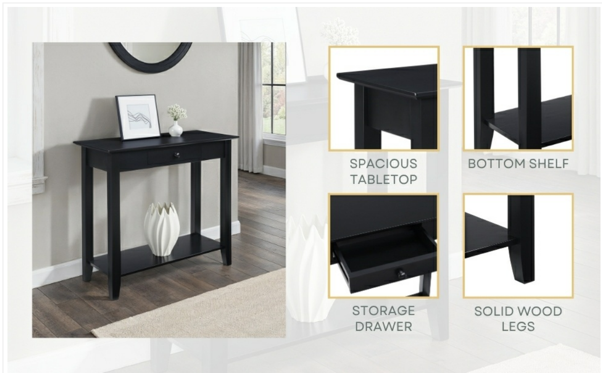
Figure 2: Visual representation of key table features.