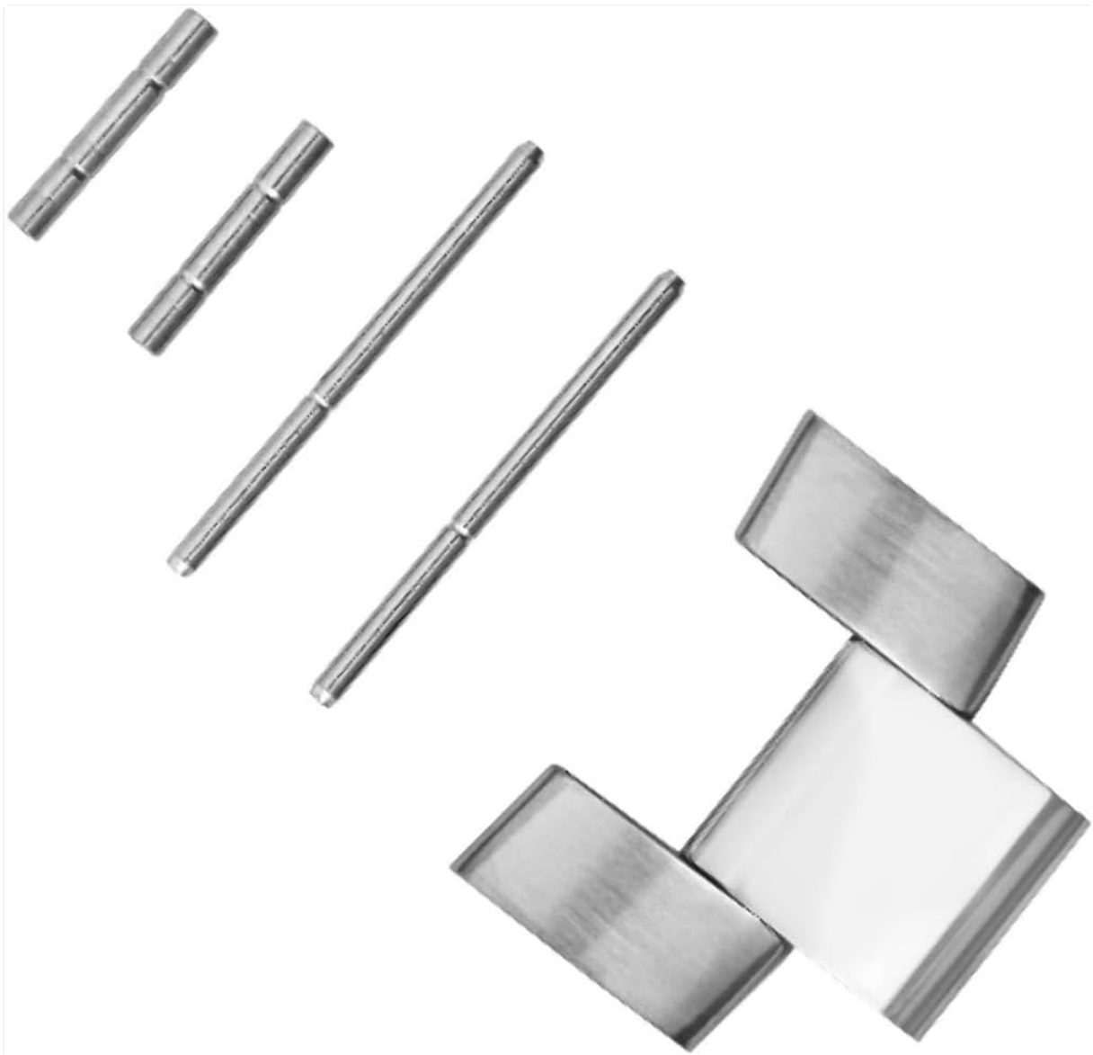
Figure 2.1: Ewatchparts replacement watch band link with included pins. The link features a shiny center and matte sides.